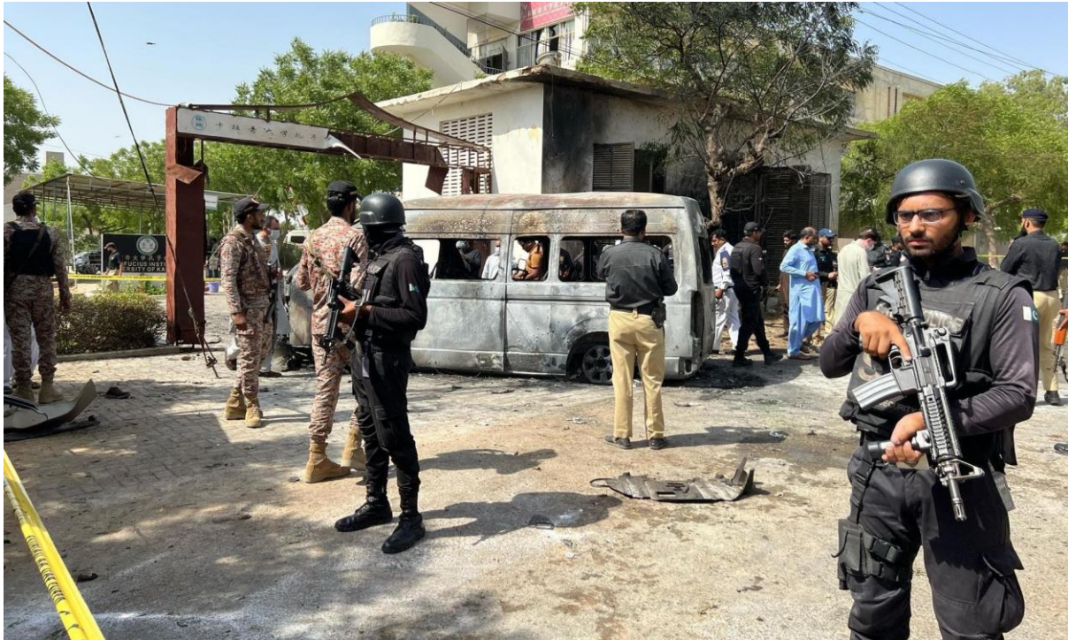
Officials at the site of blast, Karachi University, April 26, 2022.

The attack was claimed by the Baloch Liberation Army (BLA), which said in an email: "Targeting director and officials of Confucius institute, the symbol of Chinese economic, cultural and political expansionism, was to give a clear message to China that its direct or indirect presence in Balochistan will not be tolerated." The BLA also claimed that hundreds of its "highly-trained male and female members" are ready to carry out "harsher" attacks in future. 52