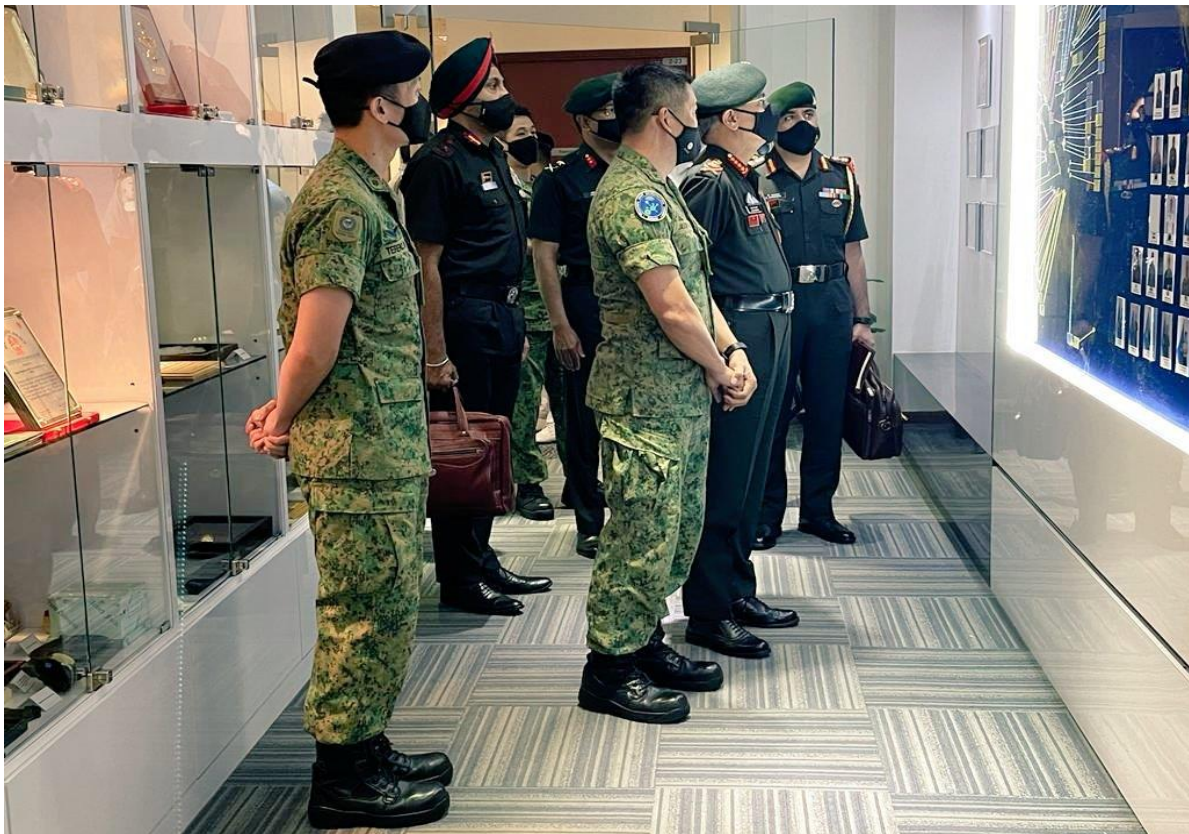
COAS General MM Naravane visited the Regional HADR Coordination Centre & Information Fusion Centre at Singapore where he was briefed about the Coordination of a Multi-Nation HADR Response Mechanism & measures to enhance Maritime Security, April 6, 2022.