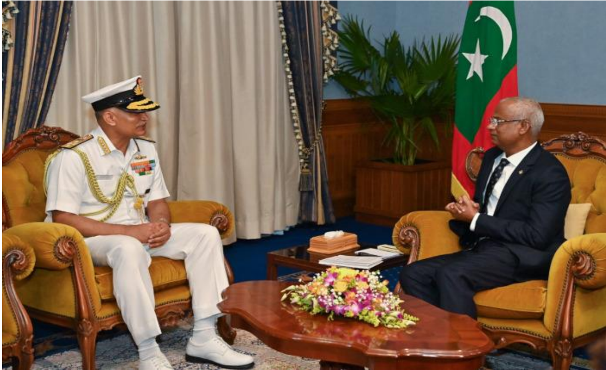
In his first overseas visit after assuming the office of the Chief of Naval Staff (CNS), Admiral R Hari Kumar visited Maldives from 18 to 20 April 2022 where he was called on HE Mr Ibrahim Mohamad Solih, President of the Republic of Maldives.