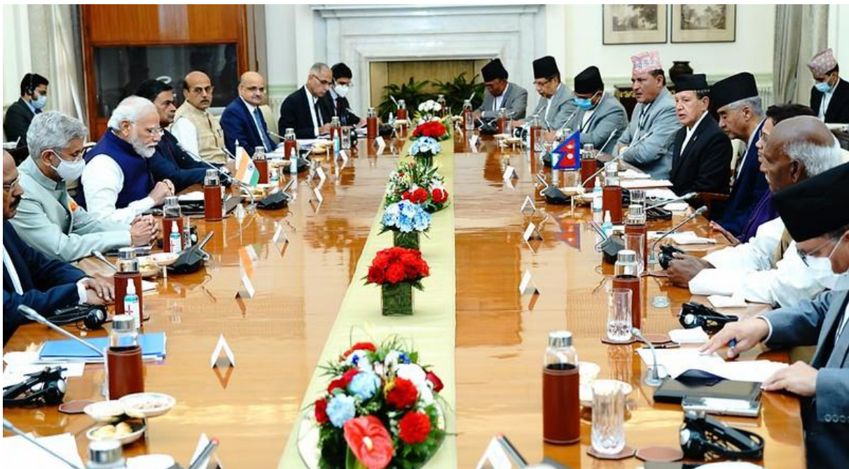
Delegation level talks led by Prime Minister Narendra Modi and Prime Minister of Nepal Sher Bahadur Deuba held on April 2, 2022.

On the lingering border dispute in the Kalapani area of the border, PM Deuba sought its resolution through a bilateral mechanism, while India on its part urged Nepal not to "politicize" the issue.