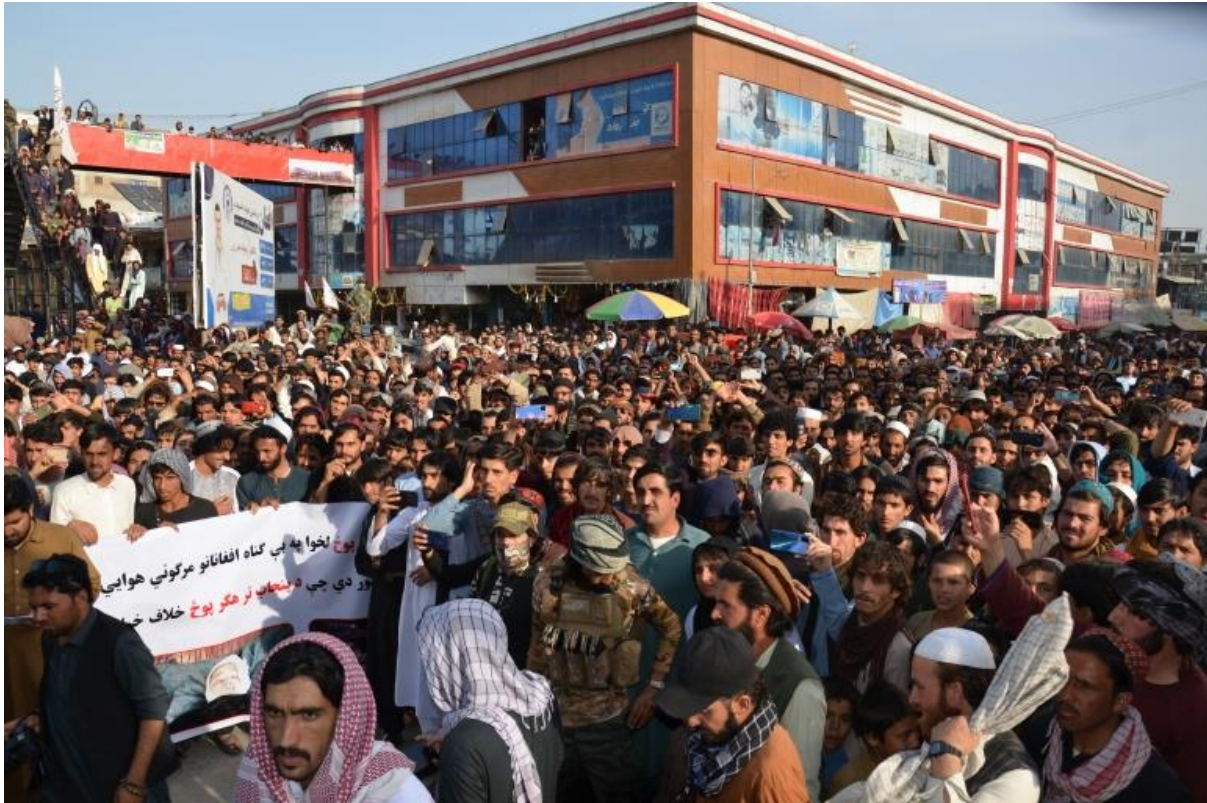
Demonstrators in Afghanistan's Khost province took to the streets to protest against Pakistani air raids along the border on April 16, 2022.

Representative in Afghanistan has confirmed that at least 20 children had been killed in the attacks of April 16. 25