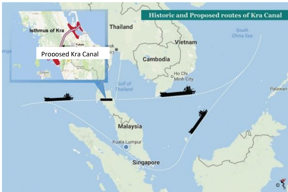
Proposed route of Kra Canal