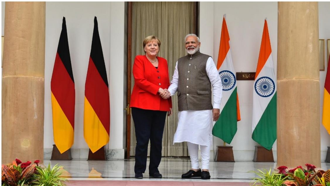
Prime Minister Modi with German Chancellor Angela Merkel during the Chancellor's visit to New Delhi from October 31 – November 2.

German Chancellor Angela Merkel visited India along with a delegation from 12 ministries for a three-day visit from October 31 to November 2 for the Fifth Biennial Inter-Governmental Consultations (IGC). This was the Chancellor's fourth official visit to India. During her visit, Chancellor Merkel and Prime Minister Modi discussed trade and investment between the two countries as well as foreign policy and security issues. India and Germany signed five joint Declarations of Intent after the talks. Further, 11 pacts were inked between the two countries across sectors such as space, civil aviation, maritime technology, medicine and education. The full list of MOUs/ Agreements signed during the visit can be accessed here . She also called on the President of India Ram Nath Kovind. The President said that India and Germany should work together to strengthen multilateralism and a multi-polar world order.