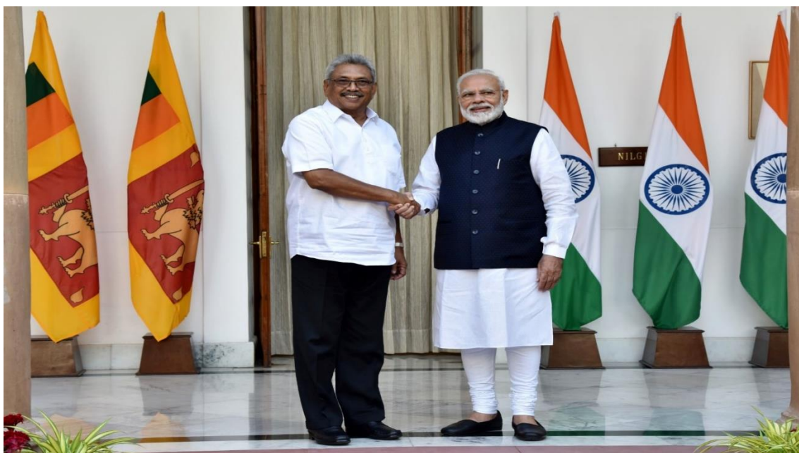
Prime Minister Narendra Modi met President Gotabaya Rajapaksa at Hyderabad House, New Delhi on November 29, 2019.

Newly elected President of the Democratic Socialist Republic of Sri Lanka, H.E. Gotabaya Rajapaksa was on a three-day state visit to India from November 28 to 30. This was his first official visit as President. During the visit, Rajapaksa held delegation level talks with Prime Minister Narendra Modi and also called on President Ram Nath Kovind. PM Modi announced that India will lend $400 million to boost infrastructure and development in Sri Lanka and another special Line of Credit of 50 million dollars to Sri Lanka to combat terrorism. India and Sri Lanka have also agreed to early use the previously announced $100 million credit line for solar projects in Sri Lanka.