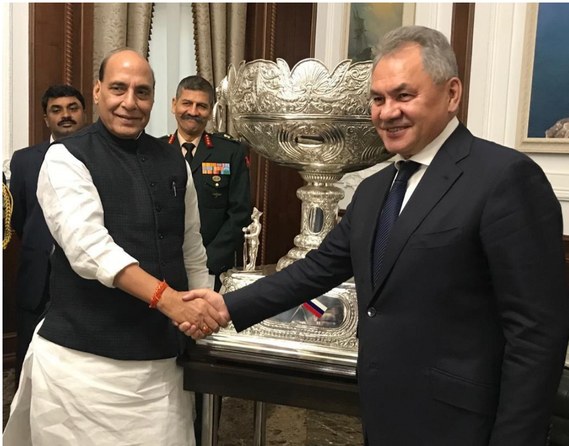
Defence Minister Shri Rajnath Singh with his Russian counterpart General Sergei Shoigu in Moscow on November 6.

Defence Minister of India Shri Rajnath Singh visited the Russian Federation on November 5-7 to co-chair the 19 th India-Russia Inter-Governmental Commission on Military and Military Technical Cooperation (IRIGC-M&MTC) along with his counterpart Russian Defence Minister General Sergei Shoigu in Moscow. Rajnath Singh held an in-depth discussion with General Shoigu on a range of international issues of common concern, including Russian operations in Syria. Rajnath Singh also met with Russian Minister of Industry and Trade Mr. Denis Manturov to jointly inaugurate the 'India-Russia Defence Industry Cooperation Conference'. In an address to the CEOs of Original Equipment Manufacturers, Rajnath Singh called upon the Russian Defence industry to jointly manufacture defence platforms and equipment with India in order to boost the nations' exports to third countries.