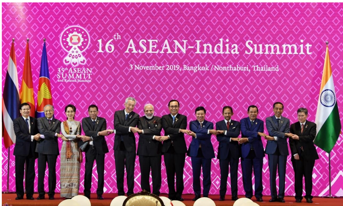
Group photo of the Heads of State / Heads of Government at 16th India-ASEAN Summit in Bangkok on November 03, 2019.

Apart from the summits, the Prime Minister also held bilateral discussions with leaders of Vietnam , Australia , Japan , Myanmar , Indonesia and Thailand . The PM reviewed the progress made in the bilateral relationship with each of these countries and also made note of the frequent high-level meetings and exchanges at all levels. Views on regional and multilateral issues of mutual interest were also exchanged.