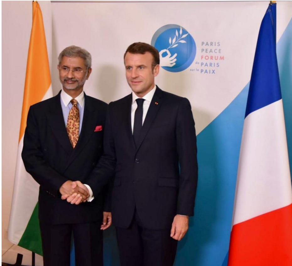
The External Affairs Minister of India met with French President Emmanuel Macron during the Paris Peace Forum on November 12.