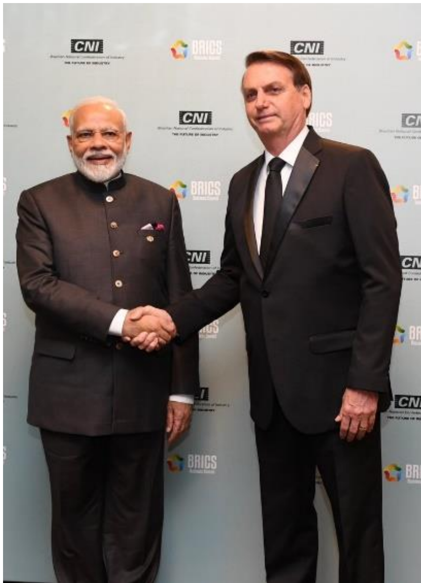
Prime Minister Narendra Modi met with Brazilian President Jair Bolsonaro during the 2019 BRICS Summit.

His meeting with the Russian President focused on reviewing the progress made in the bilateral relationship since the PM's visit to Vladivostok in September 2019 for the Eastern Economic Forum and the India-Russia Annual Summit. The two leaders also noted with satisfaction that the USD 25 billion target of bilateral trade by 2025 has already been achieved.