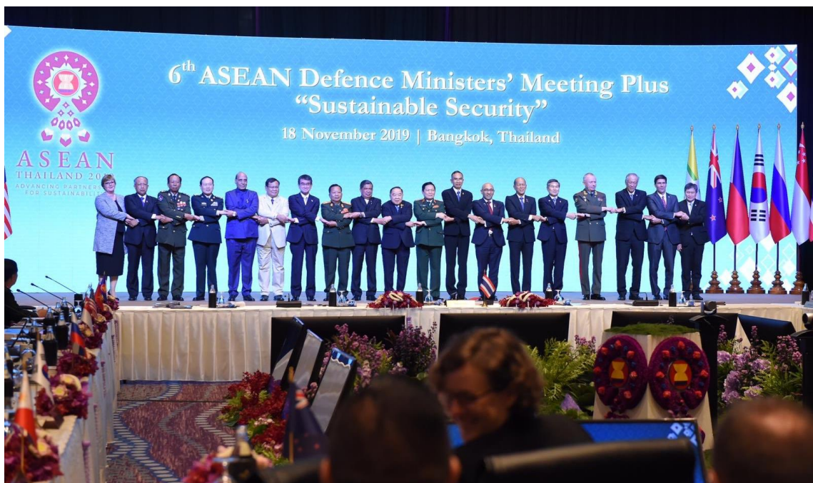
Defence Minister Shri Rajnath Singh attended the 6 th ASEAN Defence Ministers' Meeting Plus on "Sustainable Security" in Bangkok on November 18.

On the sidelines of ADMM-Plus, the Defence Minister held bilateral meetings with US Secretary of Defence Dr Mark T Esper, Deputy Prime Minister of Thailand General Prawit Wongsuwan, Defence Minister of Japan Mr Taro Kono, Defence Minister of Australia Ms Linda Reynolds and Defence Minister of New Zealand Mr Ron Mark. In the deliberations, the RM reviewed the entire gamut of bilateral defence relations with the respective leaders and discussed ways to further improving the ties.