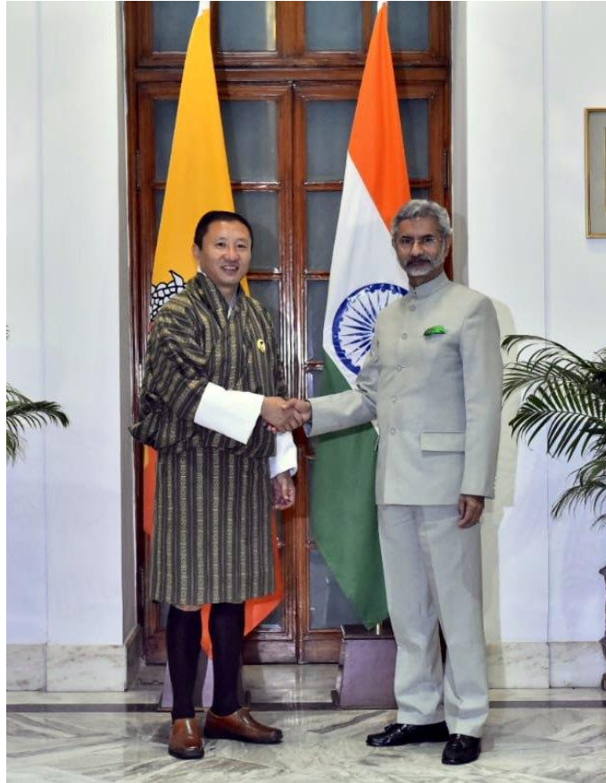
The External Affairs Minister of India with the Minister of Foreign Affairs of Bhutan H.E. Lyonpo (Dr.) Tandi Dorji who was on an official visit to India from November 17 to 23.

EAM Dr. Jaishankar and the Foreign Secretary Mr. Vijay Gokhale called on him. The two sides reviewed the entire gamut of India-Bhutan relations. Foreign Minister Dorji also called on the Union Home Minister Amit Shah in which they discussed the historically close ties between the two nations and agreed to further strengthen the bilateral relationship in the future.