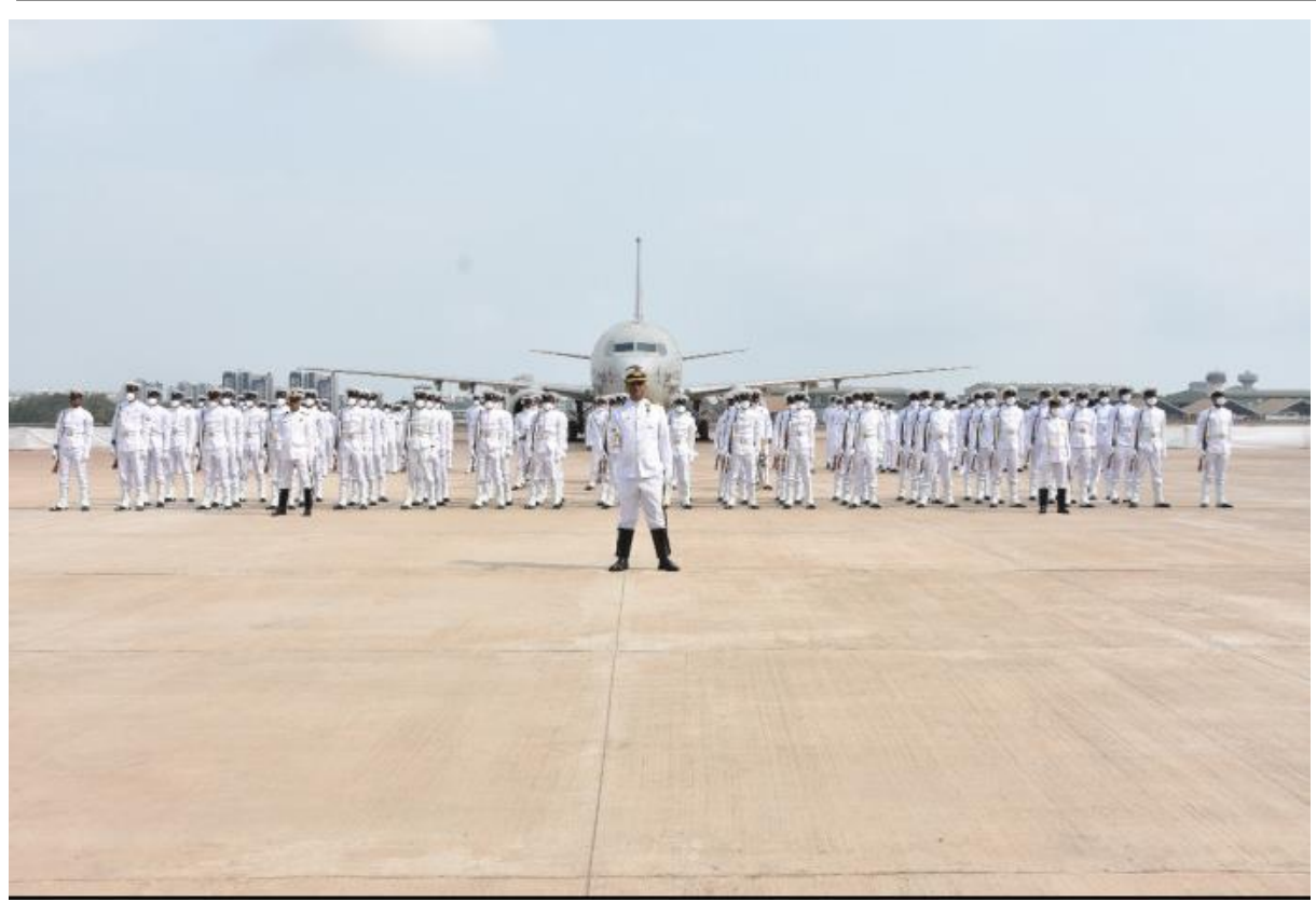
The Commissioning Ceremony of INAS 316 at Goa on March 29, 2022.

Singapore Prime Minister Lee Hsien Loong paid a working visit to Washington DC and met President Biden on March 29. The leaders reaffirmed the US-Singapore partnership and welcomed three new areas of cooperation: the renewal and expansion of the MoU to deepen cooperation on infrastructure development in the Indo-Pacific; the establishment of a bilateral cyber dialogue; and Singapore's signing of the Artemis Accords.<sup>81</sup>. The Joint Statement issued on the occasion draws attention to Singapore's unique status as a Major Security Cooperation Partner; the 5,400 US companies working out of Singapore and close cooperation between the two nations. If focuses on two broad pillars: upholding the rules-based international order and driving inclusive prosperity and addressing emerging challenges<sup>82</sup>.