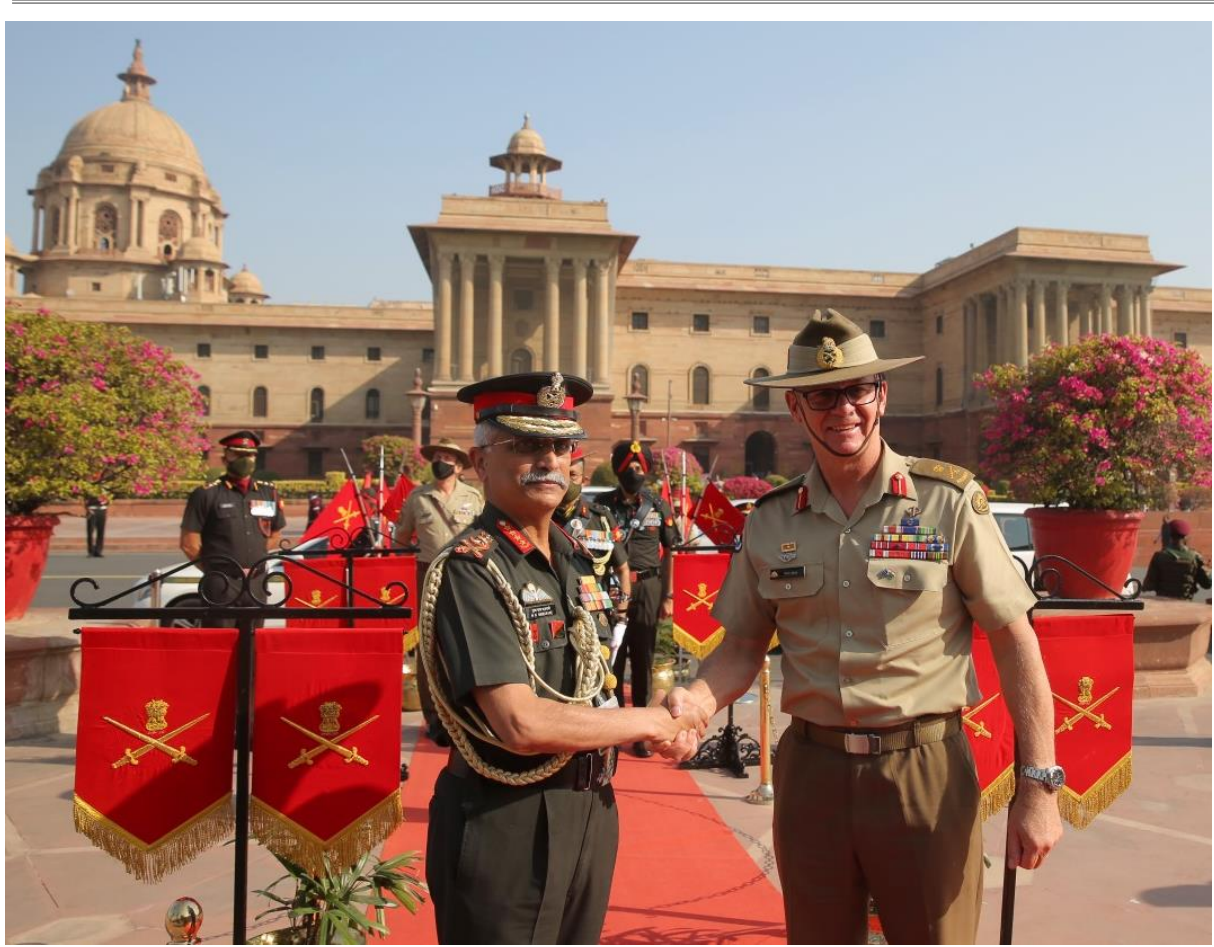
General MM Naravane, COAS, received Lt Gen Richard Maxwell Burr, Chief of the Australian Army, at South Block on March 09, 2022.

Japan revised interpretation of its guidelines on the transfer of defence equipment overseas as the country prepared to send supplies to conflict-hit Ukraine<sup>112</sup>. Its principles had earlier prohibited transfers to a country which is party to a conflict<sup>113</sup>. The updated guidelines now state, "defense equipment assigned by the defense minister based on the SDF law can be provided to Ukraine, which has been invaded in violation of international law".