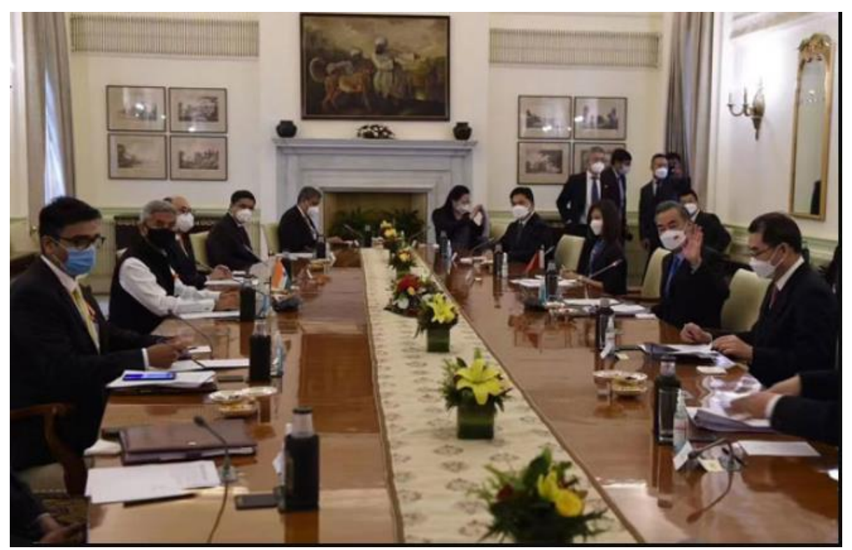
China's Foreign Minister Wang Yi and India's External Affairs Minister Dr. S. Jaishankar at Hyderabad House on March 25, 2022.

countries, addressing areas of strategic risk and maintaining open lines of communication.