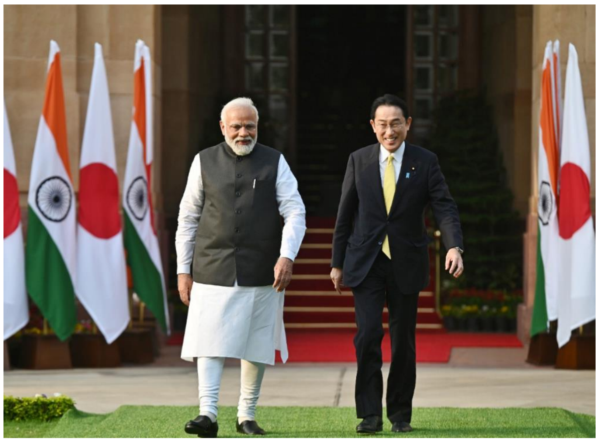
Prime Ministers Narendra Modi and Kishida Fumio meet at Hyderabad House, March 19, 2021.

An op-ed by Prime Minister Fumio Kishida on the morn of his first bilateral visit abroad, to India on March 19, 2022, identified protecting the rules-based international order, reinvigorating the post-Covid global economy through resilient supply chains, reforming international organisations and responding to new international challenges like climate change and cybersecurity as the focal areas of his planned exchanges with Prime Minister Modi<sup>20</sup>. He described India as the best partner to have when seeking to realise his pet 'new form of capitalism,' "as showcased in India's contribution in response to the global health crisis as a major manufacturing base, leadership in decarbonisation efforts, including through the International Solar Alliance, engagement in advanced digital society initiatives such as Aadhaar, and the promotion of economic security initiatives, including measures for supply chain resilience"<sup>21</sup>. On these counts and more, he will count his visit to India as a success.