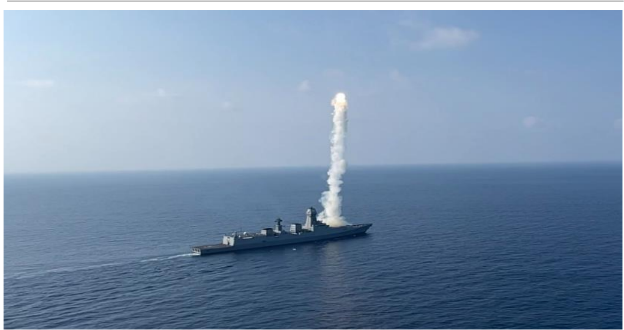
Successful test of a Brahmos Land Attack Cruise Missile from INS Chennai on March 5, 2022.

China announced a proposed defence budget of 1.45 trillion Yuan (about $230 billion) for FY 2022, marking a 7.1 year increase over last year's budget of 1.35 trillion Yuan<sup>73</sup>. In comparison, the US Defense Budget for FY 2022 is $740.3 billion<sup>74</sup> and that for India in FY 2022-23 is about $70.6 billion<sup>75</sup>.