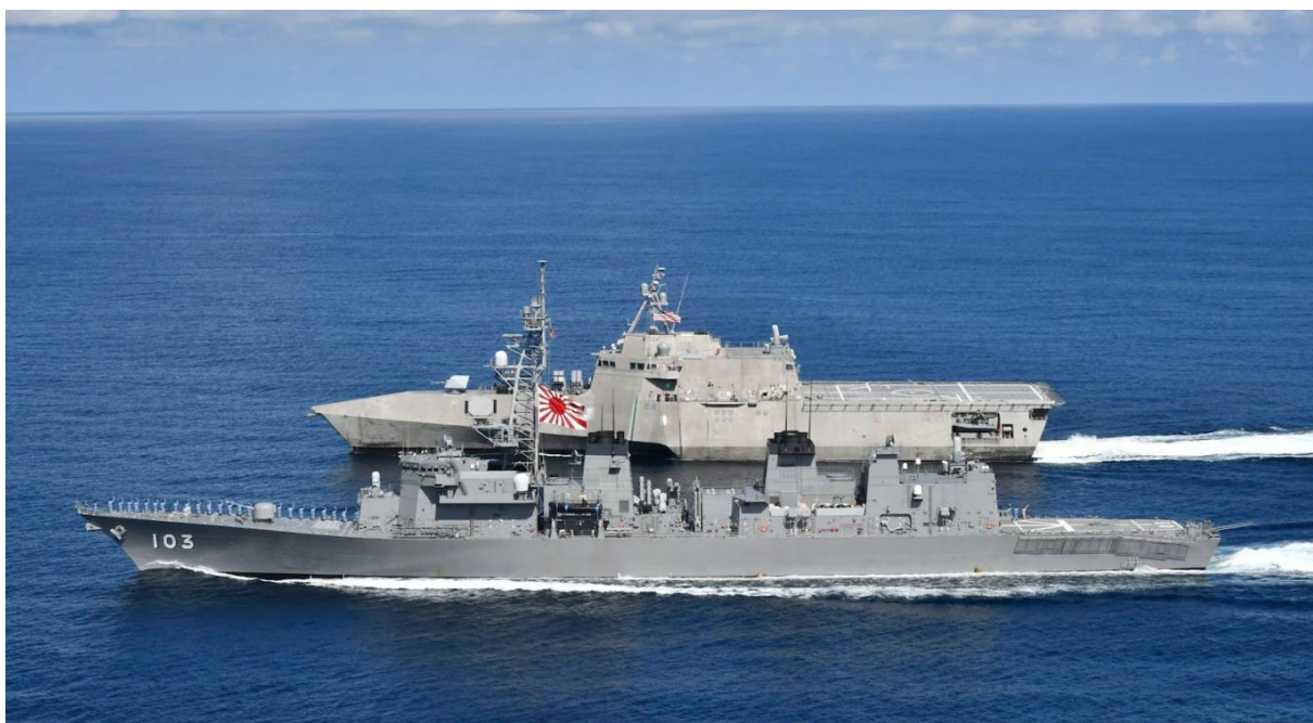
USS Jackson and JS Yudachi Sail Together in the South China Sea, November 1, 2021.