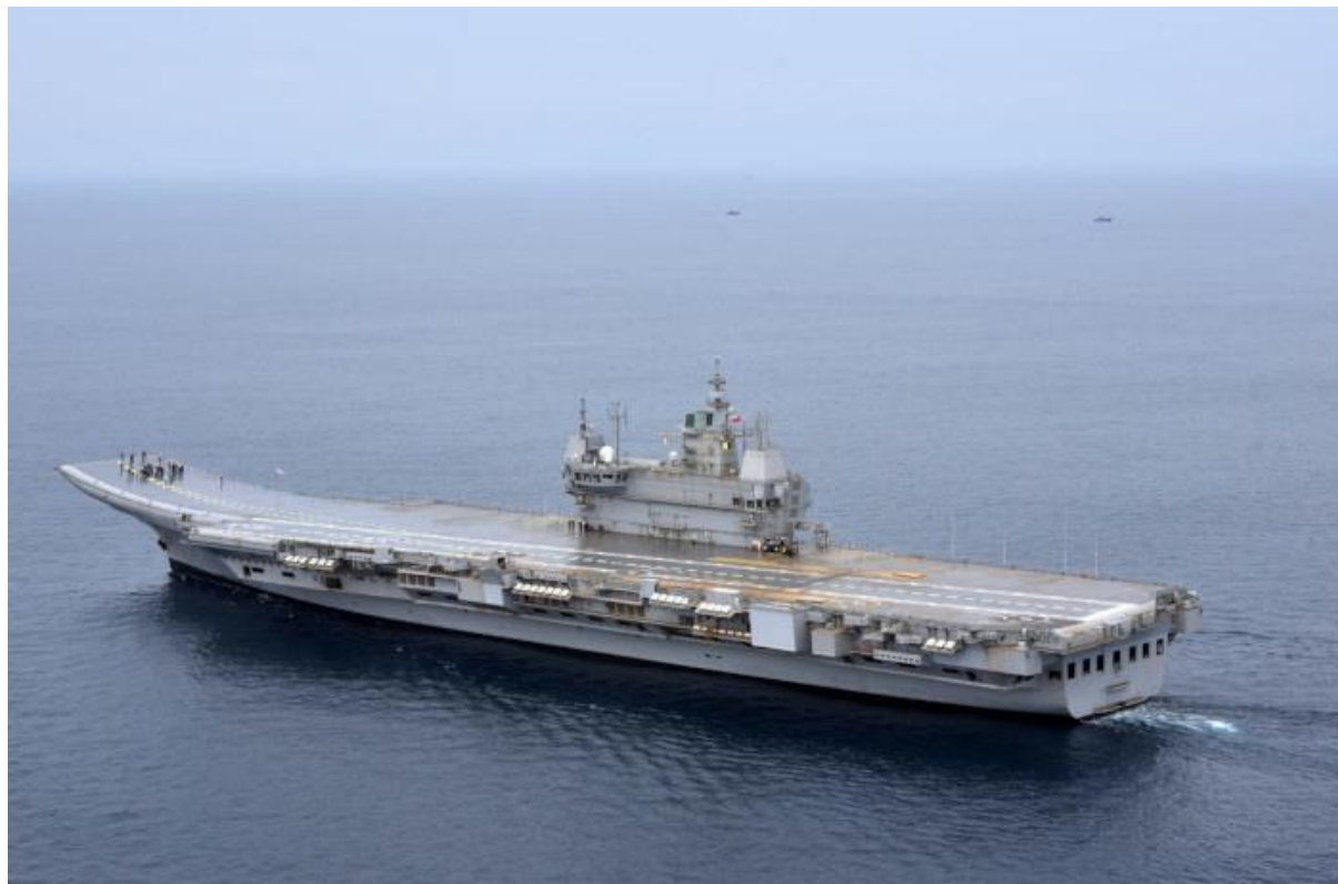
IAC-1 Vikrant Undergoing her Second Sea Trial, end October 2021.

deliver the ship by April 2022, so as to enable its commissioning by August 15, 2022 67 .