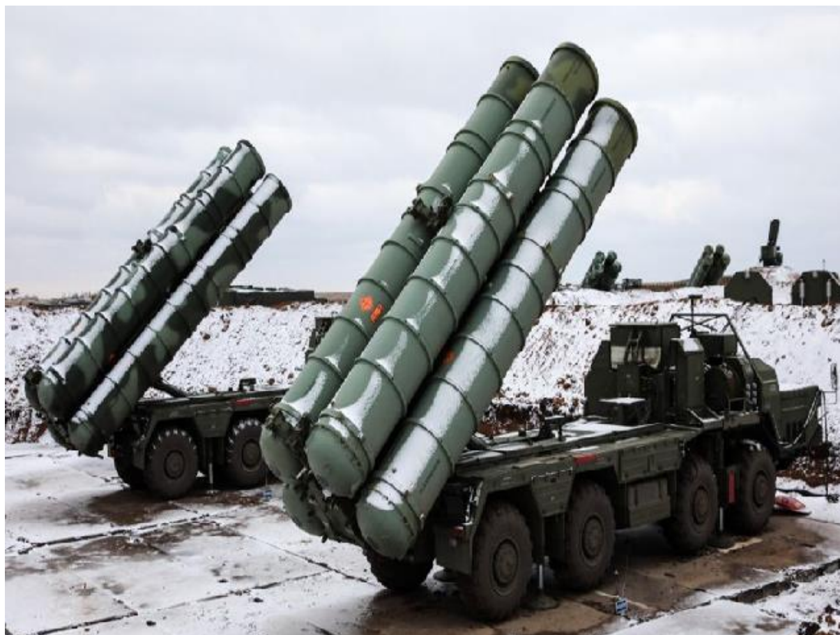
The S-400 Missile Defence System.

the previous day had indicated that Russian President Vladimir Putin would visit India in the second week of December for the annual summit, to coincide with delivery of the first batch of the S-400 AD systems and to renew India-Russia military technical cooperation for the next decade 30 (the Summit has now been scheduled for December 06 31 , with the inaugural India – Russia 2+2 Dialogue preceding it 32 ). The inference is that delivery of the first of the five batteries contracted for by India will be completed by then. The issue of sanctions under CAATSA, as mandated by US law, thus becomes live.