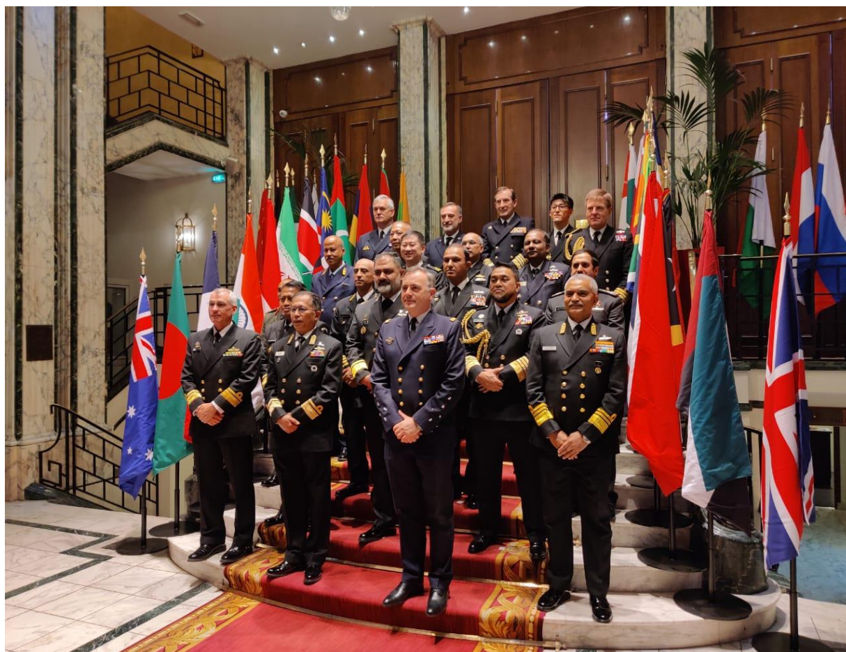
The IONS Conclave of Chiefs in Paris on November 15-16, 2021.