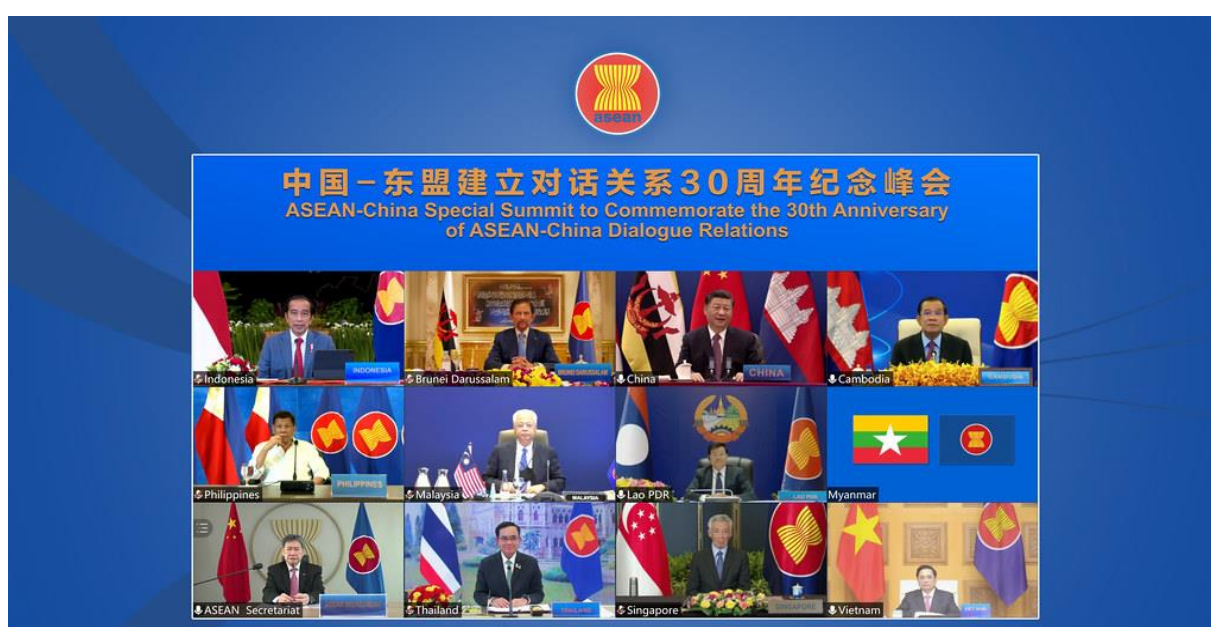
ASEAN Leaders and President Xi Jinping at the ASEAN – China Special Summit on November 22, 2021.

with the Belt and Road Initiative. Under political-security cooperation, it reiterated facades such as mutual respect for each other's independence, sovereignty and territorial integrity in accordance with international law and the principle of non-interference in the internal affairs of other countries, while reaffirming the adherence of ASEAN countries to the one-China policy. It committed to enhancement of frequent high-level exchanges and policy communication, of dialogue and coordination in ASEAN-led frameworks, the strengthening of defence and security cooperation through frameworks and mechanisms like the ADMM-Plus and ARF, and to jointly addressing non-traditional security threats and challenges including terrorism and transnational crime.