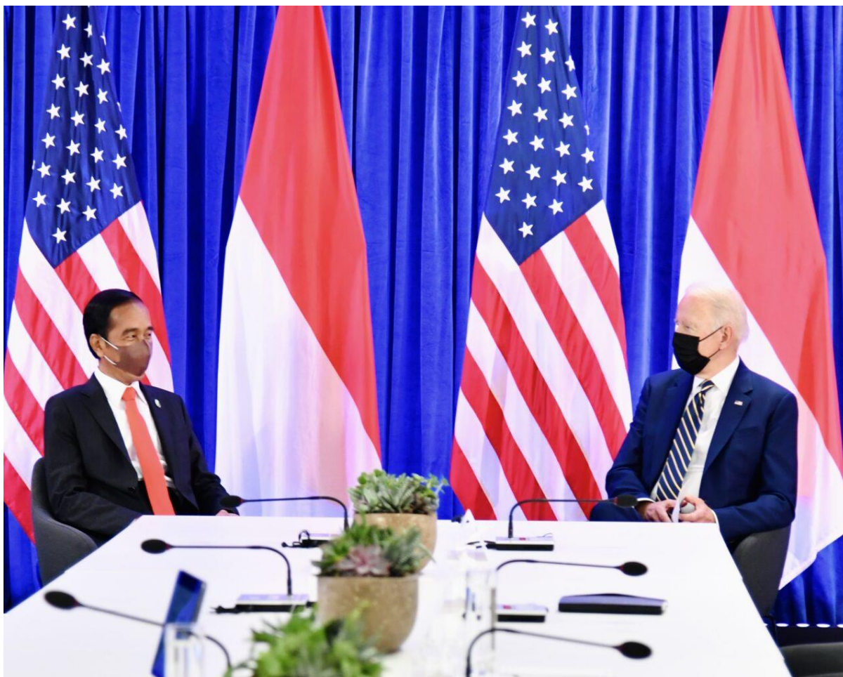
Presidents Joko Widodo and Joe Biden at their Summit in the White House, November 1, 2021.

the PRC; expanding jurisdiction of existing US investment restrictions targeting Chinese entities; erosion of US strategic nuclear superiority; requiring publicly traded companies with facilities in China to report the presence of CCP committees in their operations; ensuring Chinese authorities sanctioned by one US authority are automatically sanctioned under other authorities; mandating an annual updated of accurate US portfolio investment in China; and sanctions on products originating from Xinjiang for congressional action.