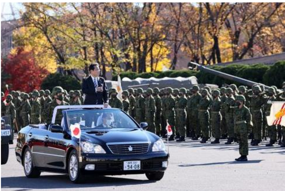
Prime Minister Fumio Kishida Reviews Japanese Troops on the Anniversary of the Establishment of the Japanese Self Defence Force, November 27, 2021.

representatives make up the majority of members in these bodies 78 . Its junior ruling partner Komeito won another 32 seats. Fumio Kishida, who had assumed office on October 4, 2021, continued as the Prime Minister. His 20 member cabinet team included Yoshimasa Hayashi as the Minister for Foreign Affairs; Shunichi Suzuki as the Minister of Finance and Nobuo Kishi as the Minister for Defence 79 . Erstwhile Foreign Minister Toshimitsu Motegi, who assumed charge as the LDP Secretary General, signalled the party's intention to promote discussions on constitutional amendment, given that favourably inclined lawmakers now constitute more than two-thirds of the membership of both houses of parliament 80 .