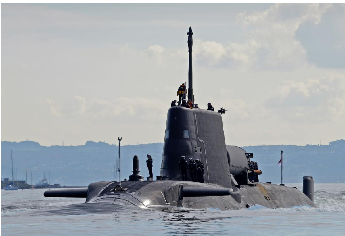
HMS Astute.

HMS Astute, the British SSN accompanying CSG 21, was reported to have visited Perth, the first such visit after the announcement of AUKUS in September 96 . A Press Release by Australia's Defence Minister said that the ship's company had "conducted a 14 day quarantine period prior to entering Australia and will abide by all COVID-19 restrictions set by the Western Australian Government (the entire crew was effectively in quarantine on board throughout their period at sea) 97 . The visit was ostensibly intended to provide the submarine crew a short respite after a prolonged period at sea. It also served to expose the submarine to Australian naval personnel even as their government wrestled with which SSN would be built for the RAN. On November 19, President Biden formally approved AUKUS and determined that "performance of the agreement will promote and will not be an unreasonable risk to the common defense and security". He authorised "execution of the agreement in a manner specified by the Secretary of State" 98 . Australia's