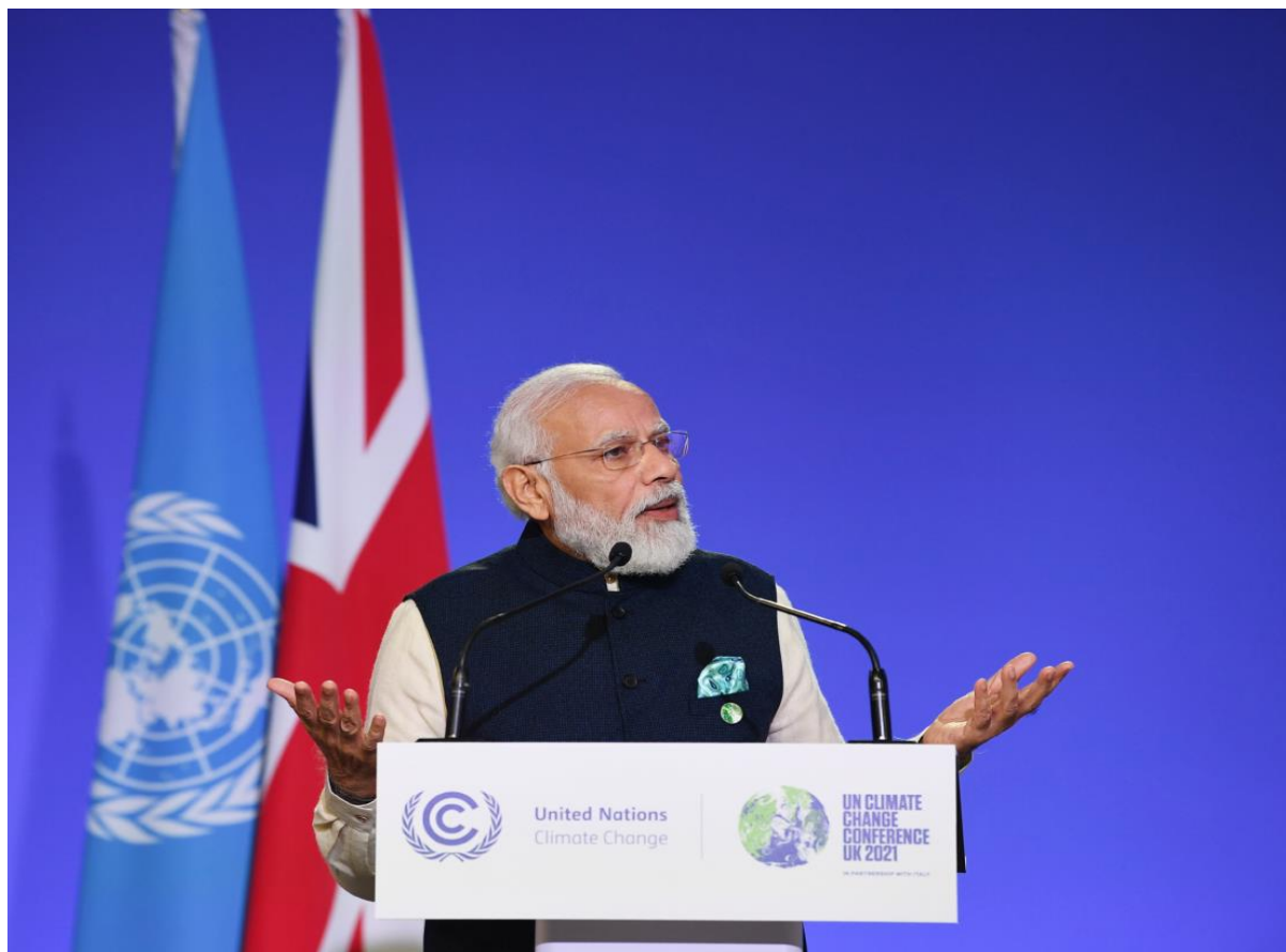
Prime Minister Narendra Modi at the COP 26 Summit in Glasgow, November 2, 2021.

solar energy to address climate change, but also open a new avenue for cooperation between different regions and countries.