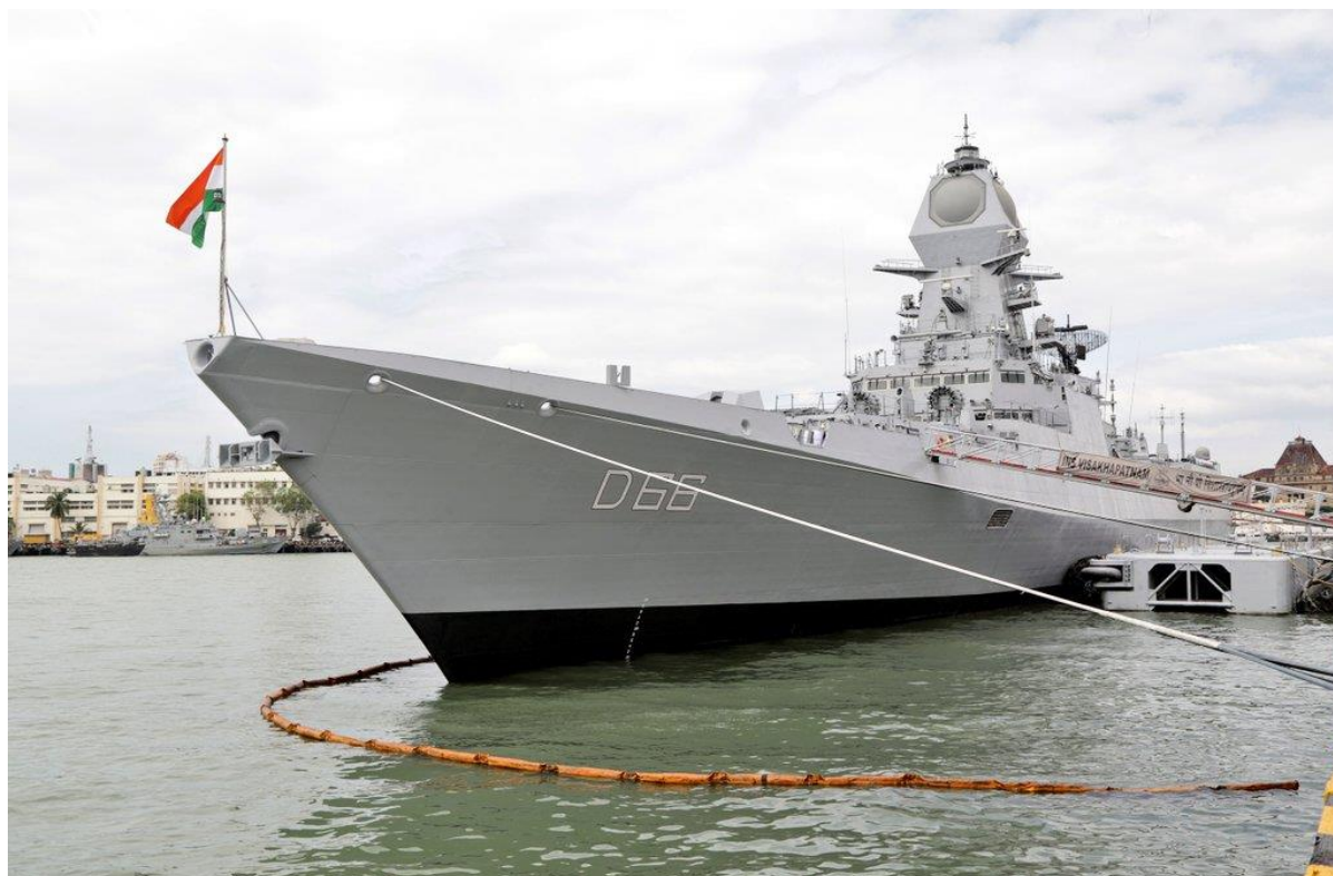
INS Visakhapatnam at Mumbai.

ship/land attack missiles, a twin 76mm naval gun, AK 630 CIWS, RBU-6000 ASW rocket launchers and 533 mm torpedo tubes. Sensors include modern air, surface search and multi-function radars and a bow-mounted sonar. The ship has an indigenous EW suite, indigenous launchers for missile decoys, an advanced indigenous torpedo defence system and an indigenous communications intelligence suite. Its capabilities are extended by two on-board medium helicopters. In sum, it is among the most powerful ships in the region, and the most modern destroyers in the world.