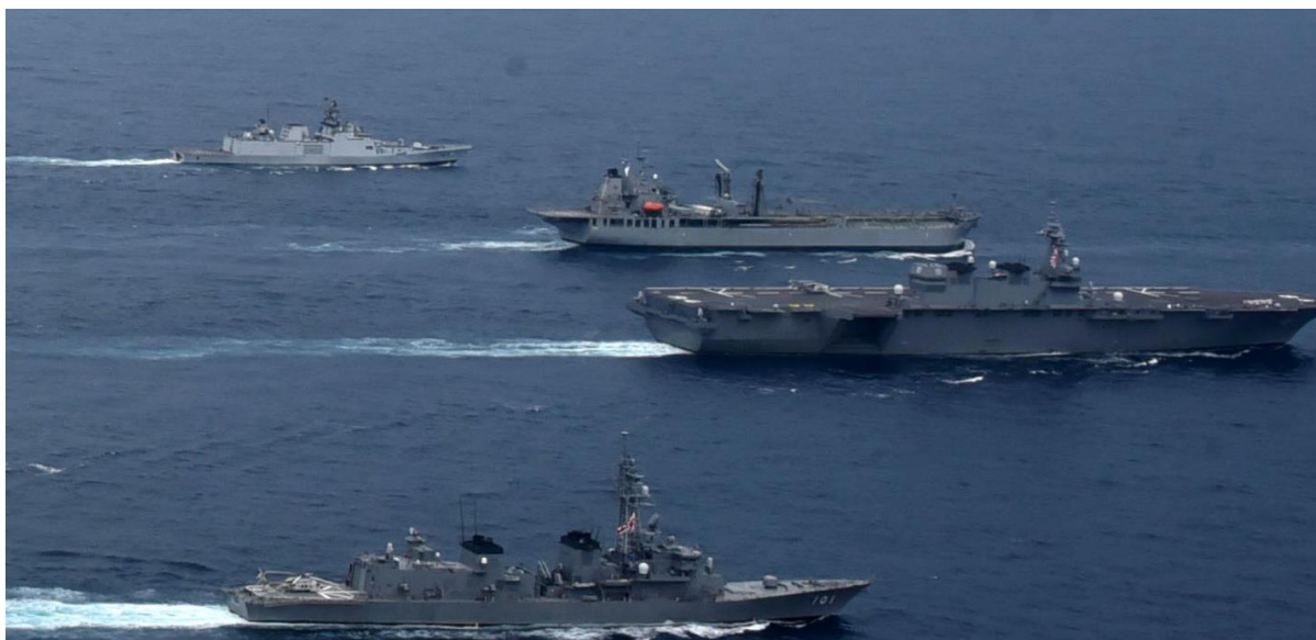
Ships from Quad Countries Participating in Ex Malabar in the Arabian Sea, October 2021.

capacity to deal with the unknown. He emphasised that India was ready to do its share, and more, in tackling these problems and cited numerous examples where India had responded, demonstrating solidarity with partners and commitment to the principles of humanitarianism.