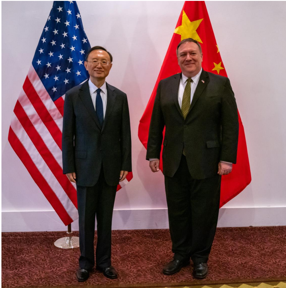
Secretary of State Mike Pompeo and CCP Politburo member Yang Jiechi meeting in Hawaii, June 17, 2020

Secretary of State Pompeo and his Chinese counterpart Yang Jiechi met in Hawaii on June 17, 2020 in an effort to manage a relationship that has deteriorated in the recent past. Discussions reportedly focused on Hong Kong, Taiwan and Xinjiang.