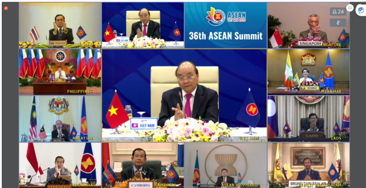
36th ASEAN Summit, conducted virtually, hosted by Vietnam on June 26, 2020

and may undermine peace, security and stability in the region”, making it the strongest statement by ASEAN on the issue till date. It went on to reaffirm “the need to enhance mutual trust and confidence, exercise self-restraint in the conduct of activities that would complicate or escalate disputes and affect peace and stability and avoid actions that may further complicate the situation, and pursue peaceful resolution of disputes in accordance with universally recognised principles of international law, including the 1982 UNCLOS. We reaffirmed that the 1982 UNCLOS is the basis for determining maritime entitlements, sovereign rights, jurisdiction and legitimate interests over maritime zones, and the 1982 UNCLOS sets out the legal framework within which all activities in the oceans and seas must be carried out”. ASEAN has belatedly recognised the need for “enhancing mutual trust and confidence and of UNCLOS being the guiding principle for determining maritime entitlement” at a time when China has repeatedly demonstrated that it will not be bound by international law in making territorial assertions in the global commons of the South China Sea.