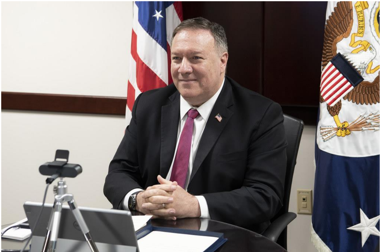
U.S. Secretary of State Mike Pompeo addresses the Brussels Forum organised by the German Marshall Fund, June 25, 2020

India (along with Kenya, Mexico, Ireland and Norway) was elected as a non-permanent member of the UN Security Council for a two year term beginning January 1, 2021. The United Nations commemorated the 75 th anniversary of the signing of the UN Charter on June 26, 2020. The draft commemorative declaration saw the US, UK, Australia, Canada, New Zealand and India objecting to the inclusion of the phrase “to realise our shared vision of a common future” which was proposed by China and supported by Russia, Pakistan and Syria. A British statement explained the rationale for the objection. The declaration, as finally delivered , did not include the phrase.