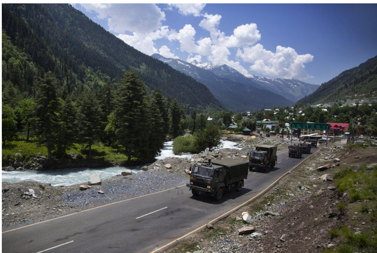
An Indian army convoy moves on the Srinagar- Ladakh highway at Gagangir, north-east of Srinagar, India on June 17, 2020.

dismantled, and that drawing parallels with that earlier conflict would be a grave error of judgement. An erstwhile Special Secretary in India's Cabinet Secretariat sought the jettisoning of the terms 'non-alignment' and 'strategic autonomy' from India's diplomatic lexicon and suggested 'strategic alignment' instead. On the other hand, a former National Security Adviser opined that this was not the right time for India to be seen as fronting for a US-led coalition seeking to put China in its place, highlighting a continuing divide in thinking. Irrespective of these viewpoints, there were indications that the continuing border standoff will mark an epochal change in India's outlook towards China and at the very least, a return to business as usual was unlikely.