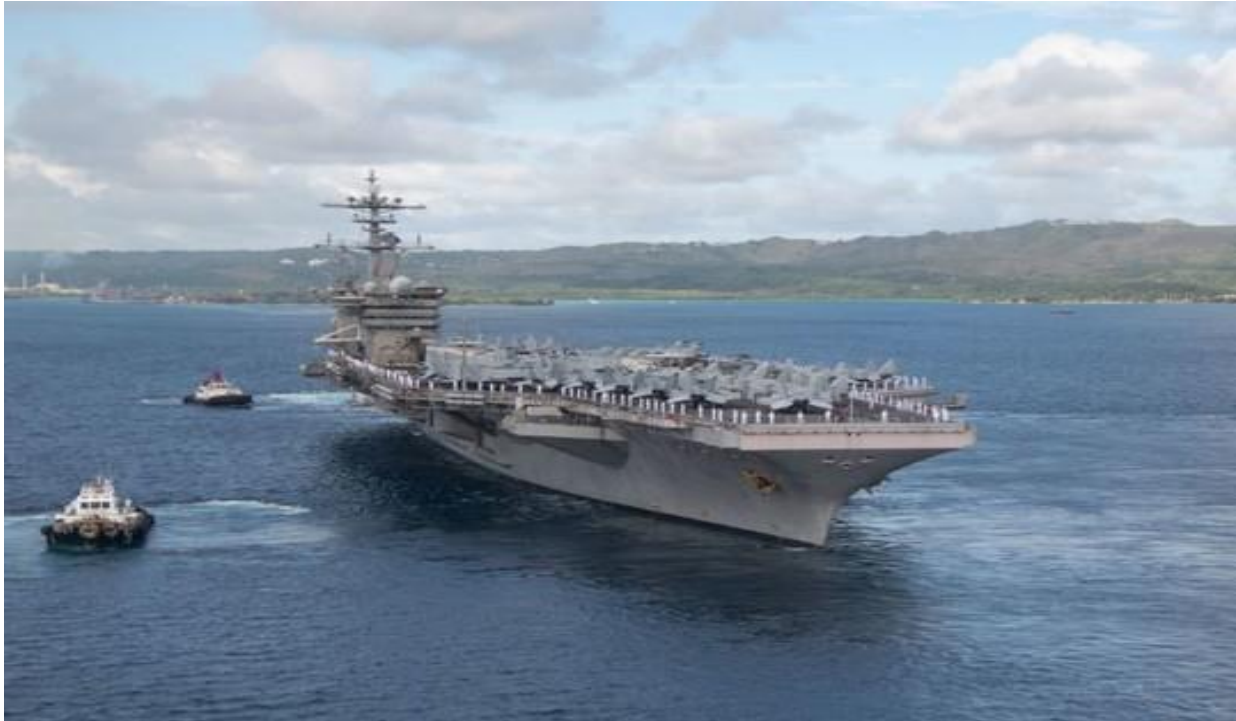
USS Theodore Roosevelt leaving Apra Harbour, Guam, to return to operational status, June 4, 2020.

squadron Air Force; imparts a thrust to creating a modern, lethal and innovative force with a combat credible forward posture to counter the challenge from Russia and China; and reshapes Pentagon management for better performance, accountability and effectiveness. It also establishes a Pacific Deterrence Initiative on the same lines as the Atlantic Deterrence Initiative.