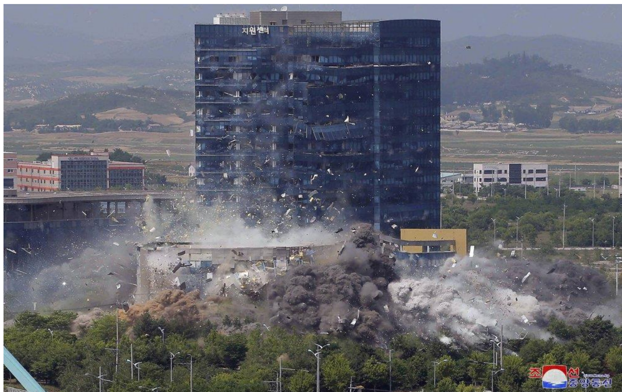
Demolition of the inter-Korean liaison office building in Kaesong, North Korea on June 16, 2020.

China condemned flights of US military aircraft over Taiwan, describing these as a "severe breach of international law and basic norms guiding international relations". It urged the United States to abide by the One-China Principle and immediately stop such unlawful acts.