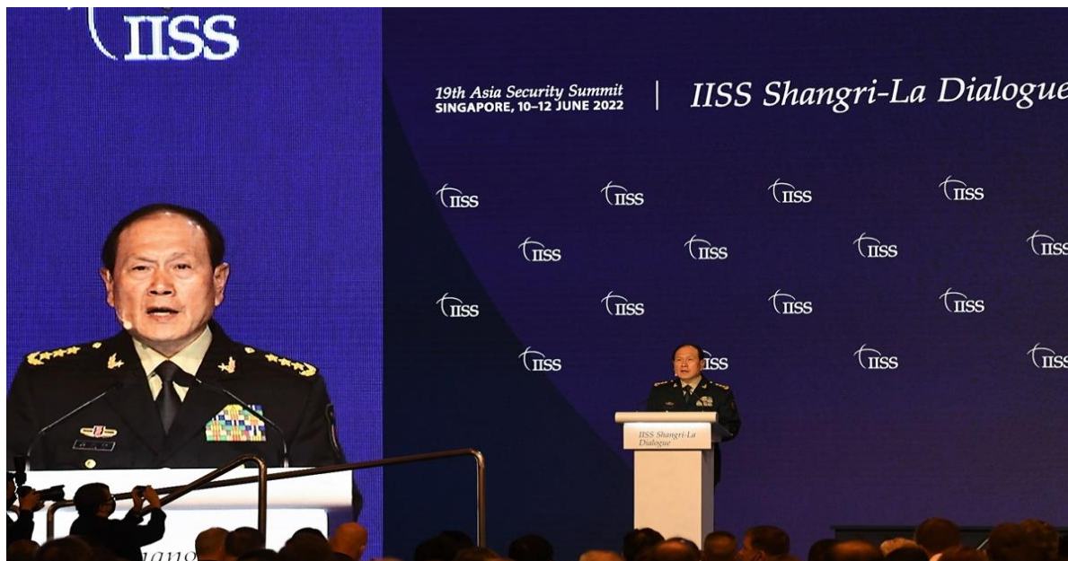
Chinese Defence Minister, Wei Fenghe, speaks at the Shangri-La Dialogue in Singapore, June 12, 2022.

Secretary of Defence Lloyd J. Austin III had his first interaction with Chinese Defence Minister Gen. Wei Fenghe on June 10, on the margins of the Shangri-La Dialogue in Singapore.