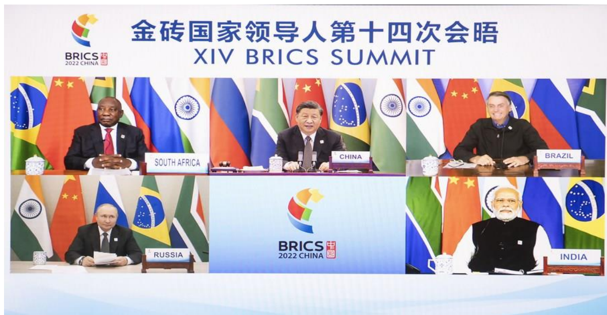
Prime Minister Narendra Modi attends the 14 th BRICS Summit hosted by China, June 23, 2022.

countries to “uphold openness and inclusiveness to strengthen industrial and supply chains while fostering a spirit of innovation”. 82 Amidst the unprecedented western sanctions on Russia, President Xi Jinping warned that sanctions being a “double-edged sword” , will “inflict suffering on everyone”. 83