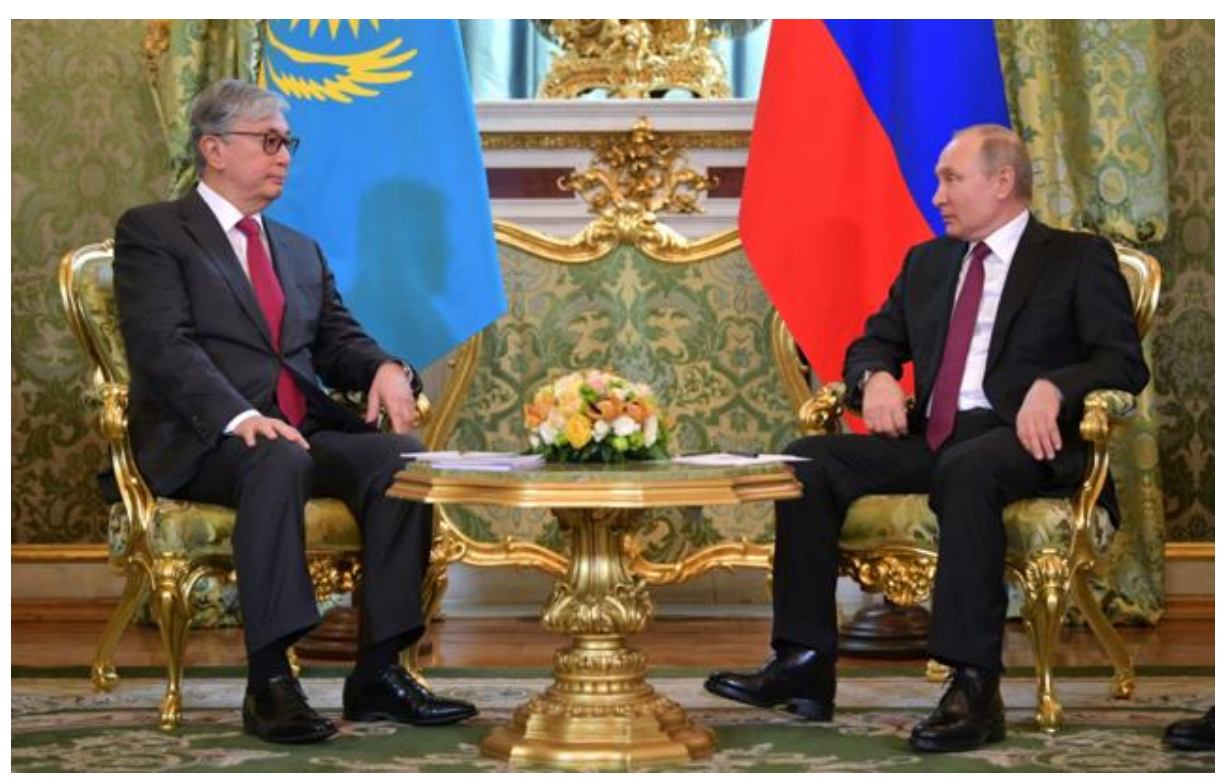
Russian President Putin meeting Kazakh President Kassym-Jomart Tokayev at the Kremlin, April 3, 2019.

The reality is that a new generation of Central Asians has grown up in a much more Islam-infused environment since the Soviet collapse. Mosques have been built and renovated all over the region with the funding coming from the Arab countries and from Turkey. Wearing of the hijab and burka by women has long become a symbol of an increasing Islamic influence, despite legislation being passed in Tajikistan requiring people to "stick to traditional clothes and culture". <sup>13</sup> People offering mass prayers in the open air had become a practice in Kyrgyzstan a decade ago. This time the protesters in Almaty were seen conducting mass prayers in the open air.