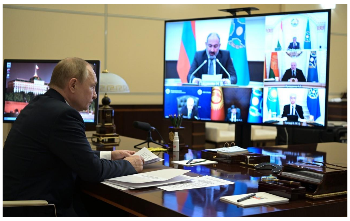
Russian President Vladimir Putin attending a virtual emergency meeting of the Council of the Collective Security Treaty Organization (CSTO) at the Novo-Ogaryovo state residence, January 10, 2022.

instigated by 'international terrorists' to undermine the country's territorial integrity.