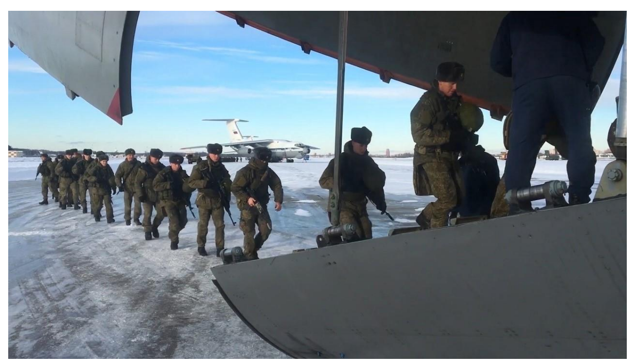
Russian-led CSTO troops begin withdrawing from Kazakhstan after their peacekeeping operation, January 13, 2022.

Diplomatically, Kazakhstan is bound with Russia by numerous multilateral treaties, such as the CIS, CSRO, and Eurasian Economic Union (EAEU), ensuring that it remains steadfastly within Moscow's orbit.