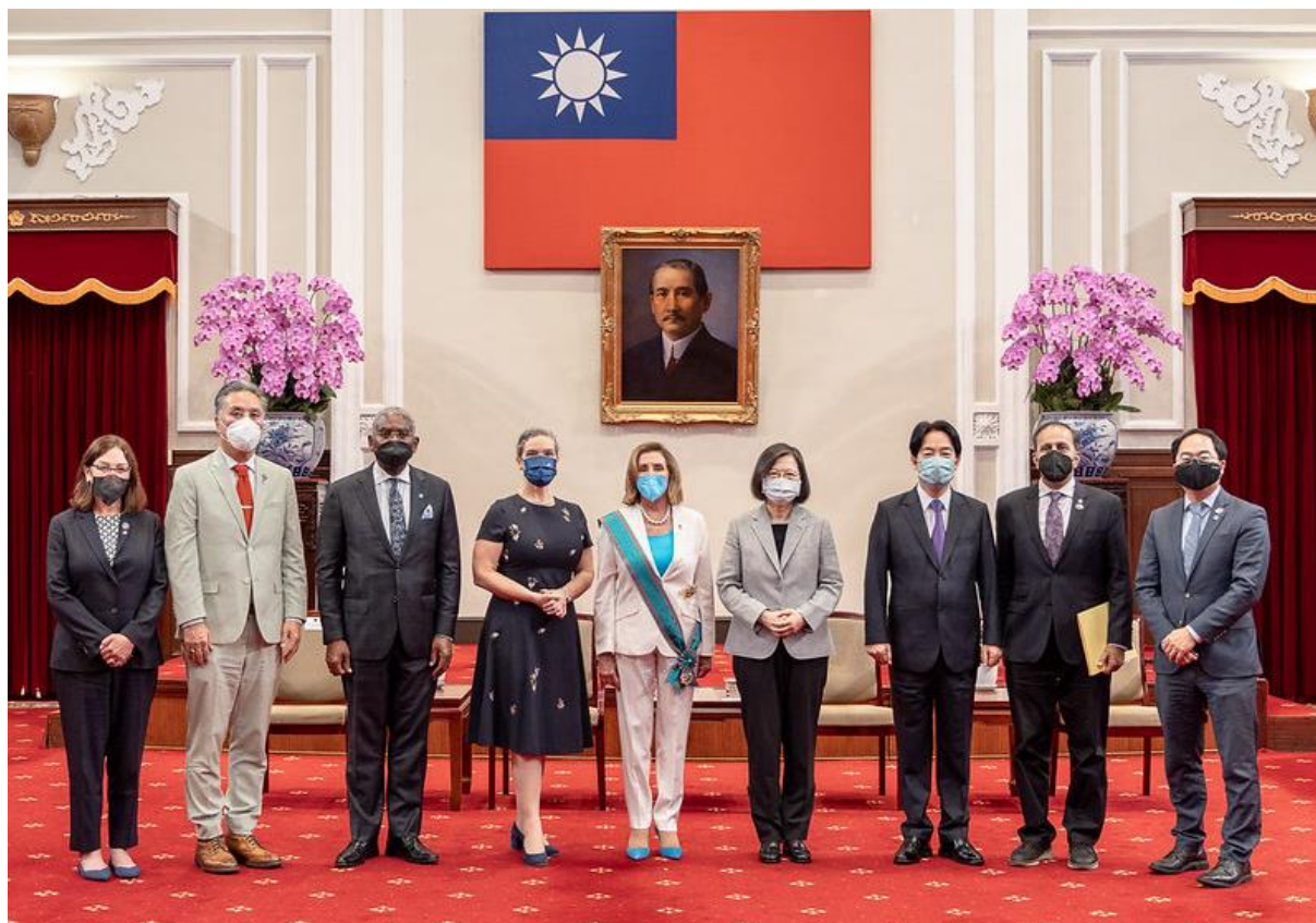
US House Speaker Nancy Pelosi and Members of her Delegation with Taiwan's President Tsai Ing-wen at the Presidential Office, August 03, 2022.

The stated purpose, set out in an editorial by the Speaker 4 , was to reaffirm the US commitment under the Taiwan Relations Act of 1979, at a time when Beijing had dramatically intensified tensions with Taiwan. She added, "Our congressional delegation's visit should be seen as an unequivocal statement that America stands with Taiwan, our democratic partner, as it defends itself and its freedom" 5 . Pelosi reiterated this in Taiwan, when she said, "Today, our delegation ... came to Taiwan to make unequivocally clear: we will not abandon our commitment to Taiwan, and we are proud of our enduring friendship" 6 .