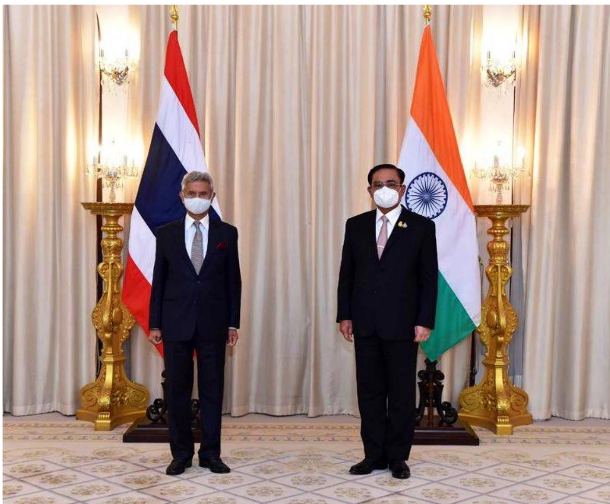
India's External Affairs Minister Dr. S. Jaishankar meets Thai Prime Minister Prayut Chan-o-cha in Bangkok, Thailand on August 17, 2022.

The US Military Sealift Command's Lewis and Clark-class dry cargo ships USS Charles Drew conducted maintenance at the Larsen and Toubro Ltd Shipyard in Kattupalli from August 7-17, 2022 91 . Maintenance conducted includes repairs to safety and crew habitability systems and equipment. It may be recalled that the Joint Statement of the US-India 2+2 Ministerial Dialogue in April this year had recorded, "both sides agreed to explore possibilities of utilizing the Indian shipyards for repair and maintenance of ships of the US Maritime Sealift Command (MSC) to support mid-voyage repair of US Naval ships" 92 . The repair, done in an Indian shipyard for the first time ever, marks a new chapter for deeper engagement between India and the US 93 .