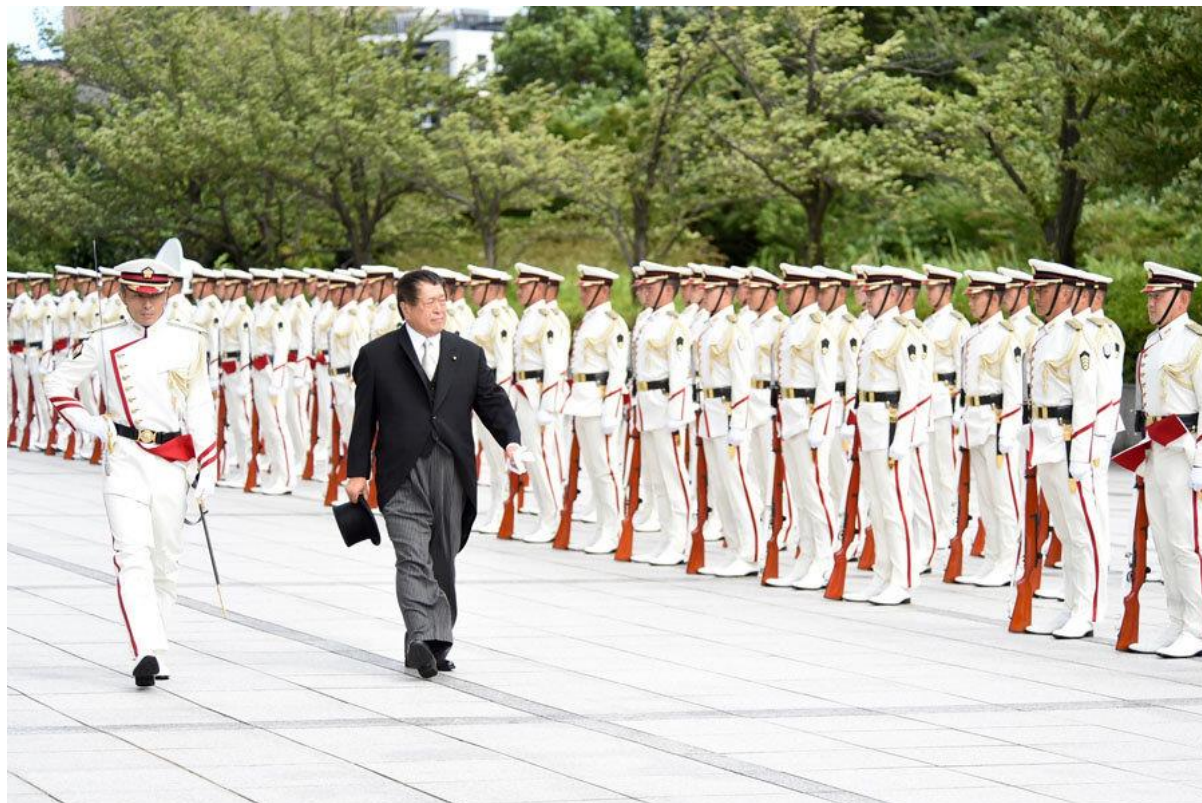
Japan's Defense Minister Yasukuza Hamada Reviews a Guard of Honour on August 12, 2022.

of the US economic and military footprint in the region, however, remains to be seen.