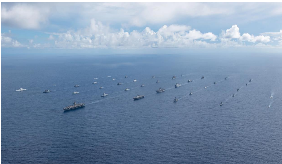
Participating ships sail in formation off Hawaii during Exercise RIMPAC 2022 on July 28, 2022.

sector 70 . It defines maritime security in terms of upholding laws, regulations and norms to deliver a free, fair and open maritime domain, and identifies five focal objectives towards which the government will work over the next five years: protecting the homeland; responding to threats; ensuring prosperity; championing British values; and supporting a secure, resilient ocean.