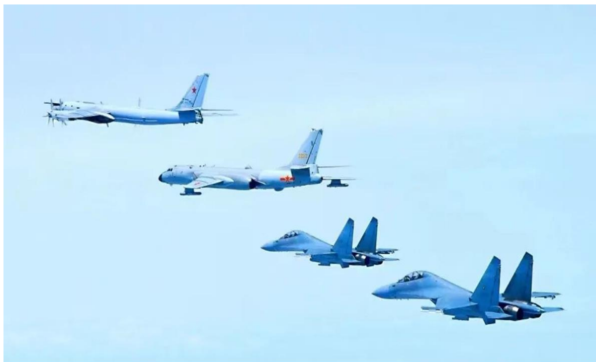
Chinese and Russian aircraft exercise together in the Sea of Japan, May 24, 2022.

The aftermath of the Pelosi visit included China publishing its third white paper on Taiwan on August 10. Titled "The Taiwan Question and China's Reunification in the New Era" 25 , the paper follows "The Taiwan Question and Reunification of China" published in August 1993 26 and "The One-China Principle and the Taiwan Issue" published in February 2000 27 . It is intended to demonstrate the resolve of the Communist Party of China (CPC), reiterate that Taiwan is a part of China and re-emphasise the CPC's position and policies.