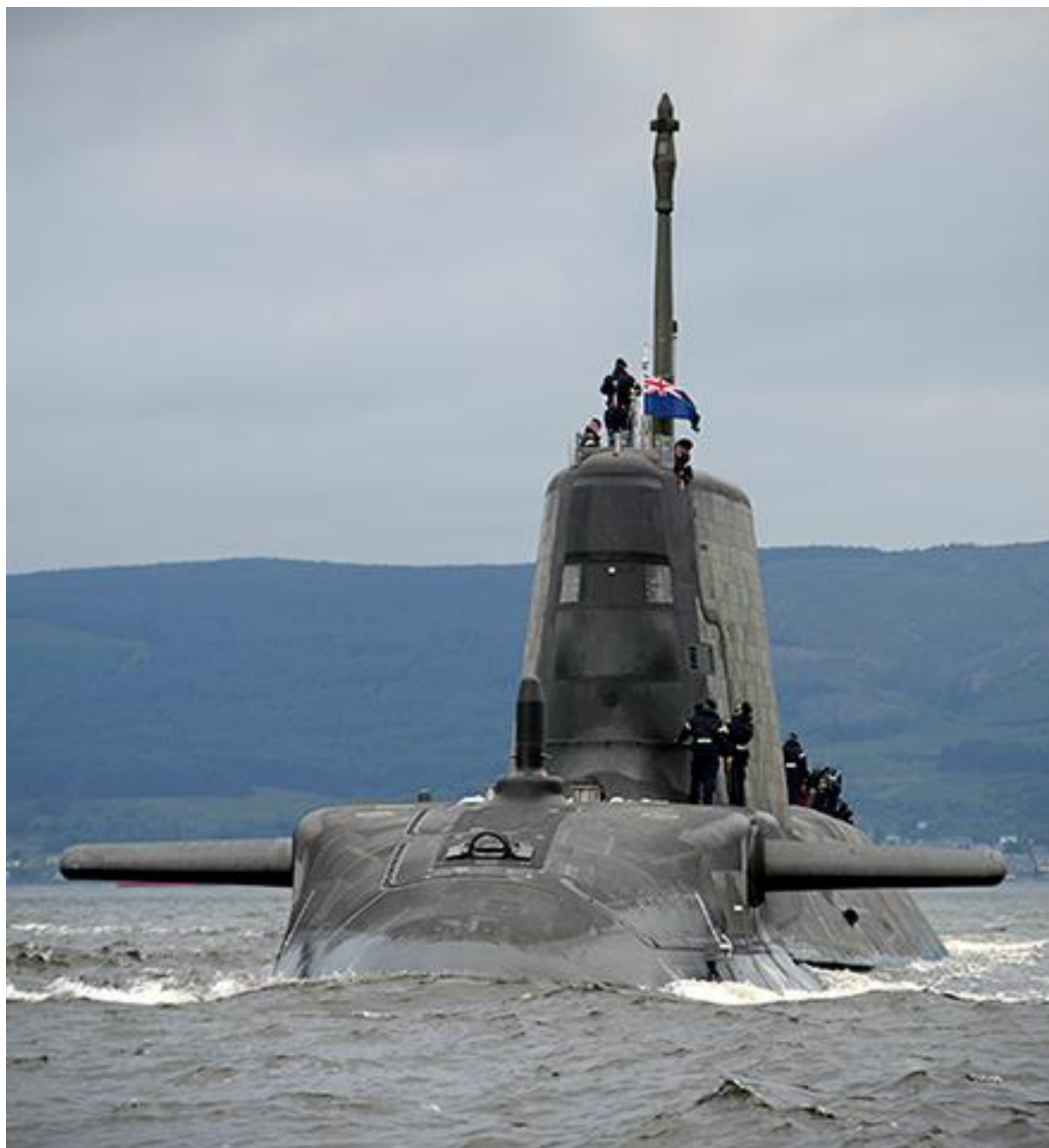
HMS Artful, an Astute Class nuclear attack submarine, December 2015. The class is a contender for Australia's AUKUS Programme.

recently announced large-scale projects (AUKUS) to provide Australia the force structure required. Fourth is to outline the investments required to support defence preparedness and mobilisation needs. Finally, it must outline funding required to ensure longer-term strategic investments are progressed 44 .