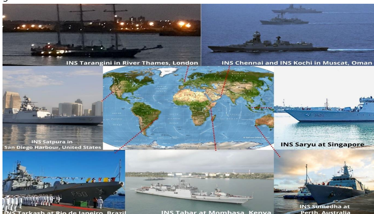
Indian Warships Celebrate Azadi Ka Amrit Mahotsav Across the World on August 15, 2022.

different ports across the globe. INS Sumedha started by hoisting India's 'colours' (the Tricolour and White Ensign) at Fremantle, Australia at 0800 (Australian Western Standard Time) on August 15, 2022. As the globe spun eastward into the rising sun, INS Saryu in Singapore came next, followed by INS Kochi and INS Chennai in Muscat, INS Tabar in Mombasa, INS Tarangini in London and INS Tarkash in Rio de Janeiro. INS Satpura at 0800 (Pacific Daylight Time) at San Diego, 15 hours behind Fremantle, was last. The message was loud and clear: independent India has accepted its maritime character and has acquired the capability and reach to display its maritime power around the globe.