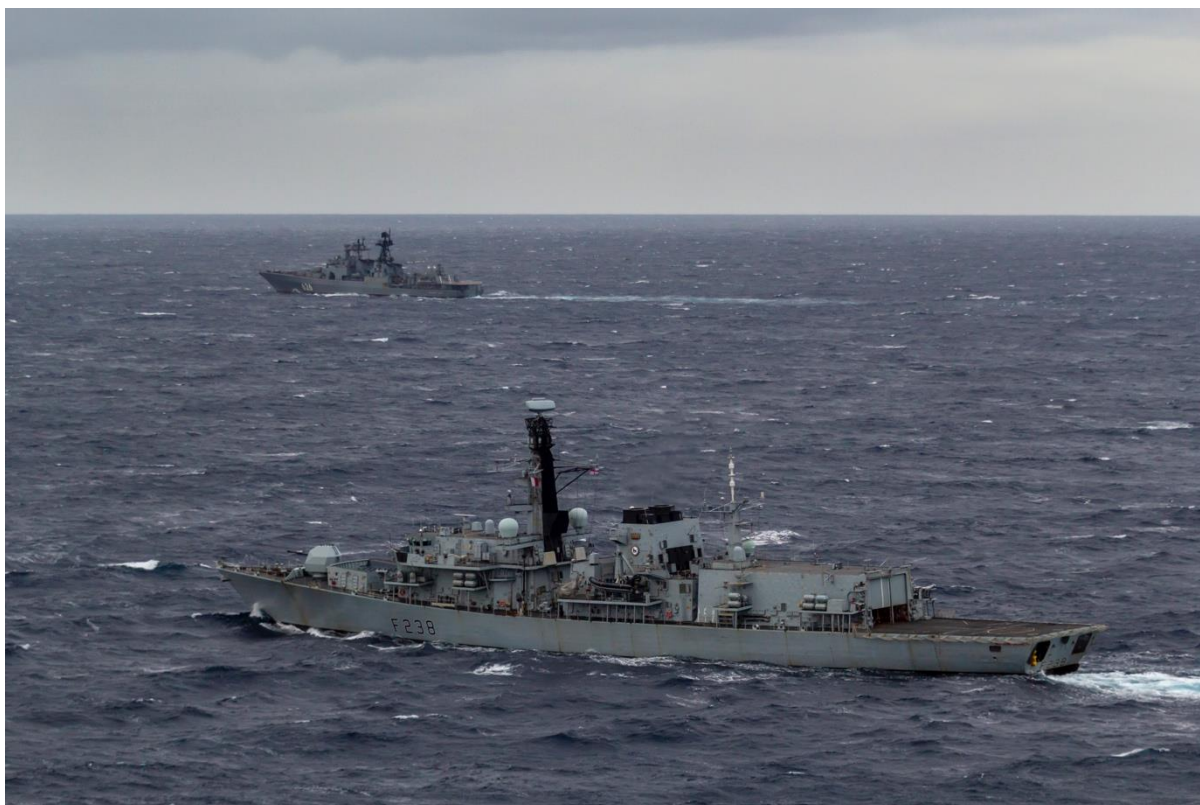
The Royal Navy monitoring the Russian Navy vessels in the waters close to the UK in a concerted operation, December 5, 2020.

The doctrine has ten sections: general provisions and definitions; Russian national interests and challenges to security in the world ocean; strategic objectives and principles of Russia's maritime policy; priorities for development of maritime activities; regional directions of national maritime policy; priority marine activities; measures for training and ensuring readiness; the objectives and tasks for state management of maritime policy; the process for using instruments of national maritime policy to protect Russian national interests; and the conclusion.