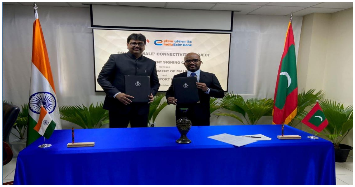
Line of Credit Agreement worth USD400 million was signed between Exim Bank of India and the Government of Maldives for undertaking the Greater Male' Connectivity Project.

The Indian Embassy in Male also <u>revealed</u> that under the USD800-million line of credit extended by India to the Maldives in March 2019, a 100-bedded cancer hospital and a 22,000-seater cricket stadium in Hulhumale would be built.<sup>198</sup>