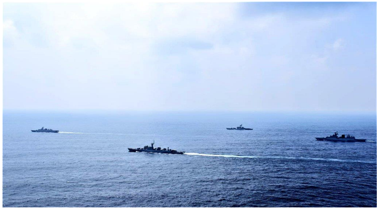
The second edition of the India-Bangladesh bilateral exercise 'Bongosagar' underway in the Bay of Bengal, October 3, 2020.

Coordinated Patrol (CORPAT) on October 4-5.<sup>185</sup> Prime Minister Modi and Sheikh Hasina are expected to hold a virtual summit in December 2020.