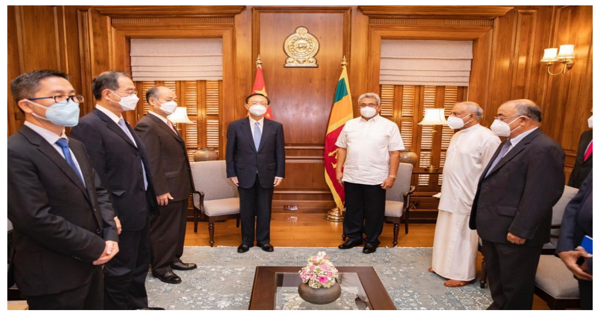
A Chinese delegation, led by Yang Jiechi, with Sri Lankan leadership headed by President Rajapaksa in Sri Lanka on October 9, 2020.

The Indian and Sri Lankan navies also conducted the 8<sup>th</sup> edition of the annual bilateral maritime exercise, <u>SLINEX-20</u> between October 19 and 21 off the coast of Trincomalee in Sri Lanka. The exercise attempts to "enhance interoperability, improve mutual understanding and exchange best practices and procedures for multifaceted maritime operations between both navies."<sup>211</sup>