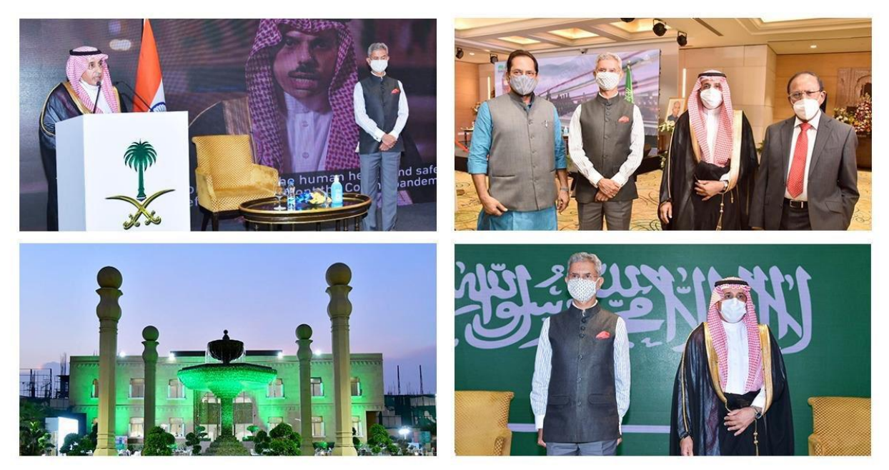
India's External Affairs Minister Dr. S. Jaishankar, National Security Advisor Ajit Doval attend Saudi Arabia's 90<sup>th</sup> national day celebrations in Delhi, September 24, 2020.

The'<u>G20 Riyadh Summit'</u> on the theme of 'Realising Opportunities of the 21st Century for All' will be held virtually on November 21-22, 2020.<sup>100</sup> In light of this, Prime Minister Narendra Modi held a telephone conversation with Saudi Arabia's <u>King Salman</u> where the two leaders also discussed "joint opportunities to develop bilateral relations within the Saudi-Indian Strategic Partnership Council".<sup>101</sup> In the recent past, India and Saudi Arabia have also enhanced cooperation in the energy sector, particularly at a time when the COVID-19 pandemic has <u>eroded one-third</u> of the global energy demand.<sup>102</sup>