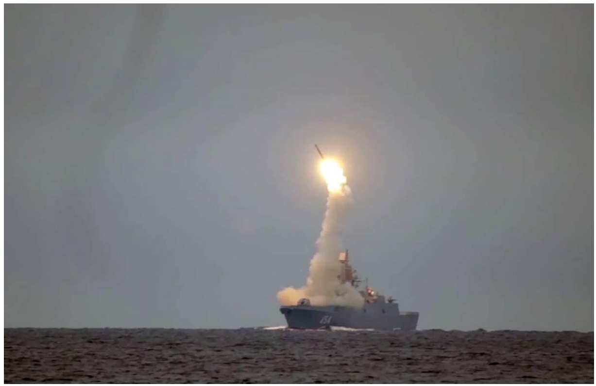
Russia's Admiral Gorshkov frigate launching a Tsirkon hypersonic missile in the White Sea on October 06, 2020

After nearly five years of flight tests, the Russian Navy this month successfully test-launched a <u>Tsirkon hypersonic missile</u>, fired from the White Sea at a sea target situated 450 km away in the Barents Sea.<sup>86</sup> President Putin <u>lauded the test launch</u> as a great event for Russia, stating that the development of advanced and globally unrivalled weapons systems would ensure Russian defence capabilities for years to come.<sup>87</sup> The Admiral Gorshkov frigate, from which the launch was conducted, is reportedly set to conduct another <u>three launches</u> by the year-end.<sup>88</sup>