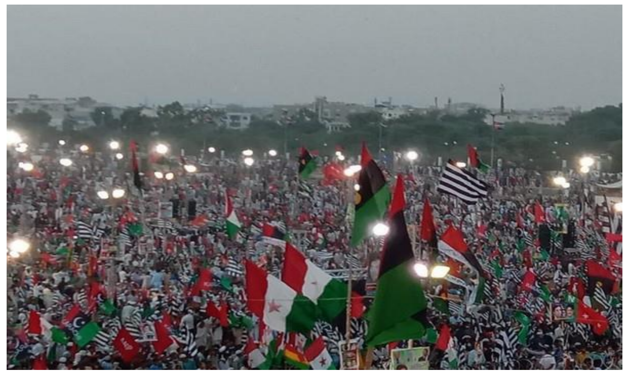
People assemble at the Bagh-e-Jinnah in Karachi, Pakistan for an anti-government rally organised by the Pakistan Democratic Movement (PDM), October 18, 2020.

ruling party Pakistan Tehrik-e-Insaf (PTI). The opposition coalition has organised rallies in the major cities including Gujranwala, Karachi, and Quetta. While the main focus is on Imran Khan, the opposition has also openly criticised the role of the military establishment in politics. It needs to be seen whether such tactics by the opposition can impact the political situation and the security dynamics of Pakistan.<sup>150</sup>