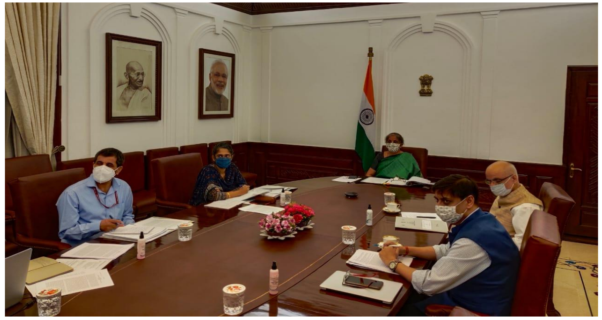
Finance Minister Nirmala Sitharaman participated in the G20 Finance Ministers and Central Bank Governors (virtual) meeting hosted by Saudi Arabia, October 14, 2020.