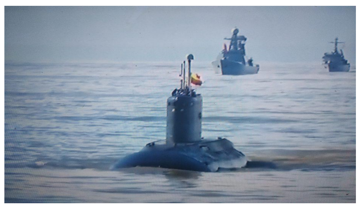
Myanmar Navy's new Kilo-class submarine participates in the Bandoola naval exercise, October 16, 2020.

India and Myanmar took stock of their bilateral relationship via multiple channels in October. On October 1, Delhi and Nay Pyi Taw virtually held the 19<sup>th</sup> round of <u>Foreign Office consultations</u> where the two sides reviewed relations, including border infrastructure, India's ongoing projects in Myanmar and ways to enhance power and energy co-operation.<sup>158</sup> This was followed by a <u>high-level visit</u> of the Indian COAS and the FS to Myanmar on October 4-5.<sup>159</sup> Ahead of the Myanmar general elections on November 8, the Indian delegation called on State Counsellor Daw Aung San Suu Kyi and the Myanmar Commander-in-Chief General Hlaing. Key discussions during the visit