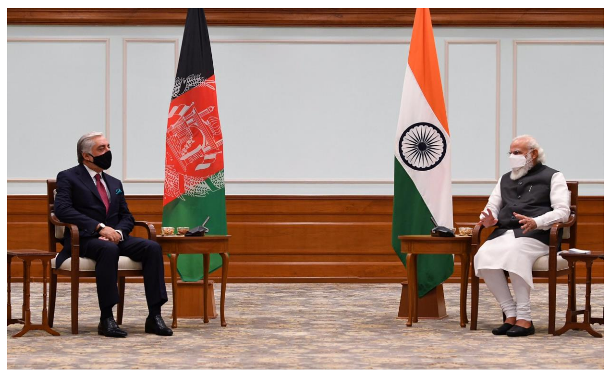
Prime Minister Narendra Modi meets Dr. Abdullah Abdullah, Chairman of the High Council for National Reconciliation of Afghanistan, October 08, 2020.

The <u>intra-Afghan dialogue</u> between the Taliban and the Afghan establishment was launched in Doha in September 2020.<sup>125</sup> Since then, recent developments indicate that the geopolitical situation in Afghanistan is rapidly heading towards pre-1995 civil war conditions. A <u>tweet by the US President</u> Donald Trump announcing the withdrawal of all US troops from Afghanistan by Christmas has put more pressure on the fragmented Afghan establishment.<sup>126</sup>