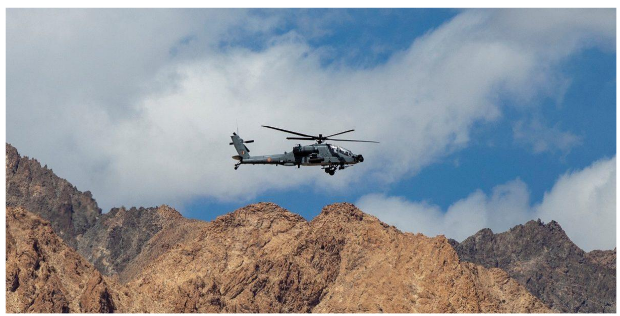
IAF's Apache helicopter in the Ladakh region.

On October 17, India's External Affairs Minister Dr. S. Jaishankar said that "the border clashes between India and China have left the Sino-Indian relationship <u>profoundly disturbed</u>".<sup>61</sup> During the month, India and China have maintained "<u>stable but confrontational</u>" positions at the LAC, even as talks continued between the two sides at the military and diplomatic level for "a comprehensive disengagement of troops" at all friction points.<sup>62</sup>