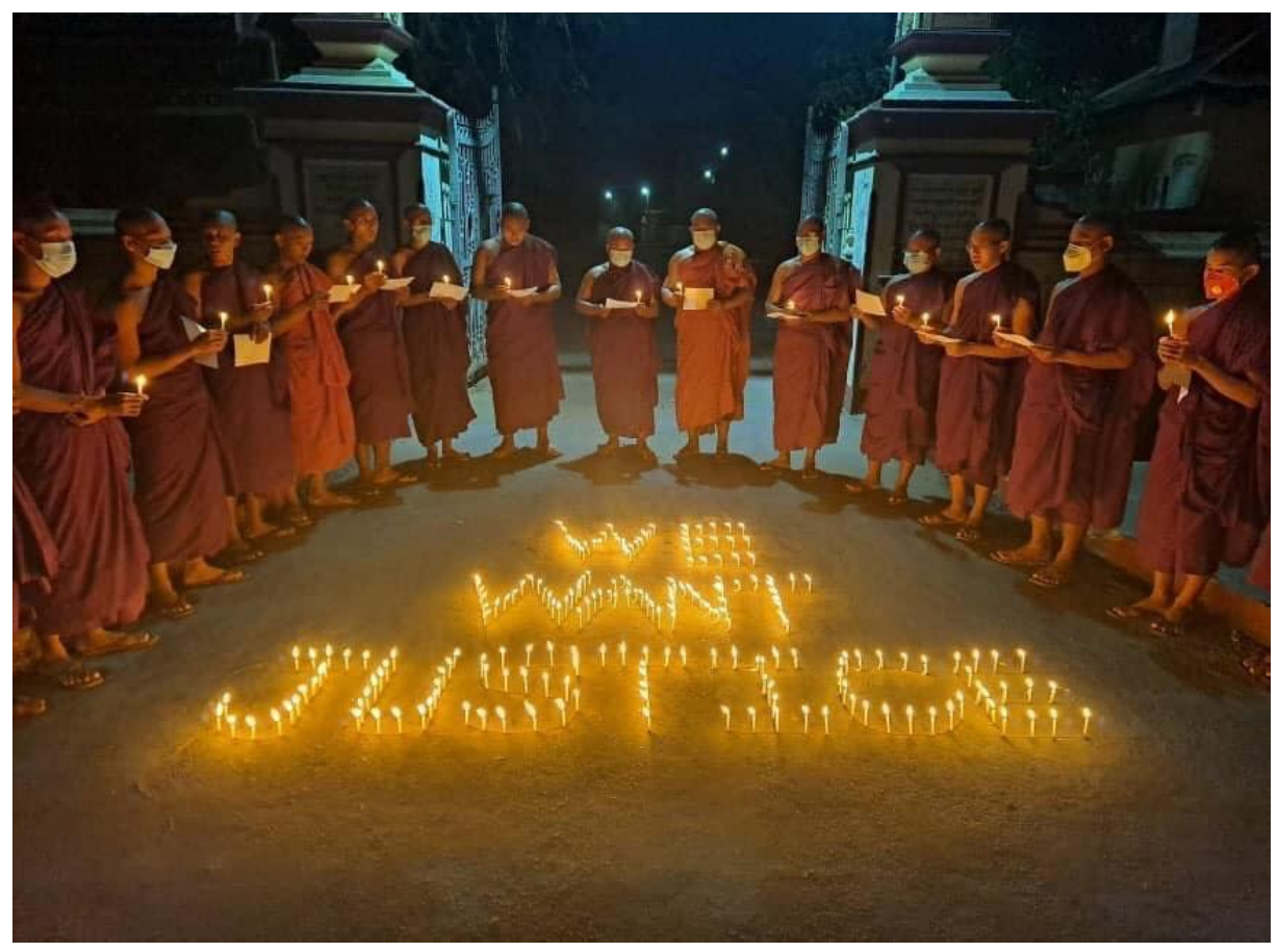
A prayer by the Buddhist monks from the Moe Kaung monastery in Mandalay.

The ANP, on the other hand, has not been part of the protests, and its spokesperson is a member of the SAC. In response to ANP's collaboration with the military, a joint statement has been issued by 47 Rakhine-based civil society organisations (CSOs) "urging the ANP to distance itself from Myanmar's military". <sup>57</sup> On March 11, when the Tatmadaw declared that the Arakan Army (AA) is no longer a terrorist group, it appeared that the AA and the military had reached an understanding. <sup>58</sup> However, on March 23, the AA condemned the military by referring to current events as "cruel and unacceptable". <sup>59</sup> The current dynamic in the Rakhine state may further widen fault-lines between the Burmese and Arakan Buddhists.