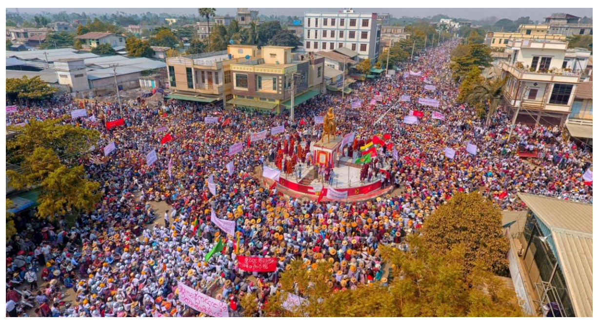
Anti-coup demonstrations in the Sagaing region of Myanmar, March 27, 2021.

Tatmadaw has granted over 23,000 prisoners amnesty as it urges civilians to "join hands" with the military for democracy.<sup>38</sup> While every year on Union Day, prison sentences are commuted, this year, there are concerns that hardened criminals are being released to perpetrate violence and to create space for political prisoners.<sup>39</sup>