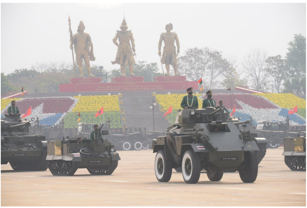
Even as Tatmadaw celebrated its Armed Forces Day on March 27, at least 90 civilians were killed in a single day during anti-coup demonstrations across the country.

Given that India shares a long border with Myanmar, the military coup has had a spill-over impact in India, especially in the north-east region. There have been reports that more than 1,000 people, including police personnel and their families, have crossed over from Myanmar to Mizoram since late February. As a response to the increased movement of people into India, on March 13, the Ministry of Home Affairs of India instructed border states – Manipur, Nagaland, Mizoram and Arunachal Pradesh – to "maintain strict vigil" and to only allow people into the country when it is "absolutely essential on humanitarian grounds". Subsequently, India has "sealed all entry points along the border" with Myanmar.