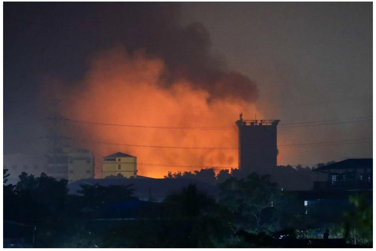
Fire burning at a Chinese-owned factory in a township on the outskirts of Yangon.

protests, including in front of the Chinese Embassy in Myanmar, against Beijing's policies. 98 The factory fires have prompted many workers at other Chinese establishments to stay back at home, which does not portend well for Chinese businesses in Myanmar. There have also been reports that the Chinese authorities have asked their state firms to evacuate non-essential staff.99 A Chinese state-media report noted that "if the authorities cannot deliver and the chaos continues to spread, China might be forced into taking more drastic action to protect its interests". 100 The reference to 'drastic action 'may not have gone down well with opposition groups in Myanmar, and there are a lot of anti-Chinese sentiments among the public. 101 There has also been a significant drop in the export of rare earth metals from Myanmar to China, as the protests have undermined the logistic networks. 102 Further, if the mining labour also joins the protests, then the disruption in the export of the rare earth metals will be prolonged. 103 Chinese leaders are confronted with a difficult choice; they have "no qualms about working with an authoritarian government [and]...they tend to prize stability above all else", but the anarchy on the streets of Myanmar is a threat to their business interests. 104 However, as the Chinese backed Myitsone Dam's suspension in 2011 suggests, the disappointment with Chinese economic activity has a long history.