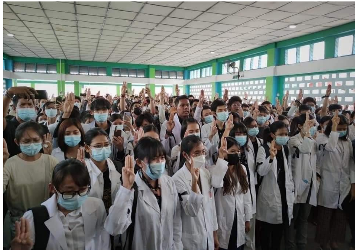
Healthcare workers in Yangon display the three-finger salute in protest of the military coup.

Key personalities from Myanmar's movie industry have participated in the protests, while some have been arrested. Healthcare workers, doctors, teachers and even some police officers have broken rank to protest against the coup. For instance, over 115 members belonging to the Ministry of Information refused to work for the military and have joined the CDM. Approximately 18 labour organisations have declared their support for the CDM. It has also been estimated that almost 30 per cent of officials from the Myanmar Ministry of Foreign Affairs are participating in the CDM. The CDM has reportedly been nominated for the Nobel Peace Prize by six academics at the University of Oslo, Norway.