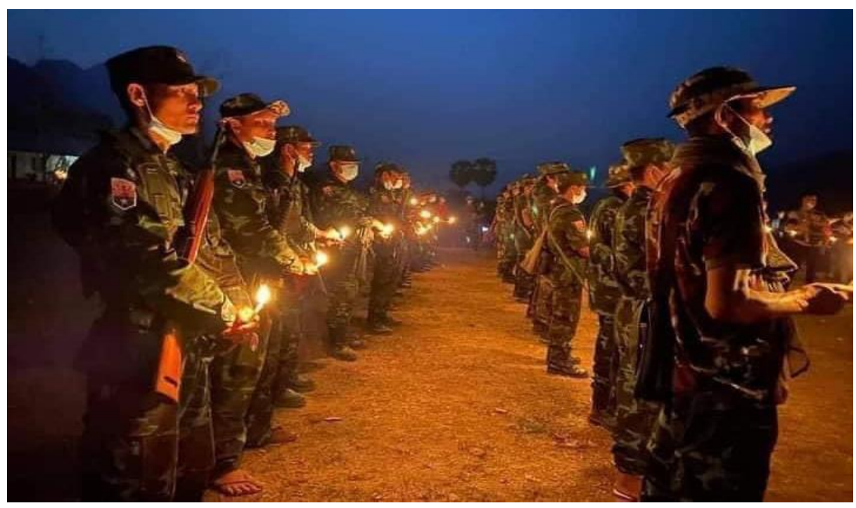
The Karen National Union (KNU) held candle vigils on March 27, 2021.

On the day of the military coup, the Myanmar military reached out to various armed groups. 48 In the first week of February, ten Peace Process Steering Team (PPST) members agreed to stick to the Nationwide Ceasefire Agreement (NCA).<sup>49</sup> However, after the discussions on February 19-20, the PPST announced that it would suspend talks with the military regime, announced support for the CDM, called for the release of all detained leaders and expressed willingness to work with "national and international actors... to end military dictatorship". 50 Meanwhile, the Karen National Union (KNU) has promised to protect people protesting the military coup. 51 Given the KNU's stance in support of the protests, it anticipates a large influx of the population from cities to areas under its control along the Thailand border. 52 The Karen National Police Force in the Tanintharyi Region stood up in support of the CDM protestors.<sup>53</sup> On March 11, the Kachin Independence Army (KIA) attacked a Myanmar military outpost in the Hpakant Township of Kachin.54 Ten days later, the KIA was able to take over another Myanmar military base in southern Kachin state near the Chinese border.55