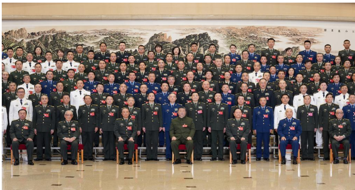
President Xi Jinping meets with delegates, specially invited delegates, and non-voting participants of the People's Liberation Army (PLA) and armed police forces present at the 20th CPC National Congress, October 24, 2022.

President Xi Jinping emphasized “establishing a strong system of strategic deterrence” for the first time in his report to the CPC Congress. 68 Analysts see in this China’s attempt to boost its nuclear weapons capabilities, and accelerate the development of new combat capabilities. 69 Further, China reaffirmed its “no first use” nuclear weapons policy at the United Nations. 70 While, China’s permanent mission to the United Nations (UN) in Vienna, “thwarted a proposal submitted by ‘AUKUS’ to legitimize their nuclear submarine cooperation at an IAEA meeting”. 71