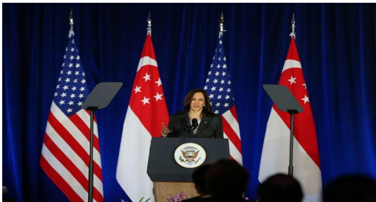
Vice President Kamala Harris' speech at Gardens by the Bay hosted by the Lee Kuan Yew School of Public Policy and the US Embassy in Singapore on August 24, 2021.

Chinese state media extensively criticised the US Vice President's remark on "China practicing intimidation in Southeast Asia" during her recent visit to Singapore. By setting a tone of Biden administration's Indo-Pacific vision , Vice President (VP) Harris said that "the US is not seeking 'zero sum' engagement with Asia but will stand up against coercive China." 40 She went on to stress upon the US commitment to "peace and stability, freedom of the seas, unimpeded commerce, advancing human rights, and commitment to the international rules-based order based on the recognition that our common interests are not zero sum". 41 China objected to VP Harris offering support to Vietnam in countering China in the South China Sea , including more visits by US warships. 42 A commentary in Chinese state media criticised US foreign policy for choosing hawkish neorealism and polarization over constructivism. 43