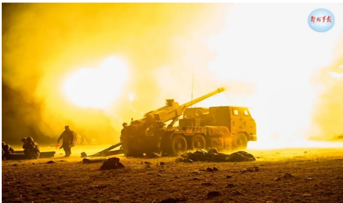
PLA Tibet Military Command held a live-fire exercise code named "Snowland Mission 2021" on the plateau at the elevation of 4,500m, August 26, 2021.

Theatre Command's live-fire drills involving naval warships, anti-submarine aircrafts, and fighter jets in the sea and airspace surrounding the island of Taiwan to "test PLA's capabilities of joint operations ". 137 Reportedly, PLA has held at least 120 military exercises in China's sea areas such as Bohai Sea, Yellow Sea, East China Sea, Taiwan Straits and South China Sea in the past three months. 138 The PLA also held a live-fire exercise ' Snowland Mission 2021 ' in Tibet "demonstrating combat capabilities in joint plateau operations". 139