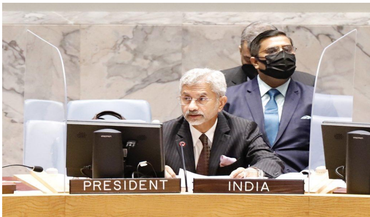
Indian External Affairs Minister Dr. S. Jaishankar chairs UN Security Council (UNSC) briefing related to counter-terrorism, August 20, 2021.

Indian External Affairs Minister Dr. S. Jaishankar told the UNSC that countries should not place “blocks and holds” without any reason on requests to designate terrorists. 11 He warned that double standards and distinctions would be only at “our own peril”. He was alluding to China’s repeated attempts to prevent the head of Pakistan-based militant group Jaish-e-Mohammed Masood Azhar, being designated as a terrorist through technical holds.