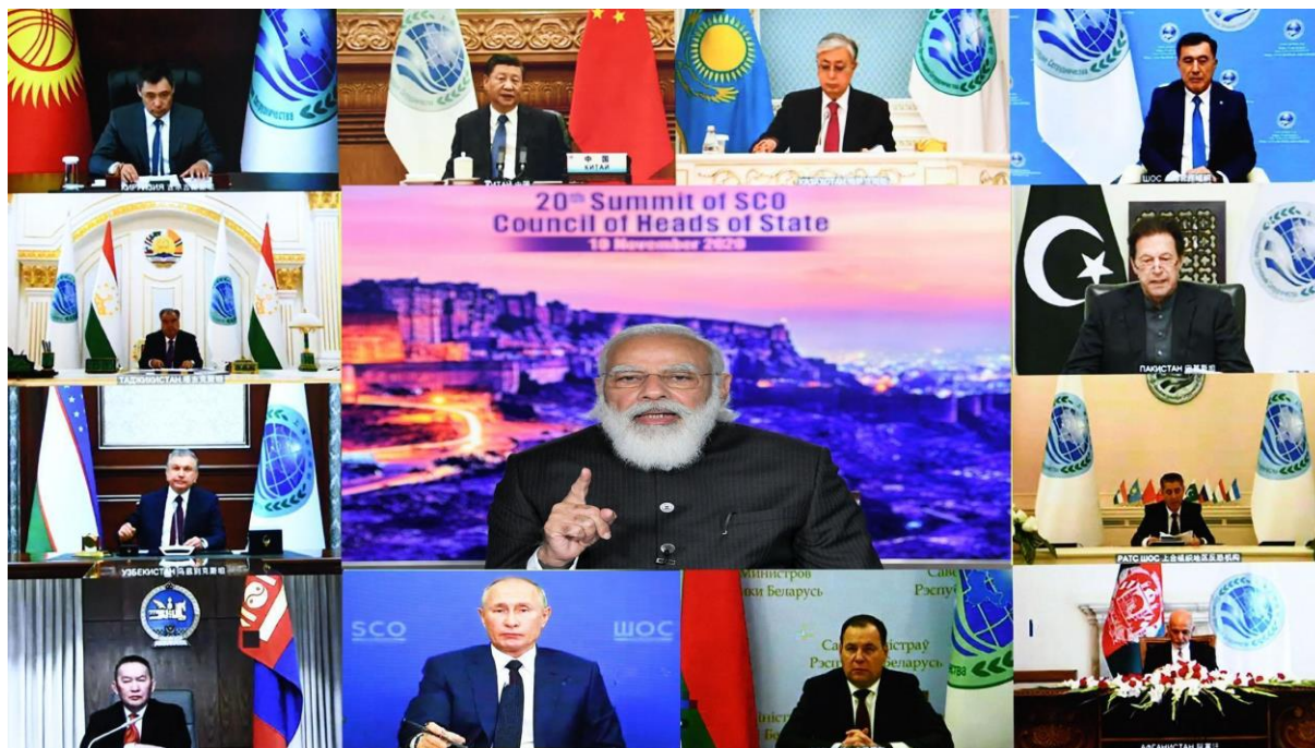
PM Modi addresses the 20th Summit of the SCO Council of Heads of States on November 10, 2020.

emphasising the need to follow “principles respecting each other's sovereignty and territorial integrity.” 13