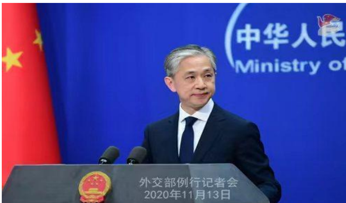
Foreign Ministry Spokesperson Wang Wenbin congratulated President-elect Biden and Vice President-elect Harris on behalf of China on November 13, 2020.

also sent President-elect Biden a congratulatory message, emphasising the need to “uphold the spirit of non-conflict, non-confrontation, mutual respect and win-win cooperation, to manage differences, as also to advance the healthy and stable development of China-U.S. ties.” 62