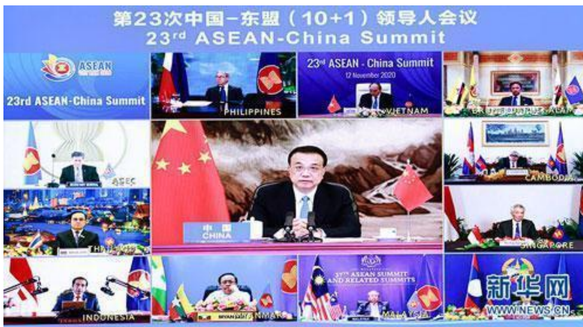
Chinese Premier Li Keqiang attends the 23rd China-ASEAN Summit on November 12, 2020.

“international cooperation” along with “common development.” 67 Subsequently, on November 21 at the G20 meeting, President Xi expressed the need to “build a global firewall against COVID-19” while ensuring a smooth global economy and harnessing “the role of the digital economy,” among other issues . 68