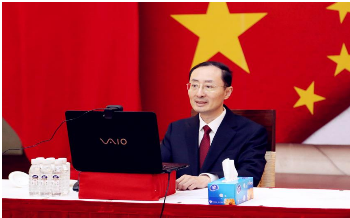
Chinese Ambassador to India at the Virtual Meeting to Celebrate the 71 st National Day of the People's Republic of China on September 29, 2020.

significance” as they are important for maintaining “world stability.” 13 Despite the turbulence in ties, the Ambassador emphasised that the neighbours share a “history of friendly exchanges between the two peoples, which has lasted more than two thousand years” and it “won't be hampered by the pandemic or temporary difficulties in bilateral relations.” 14 This upbeat assessment was clearly not in keeping with the current reality of bilateral ties.