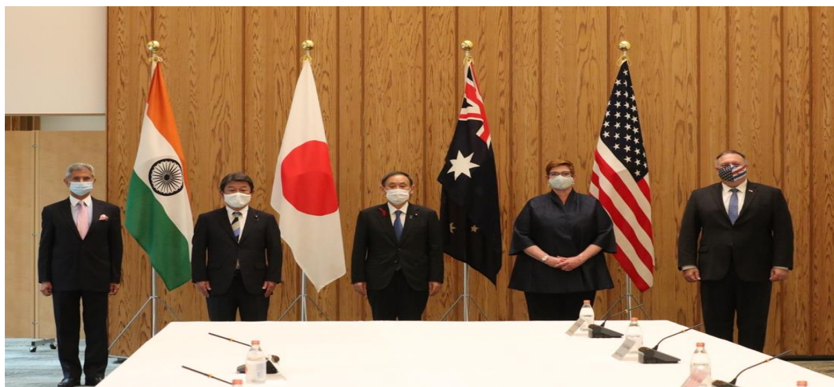
Foreign Ministers of India, U.S.A, Australia and Japan along with Japanese PM while in Tokyo for the 2 nd Quad Ministerial Meet on October 6, 2020.

human rights issues and lashed out at Western countries with “notorious records on the refugee issue, humanitarian crisis, racial problem” for accusing China of human rights violations in Hong Kong and Xinjiang. 31