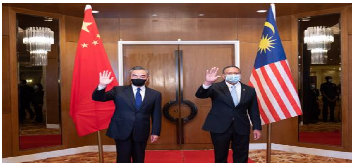
Chinese State Councillor and Foreign Minister Wang Yi with Malaysian Foreign Minister Dato 'Seri Hishammuddin Tun Hussein in Kuala Lumpur on October 13, 2020.

While speaking about the COVID-19 pandemic at the Quad Ministerial meeting on October 6, Secretary Pompeo maintained that the crisis was made “infinitely worse by the Chinese Communist Party’s coverup” and implored the Quad countries to “collaborate to protect our people and partners from the CCP’s exploitation, corruption, and coercion.” 36 The Chinese Foreign Ministry spokesperson rejected these allegations and asked “certain U.S. politicians” to “stop blaming other countries” since “blaming others will not drive COVID-19 away or save the sick.” 37 The spokesperson also accused the U.S. of coercing countries into choosing sides in the U.S.-China strife and claimed that the tussle between the two countries was not “a fight for power, status or social system, but about upholding justice or spreading evil, championing multilateralism or unilateralism, advocating win-win cooperation or zero-sum game”, with Beijing standing for the former values. 38