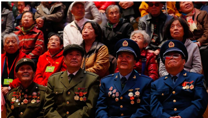
PLA veterans and local residents watch the opening of 19 th Party Congress on television at a bookstore in Shenyang in China's north-eastern Liaoning province.

Concurrent to the ongoing reduction of regular PLA personnel, Xi referred to the continuation of the system of recruitment of civilian personnel in the military for undertaking roles related to the fields of management (administration) and technology (R&D, technical services requiring special skills, defence industry etc.). This would be in addition to the civilian personnel already working in cultural and political branches of the PLA. This measure seems to be aimed at cutting the cost of maintaining the 'tail' (administrative support elements) of the combatant component (teeth) of the armed forces. It is also aimed at providing opportunities to the family members of soldiers, particularly from remote areas.