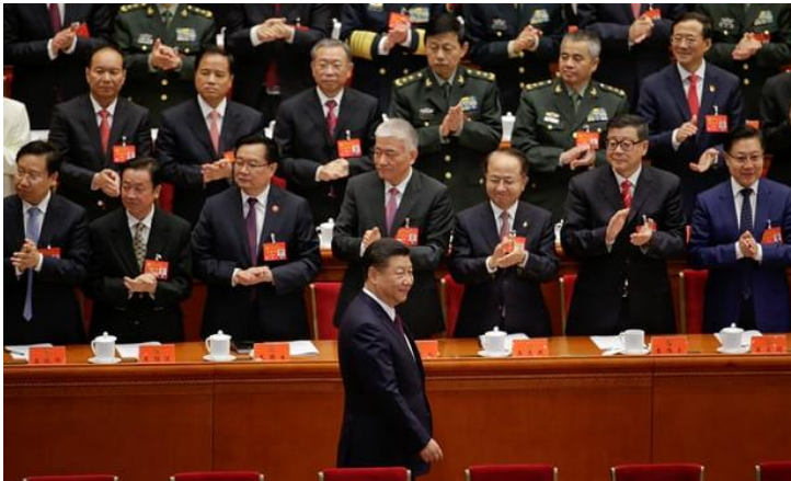
Chinese president Xi Jinping arrives for the opening of the 19th national congress of the Communist party of China at the Great Hall of the People in Beijing.

There was reiteration of the Party's control over the PLA, with emphasis on building a force that obeys the Party's command and safeguards 'political security' as a fundamental task. PLA will be strengthened in accordance with the Party's thinking on shaping the military for a new era. Emphasis, it was stated, will also be laid on 'party building in the military', including inculcating the revolutionary tradition and maintaining the character of the 'People's Force'. Coming as this did from Xi, as the General Secretary, the President and the Chairman of CMC, these assertions were significant.