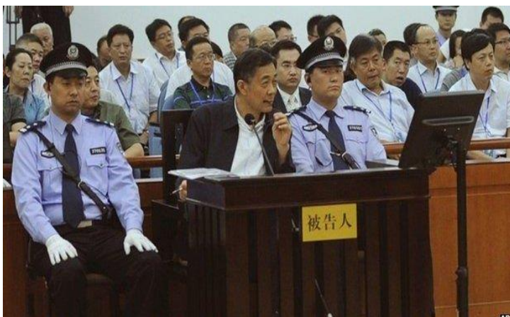
An undated photo of Bo Xilai, one of China's high profile officials, at a public trial.

First, the economic goal as before is to realize the twin CPC Centenary goals and become a nation with leading global influence by 2050. The anti-corruption campaign will continue its momentum. There will be a focus on fighting poverty, creating jobs and lowering housing prices. The economy will open further to trade and investment, there will be a more level playing field for foreign and Chinese businesses, and a shift towards market based interest and exchange rates. Xi will focus on promoting more balanced growth, a better quality of life, tackling the economic slowdown, improving governance, fighting bureaucratic inertia, reforming SOEs, promoting quality manufacturing, improving macro-regulation and boosting consumption.