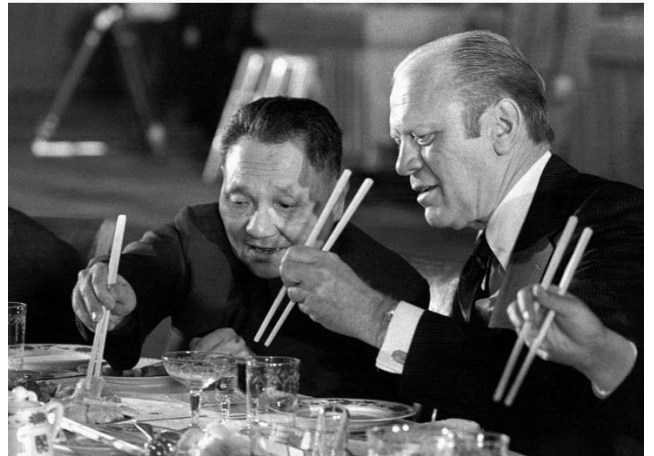
Chinese leader Deng Xiaoping is shown with US President Gerald Ford. Deng's dictum advising the Chinese leadership to lie low and bide its time has been abandoned by Xi Jinping for a more assertive foreign and security policy.

Third, China has never publicly repudiated Deng Xiaoping's foreign policy dictum "observe things serenely, respond and manage things calmly, hold our ground firmly, hide our capabilities and bide our time, accomplish our objectives." But China under Xi, has an active foreign policy that no longer hides its capabilities and does not shy away from a confrontation in asserting its "historical rights" and territorial claims. Similarly, Deng Xiaoping's proposal to "shelve disputes and pursue joint development", has been abandoned by Xi Jinping in favor of confrontation with littoral claimant States on the South China Sea issue, gray zone incursions and coercive pressures in the East China Sea, and periodic incursions on the land border with India.