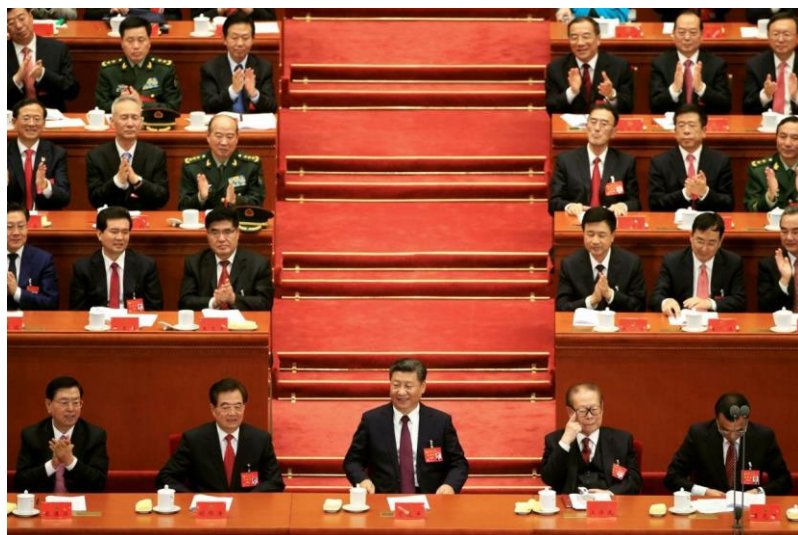
Front row, from left: Chairman of the Standing Committee of the National People's Congress Zhang Dejiang, former Chinese President Hu Jintao, Chinese President Xi Jinping, former President Jiang Zemin, and Chinese Premier Li Keqiang, at the opening of the 19th National Congress of the Communist Party of China at the Great Hall of the People in Beijing on Oct 18, 2017.

Xi Jinping's marathon three and a half hour address to the 19 th Congress of the CPC delivered on October 18, 2017 has set the stage for far reaching changes in Xi's own position in the Party, and laid down the guidelines for the governance of China and the domestic, foreign and security policies of the of the CPC and the Chinese Government over the next five years.