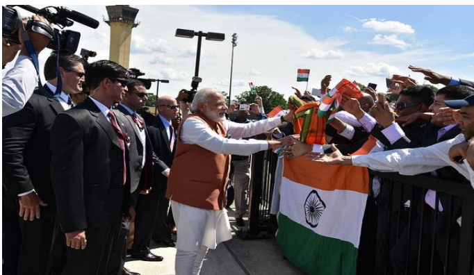
Prime Minister Narendra Modi's US Visit, June 06-08, 2016

Prime Minister Narendra Modi's recent visit to the United States has added renewed impetus and highlighted a new sense of purpose in India-US relations. PM Modi, using his intuitive deal-making capability, has successfully forged a strong strategic partnership with the United States. The India-US Joint Statement on June 7 defined the following eight major areas of collaboration between the two countries: advancing global leadership on climate and clean energy; clean energy finance; strengthening global non-proliferation; securing land, maritime, air, space and cyber domains; standing together against violent extremism; bolstering economic and trade ties; expanding cooperation in science and technology; and continued global leadership in achieving sustainable development goals. While each of these eight areas has significant potential for collaboration, the latest India-US Summit has paved the way for three immediate advancements.