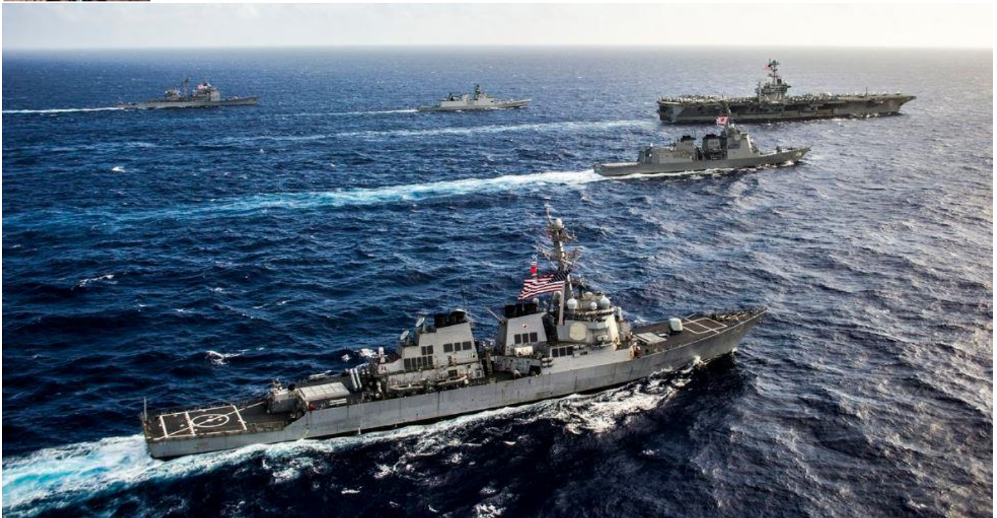
Nimitz class super Carrier USS John C. Stennis with Destroyer Squadron in coy CVN 74 on the way for Malabar 2016, on June 09.

The Malabar Exercise is today a trilateral naval exercise conducted by the navies of India, Japan and the US. The primary aim of this exercise is to increase interoperability amongst the three navies and develop common understanding of procedures for Maritime Security and Humanitarian Assistance and Disaster Relief operations.