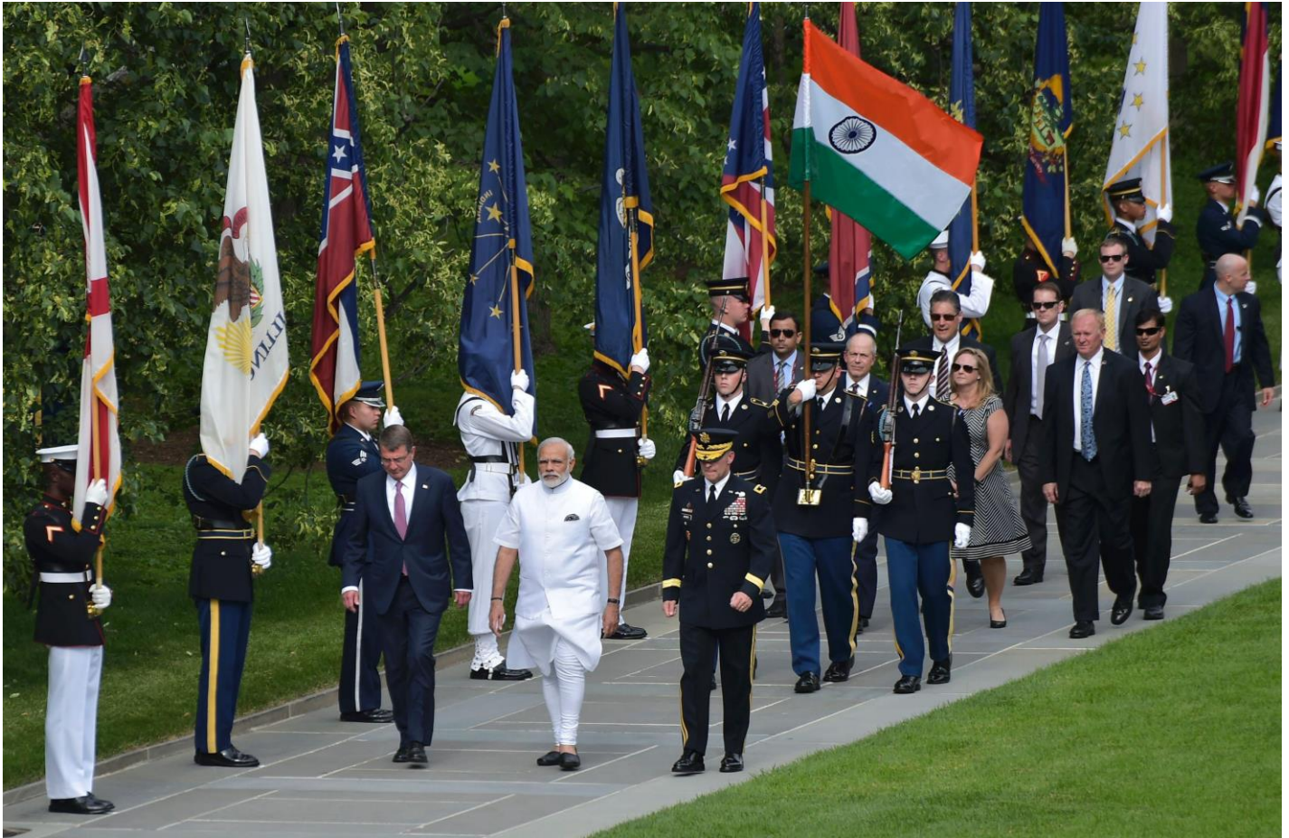
Prime Minister Narendra Modi at Arlington Cemetery on June 06, 2016

In presenting his compelling vision before the US Congress, PM Modi defined the context, nature and purpose of the transformed India-US relationship. He recalled that the India-US partnership extends to the entirety of human endeavour; “in every sector of India’s forward march, I see the US as an indispensable partner”. He underlined that both nations stand to gain in great measure from advancing their relationship and remaining invested in each other’s strength, security and prosperity. In a world full of multiple transitions and growing uncertainties, India-US engagement can make a difference by promoting “cooperation not dominance”, connectivity not isolation, respect for global commons and adherence to international rules and norms. Thus, “A strong India-US partnership can anchor peace, prosperity and stability from Asia to Africa and from Indian Ocean to the Pacific,” and help ensure the security of the sea lanes of commerce and freedom of navigation of the seas.