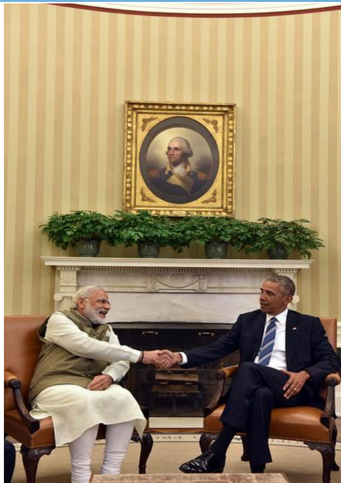
Prime Minister Narendra Modi and US President Barack Obama in the Oval Office on June 07, 2016

The summit marked further advances on counter terrorism, with a commitment to deepen collaboration against the full spectrum of terrorist threats and the finalization of an arrangement to facilitate the sharing of terrorist screening information.