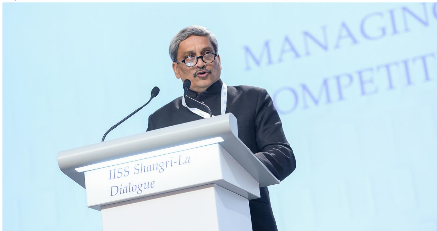
DEFENCE MINISTER MANOHAR PARRIKAR AT THE SHANGRILA DIALOGUE, 04 JUNE, 2016

Since its inception in 2002, the Shangri-La Dialogue, organized by the London-based think-tank International Institute for Strategic Studies (IISS) in Singapore, has emerged as a premier, high-level, defence and security forum in the Asia-Pacific region. The dialogue attracts regular participation from defence ministers and policy makers from important nations like Japan, China, India, Australia, United States (US) and the United Kingdom (UK), and is thus often referred to as the ‘Davos of International Security’.