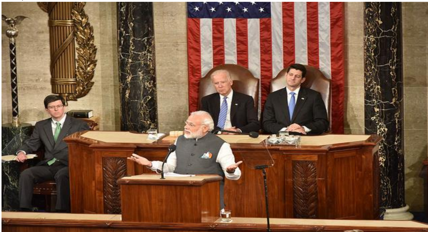
Prime Minister Narendra Modi addressing the Joint Session of the US Congress on June 08, 2016

On India's new status as "Major Defence Partner", the implications will become clearer only when Congress legislates changes into relevant US laws controlling defence transfers and technology release, providing for specific carve outs for India. Equally on the Indian side, it is high time that long-pending "foundational agreements" are expeditiously concluded to gain access to the highest US military technologies. These agreements were negotiated and adjusted to India's comfort level a decade ago, but have remained in abeyance. India's MOD would do well to follow PM Modi's lead and overcome the "hesitations of history."