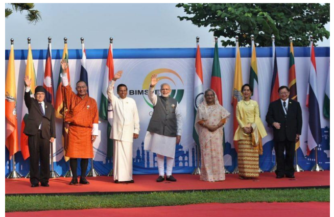
BIMSTEC was reinvigorated by Indian Prime Minister Narendra Modi during the Leader's Retreat in Goa on October 15-16, 2016. It is the only organisation that links South Asia with South East Asia.

People-to-People contacts are very important for bolstering intra-region tourism as they bring together our cultural experiences, nurture the bonds of heart and mind and promote a cooperative spirit amongst the people. Recognising this, India has taken up initiatives to celebrate the common heritage and boost tourism through stronger people-centric ties. As a part of the celebrations to mark the 20 th Anniversary of BIMSTEC, India hosted the 'Bodhi Parwa: BIMSTEC Festival of Buddhist Heritage' from 8-10 December, 2017. The Festival had diverse components including an exhibition of international and Indian Buddhist art and architecture, discourses by eminent scholars and practitioners of Buddhism, guided meditation and chanting by Buddhist monks and choir, screening of films on Buddhism, dance and music performances.