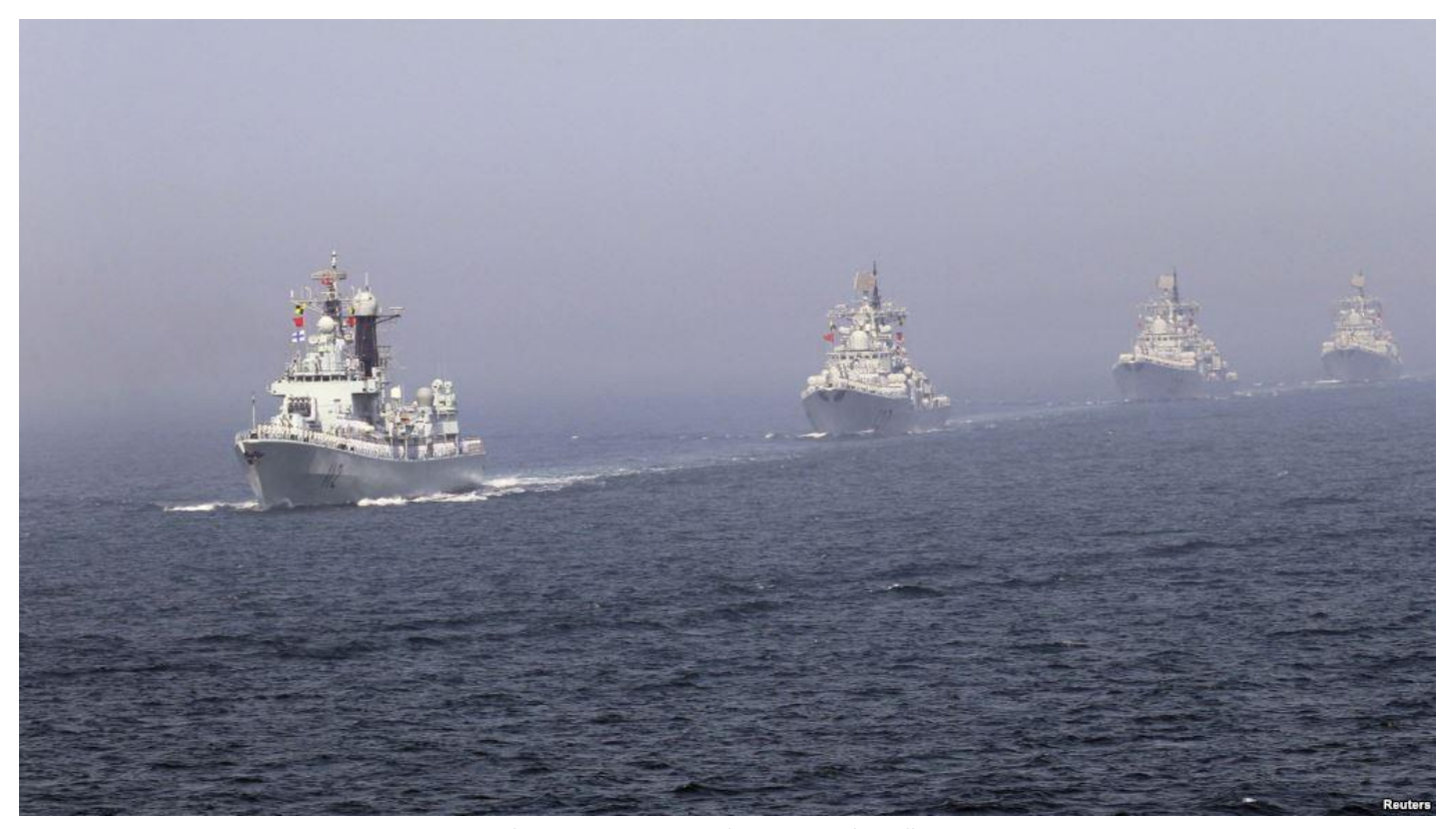
A China-Russia joint naval exercise in the Yellow Sea

other countries. Russia entered into joint production arrangements with India, while selling defense equipment to China. Russia supplied a downgraded version of the Sukhoi SU-30 fighter to China while supplying India with an upgraded one. China later obtained from Ukraine the same Soviet era defense technology that Russia refused to sell to China. From this, one can deduce the lack of trust Russia has in its military cooperation with China.