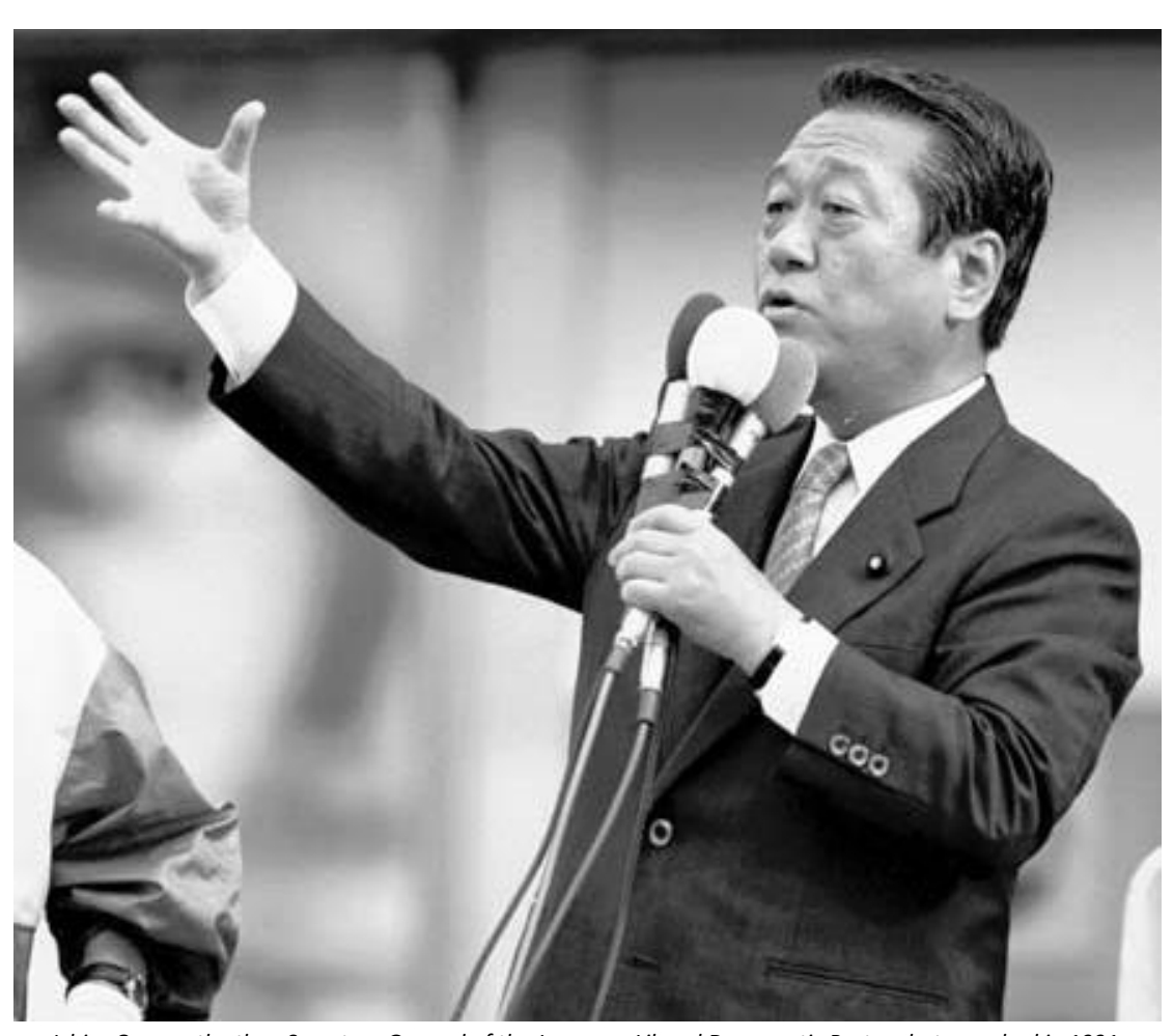
Ichiro Ozawa, the then Secretary General of the Japanese Liberal Democratic Party, photographed in 1991.

In March 1991<sup>6</sup>, the Secretary General of the ruling LDP in Japan, Ichiro Ozawa, established a back-channel and visited Moscow and proposed concessions by the Soviet Union on the islands issue, offering credits in return. The tradeoff was to be explicit from the beginning and Japanese aid was to be granted only if the Soviet Union agreed to give up all four islands