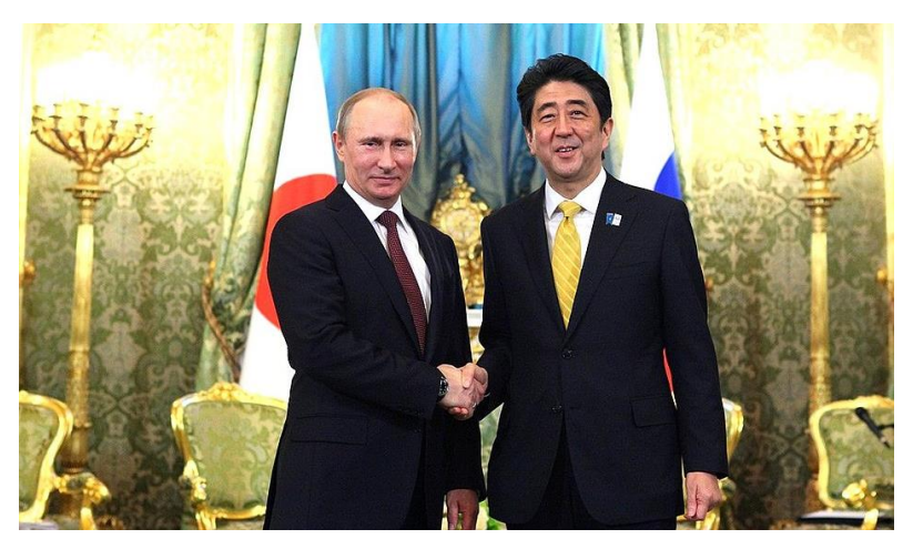
Japanese Prime Minister Shinzo Abe and Russian President Vladimir Putin greeting each other in Moscow during Abe's April 2013 visit.

Abe's visit to Moscow from April 28-30, 2013 was the starting point for the present phase of Japan-Russia relations. On March 1, 2012 four days before he was re-elected President of Russia, Vladimir Putin stated that he wanted to improve relations with Japan by strengthening economic ties and resolving the territorial issue on the basis of a "draw" or hikiwake - a term borrowed from the Judo vocabulary. Clearly, Putin was hinting at a solution to the territorial issue that was not a victory for either side but a compromise.