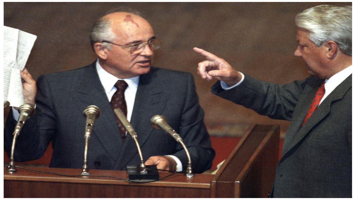
Yeltsin confronting Gorbachev in 1991.