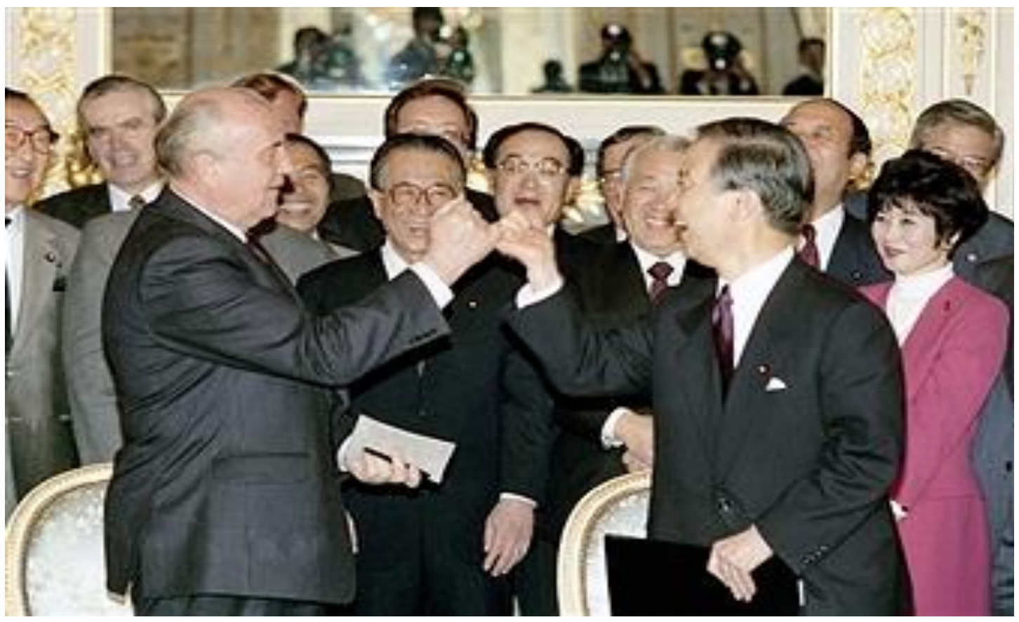
President Mikhail Gorbachev and Japanese Prime Minister Toshiki Kaifu seen together during the former's visit to Japan in April 1991

Gorbachev rejected Ozawa's proposal. Gorbachev told Ozawa that he was