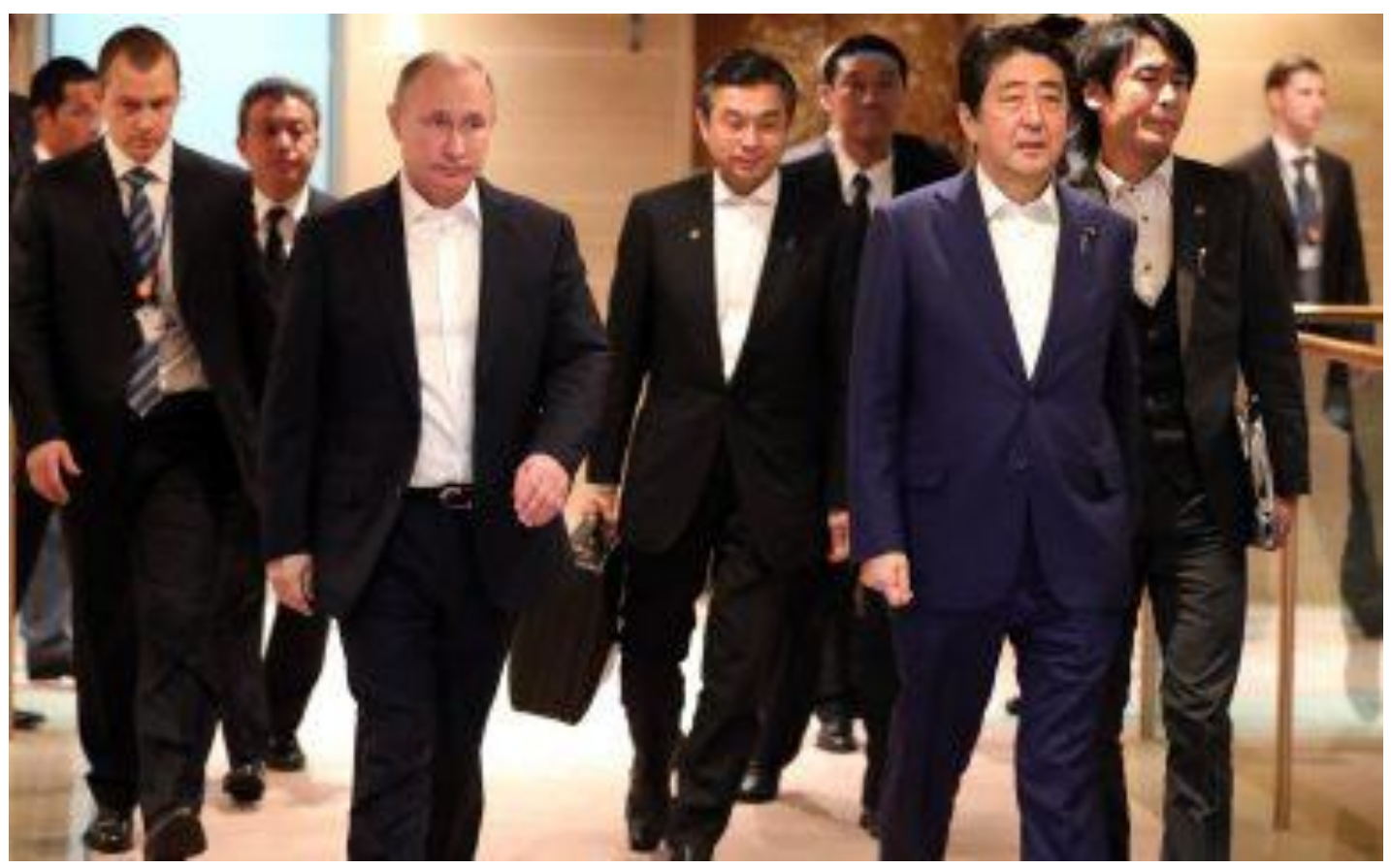
President Vladimir Putin and Prime Minister Shinzo Abe surrounded by aides during the former's December, 2016 visit to Japan.

The optics of the visit were also unfavorable from the Japanese point of view. Prior to the visit, Putin rejected a Japanese legislator's gift of a male Akita dog to join the female dog he had received four years ago. Putin also kept Abe waiting and arrived in Japan two hours late. Later, Putin turned down Abe's invitation to enjoy local food and relax in the onsen after the talks.