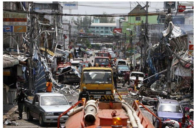
The Insurgency in Southern Thailand is one of the deadliest in South-East Asia, claiming close to 7,000 lives and injuring 12,000 people.

Thus, the south-Thailand insurgency appears to be currently in a state of political stalemate. The Thai military remains the dominant political actor and its position has only strengthened since the coup in 2014. Although there have been democratically-elected governments in Thailand from 1992-2006 and 2007-2014, it has largely been an example of failed democracy leading the insurgents to further believe that coups are not only possible in Thailand but that they shall also go unpunished. Having vowed to end the south-Thailand insurgency within a year from the coup in 2014, the problem with the military junta lies in identifying interlocutors with whom they can negotiate. Ever since MARA Pattani broke down, the fringe groups have resorted to violence independently which the BRN and the Patani United Liberation Organisation (PULO) have not been able to stop even if they wanted to. 24