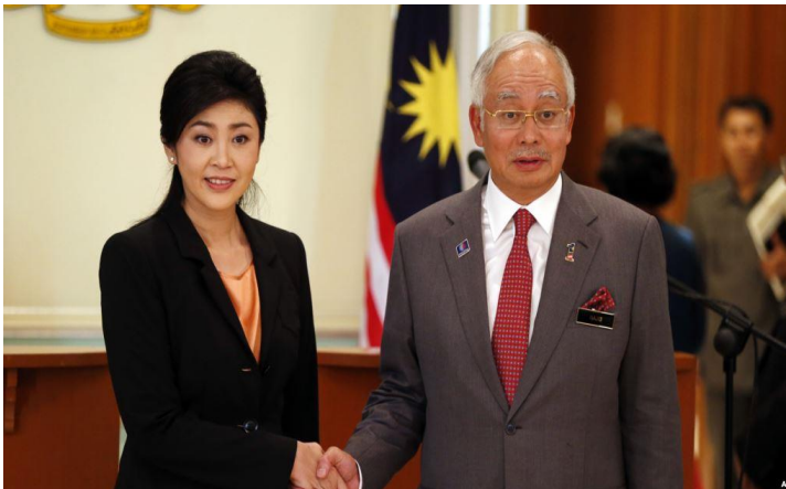
Thai Prime Minister Yingluck Shinawatra (left) and her Malaysian counterpart Najib Razak pose for photographers after their joint press conference at the latter's office in Putrajaya, Malaysia, February 2013. Despite Malaysia's repeated attempts to broker peace talks between the Thai government and the insurgent groups, a consensus is yet to be reached.

“In mid-2015, the Malaysian government pushed the various Pattani groups together, forging an umbrella organization, MARA [Majlis Syura] Pattani. The BRN [Barisan Revolusi Nasional] held half of the seats and leadership [which was] an acknowledgement of their dominance.” 22 However, by October that year, they had quit the umbrella body as it became evidently clear that the junta was only hoping for a ceasefire with the insurgents without having to make any concessions to them.