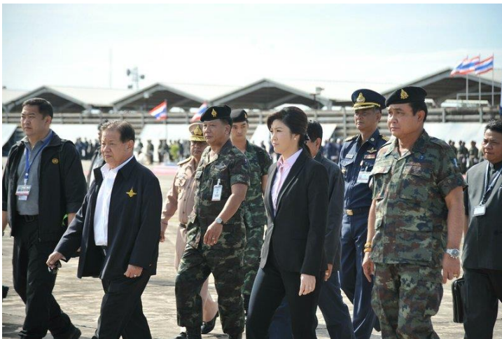
Thailand has had an unstable political system since adopting a constitutional form of government in 1932, resulting in 19 separate coups. Former Prime Minister Yingluck Shinawatra (right) pictured with the army chief Gen Prayuth Chan-ocha.

Few countries in the world are as divided as Thailand. Since assuming a constitutional style of government in 1932, Thailand has undergone 19 separate coups, one often more catastrophic than the other. 15 When the telecommunications billionaire Thaksin Shinawatra was elected Prime Minister in 2001, he promised the inclusion of the hitherto neglected rural poor. However, five years later, “Thaksin, beset with accusations of cronyism and graft, was ousted by the military and forced into exile”. 16 Then in 2011, Thaksin’s sister Yingluck assumed the leadership role and promised to carry on Thaksin’s agenda. Not more than 3 years into the role, she too was removed in a coup in May 2014 following months of violent protests and in September 2017 was found guilty of “dereliction of duty” thus being sentenced to five years in prison. 17