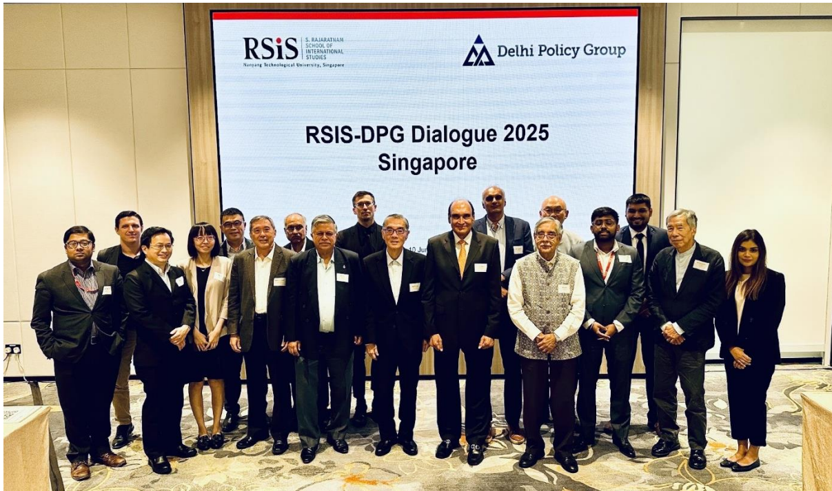
RSIS-DPG Dialogue 2025, Singapore