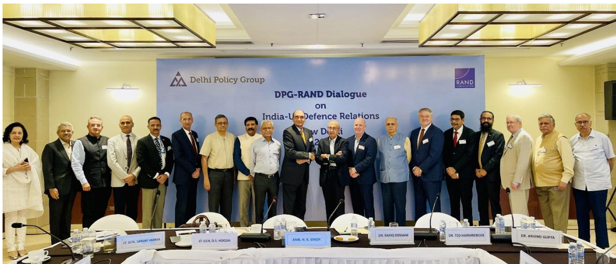
DPG-RAND Dialogue on India-U.S. Defence Relations