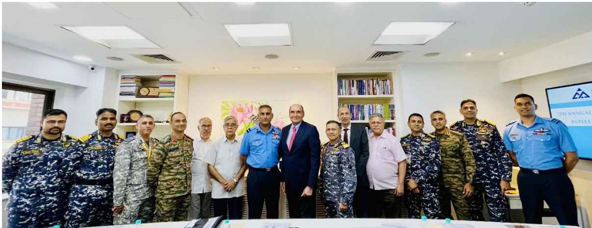
Seventh Delhi Policy Group–Defence Intelligence Agency Workshop for Defence Attachés (Designate)