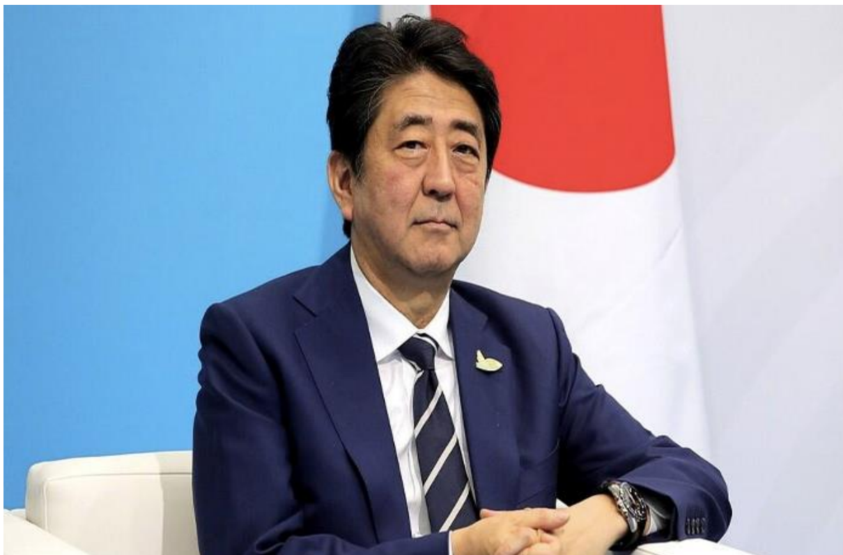
Shinzo Abe, Japan's longest serving Prime Minister.

Shinzo Abe, Japan's most transformational leader in a generation, has tragically fallen to an assassin's bullets. India has lost a trusted friend and champion of India-Japan partnership, Asia and the world a towering and charismatic statesman, and Japan a dynamic and inspired leader who ushered in political stability and set his nation firmly on the path of national renewal. He was Japan's longest serving prime minister, and even after leaving office for health reasons in September 2020, remained a powerful force in the ruling Liberal Democratic Party, leading its largest faction and laying down his life in an election campaign rally. Abe leaves behind an irreplaceable void, but also a legacy that will hopefully endure.