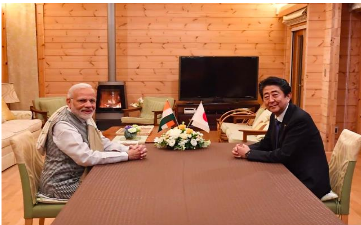
Prime Minister Narendra Modi at a dinner hosted by Japanese Prime Minister Shinzo Abe at his holiday home in Yamanashi, Japan on October 28, 2018.

After stepping down, Abe has continued to play an influential role in Japanese politics, strategic thinking, and foreign policy, often shaking up the country's staid political and bureaucratic establishment with new ideas, recent examples being nuclear weapons sharing with the US for more effective deterrence and calling upon the US to explicitly commit to the defence of Taiwan. His untimely death is likely to have an impact on the future direction of Japan's policy making, both domestic and external.