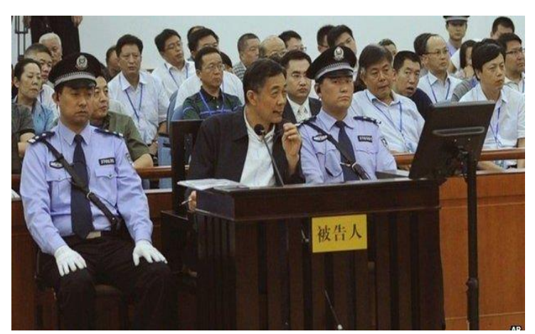
An undated photo of Bo Xilai, one of China's high profile officials, at a public trial.

First, the economic goal as before is to realize the twin CPC Centenary goals and become a nation with leading global influence by 2050. The anti-corruption campaign will continue its momentum. There will be a focus on fighting poverty, creating jobs and lowering housing prices. The economy will open further to trade and investment, there will be a more level playing field for foreign and Chinese businesses, and a shift towards market based interest and exchange rates. Xi will focus on promoting more balanced growth, a better quality of life, tackling the economic slowdown, improving governance, fighting bureaucratic inertia, reforming SOEs, promoting quality manufacturing, improving macro-regulation and boosting consumption.