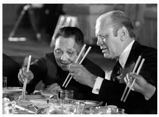
Chinese leader Deng Xiaoping is shown with US President Gerald Ford. Deng's dictum advising the Chinese leadership to lie low and bide its time has been abandoned by Xi Jinping for a more assertive foreign and security policy.

Third, China has never publicly repudiated Deng Xiaoping's foreign policy dictum "observe things serenely, respond and manage things calmly, hold our ground firmly, hide our capabilities and bide our time, accomplish our objectives." But China under Xi, has an active foreign policy that no longer hides its capabilities and does not shy away from a confrontation in asserting its "historical rights" and territorial claims. Similarly, Deng Xiaoping's proposal to "shelve disputes and pursue joint development", has been abandoned by Xi Jinping in favor of confrontation with littoral claimant States on the South China Sea issue, gray zone incursions and coercive pressures in the East China Sea, and periodic incursions on the land border with India.