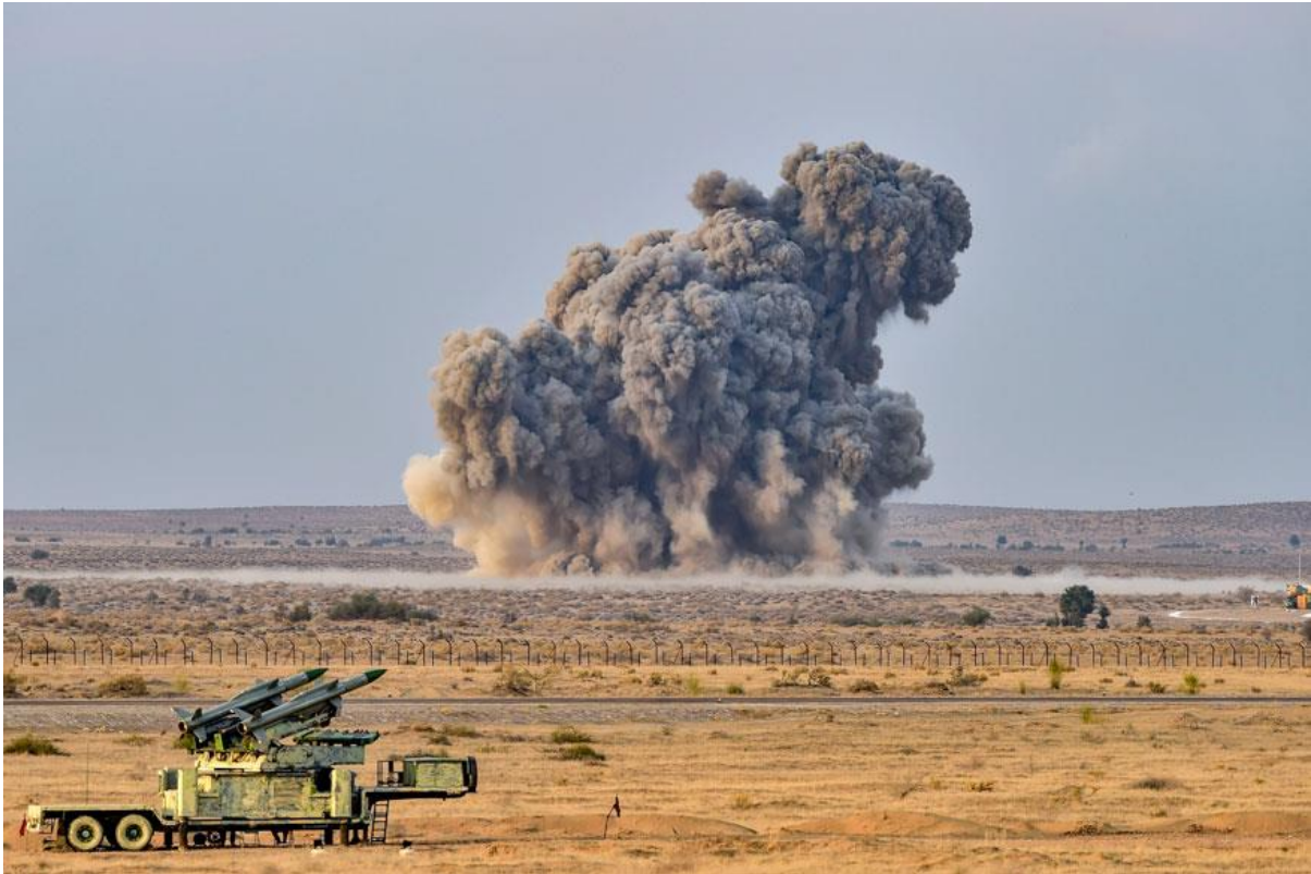
Indian Air Force demonstrates its combat and firepower during 'Vayu Shakti 2019' at Pokhran, Rajasthan.

INS Trikanth participated in the Exercise 'Cutlass Express-19' organised by U.S. Africa Command (USAFRICOM), and conducted by Naval Forces Africa (NAVAF), off the coasts of Djibouti, Mozambique and the Seychelles, from January 27-February 6, 2019. The objective of the exercise was to improve maritime law enforcement capacity, promote national and regional security cooperation in Eastern Africa, and shape security force assistance (SFA) efforts 3 .