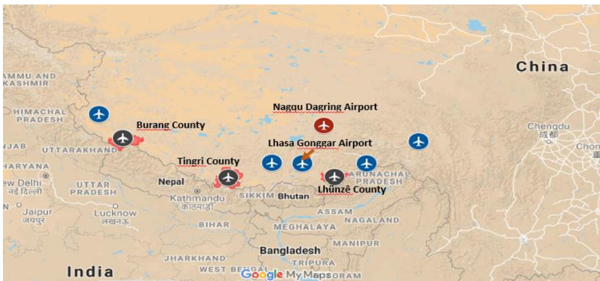
The proposed three new airports (in black).

The PLA is upgrading one of the civil airports in Gonggar in Tibet. It is also planning to build three new airports at Burang, Lhunze and Tingri in southern Tibet under '3+1 project' at a total cost of $2.6 billion, which is due to be completed by 2021.