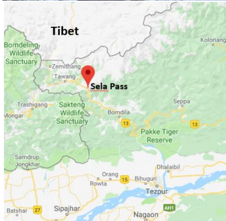
Sela Pass.

A Border Roads Organisation (BRO) Report indicates that 61 strategic roads, covering a total length of 4634 Km, are being constructed along India-China border. Significant among these are: a 35 Km road to the site of 2017 Doklam standoff in East Sikkim (likely to be completed this year) and a road connecting Leh-Darbuk to Daulat Beg Oldie (by 2020).