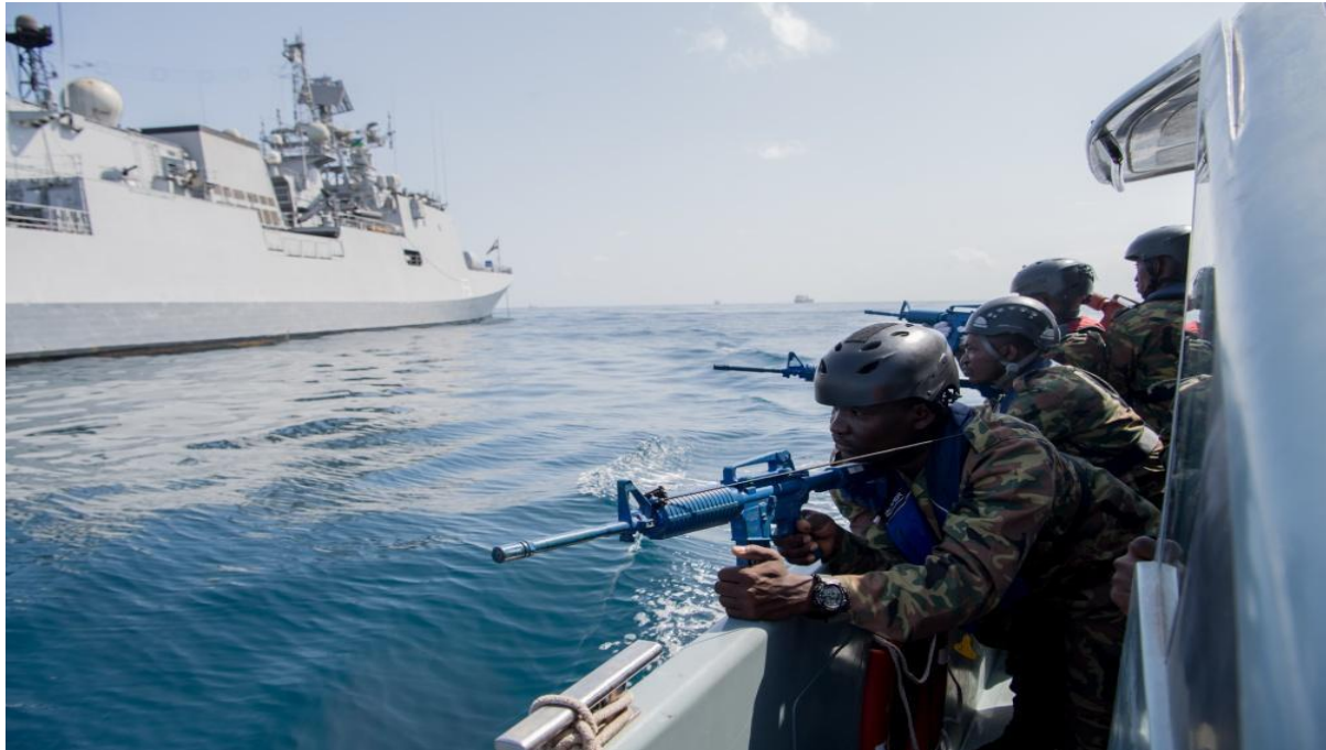
Comoros sailors prepare to participate in visit, board, search and seizure training aboard the Indian Talwar-class frigate INS Trikand (F 51) during exercise Cutlass Express 2019 in Djibouti, Feb. 4, 2019.