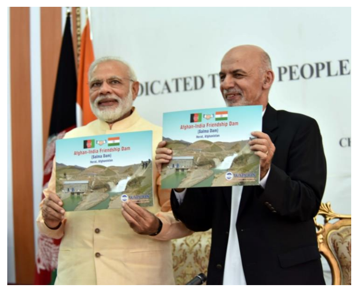
PM Narendra Modi jointly inaugurates the Afghanistan-India Friendship Dam at Herat with President Ashraf Ghani, June 4, 2016.

when that will ever happen." The search for a political solution will thus take a back seat to the more resolute pursuit of a military campaign. The American military would henceforth enjoy expanded delegation of operational authority and liberalized rules of engagement for "attacking our enemies, obliterating ISIS, crushing Al Qaeda, preventing the Taliban from taking over Afghanistan and stopping mass terror attacks against America before they emerge." America would also target terrorist networks with other financial sanctions and law enforcement actions.