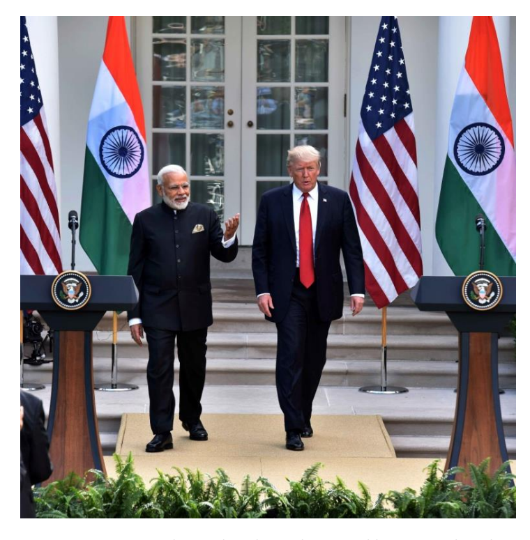
Prime Minister Narendra Modi and President Donald Trump at the White House in Washington D.C. on June 26, 2017.

demeanour of a commander-in-chief, he exhorted America to heal its divisions at home in order to be a force for peace in the world and to defend itself from enemies abroad. He connected with his nativist support base by affirming America's unshakeable resolve to defeat terrorism, as well as by distancing his foreign policy of "principled realism" from liberal order pursuits of the past. From this realist perspective, Trump asserted that America will henceforth be guided primarily by its security interests and not by normative pretensions of nation building abroad.