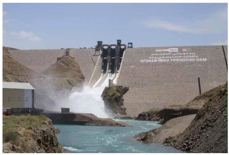
The Afghan-India Friendship Dam, inaugurated by PM Narendra Modi on June 4, 2016, is seen as a sign of hope to bring economic prosperity to the Herat region.

Asia, but the fact remains that targeting terrorist sanctuaries in Pakistan is equally important to Afghanistan's stability and survival as it is to India's security interests. Concerns about Paksponsored cross-border terrorism are also a primary factor which frustrates India's initiatives for broader regional cooperation in South Asia, free from the threat of terrorism. US sensitivity towards and closer coordination on India's Af-Pak security concerns will open up more room for the India-US partnership to progress, in South Asia as well as the broader Indo-Pacific region.