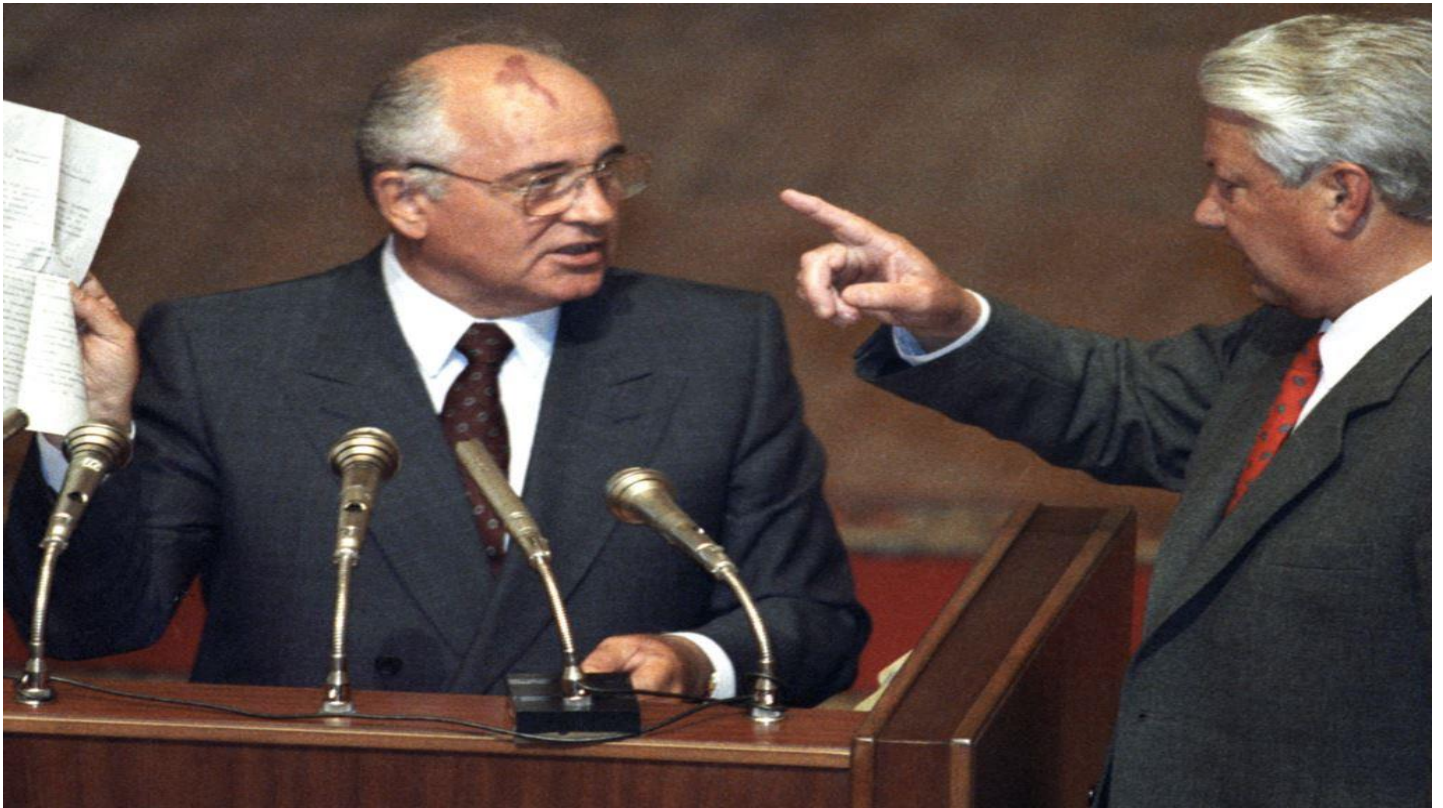
Yeltsin confronting Gorbachev in 1991.