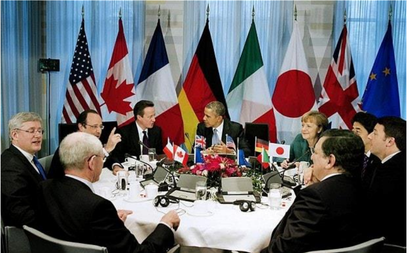
G-7 Leaders meeting in the Hague in March 2014, having suspended Russia from the G-8.

The geopolitical window that Abe sought to take advantage of was also created by other developments – the G-7 was too preoccupied by other issues to object to Abe's efforts at a rapprochement with Russia. The UK was in the midst of an identity crisis over Brexit, France was facing a crisis from terrorism and the decline in domestic support for President Hollande, Germany was facing a domestic backlash to the refugee crisis and Italy its own financial difficulties.