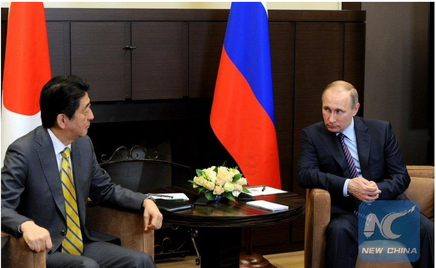
Russian President Vladimir Putin meets with visiting Japanese Prime Minister Shinzo Abe in Sochi, Russia, on May 6, 2016.

During his May 2016 visit to Sochi, Abe announced a "new approach" towards negotiations with Russia. Instead of merely pressing its territorial claims, Japan would now focus on getting the best deal with Russia. This package of economic cooperation and a willingness to compromise over territory found a positive resonance with Putin. After meeting Putin in Sochi on May 6, 2016 Abe reaffirmed that the two leaders were seeking "a new approach, free of any past ideas."