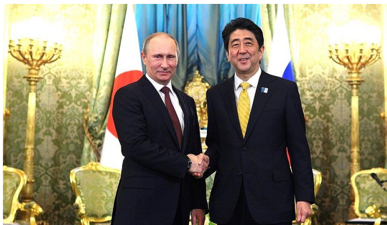
Japanese Prime Minister Shinzo Abe and Russian President Vladimir Putin greeting each other in Moscow during Abe's April 2013 visit.

Abe's visit to Moscow from April 28-30, 2013 was the starting point for the present phase of Japan-Russia relations. On March 1, 2012 four days before he was re-elected President of Russia, Vladimir Putin stated that he wanted to improve relations with Japan by strengthening economic ties and resolving the territorial issue on the basis of a "draw" or hikiwake - a term borrowed from the Judo vocabulary. Clearly, Putin was hinting at a solution to the territorial issue that was not a victory for either side but a compromise.