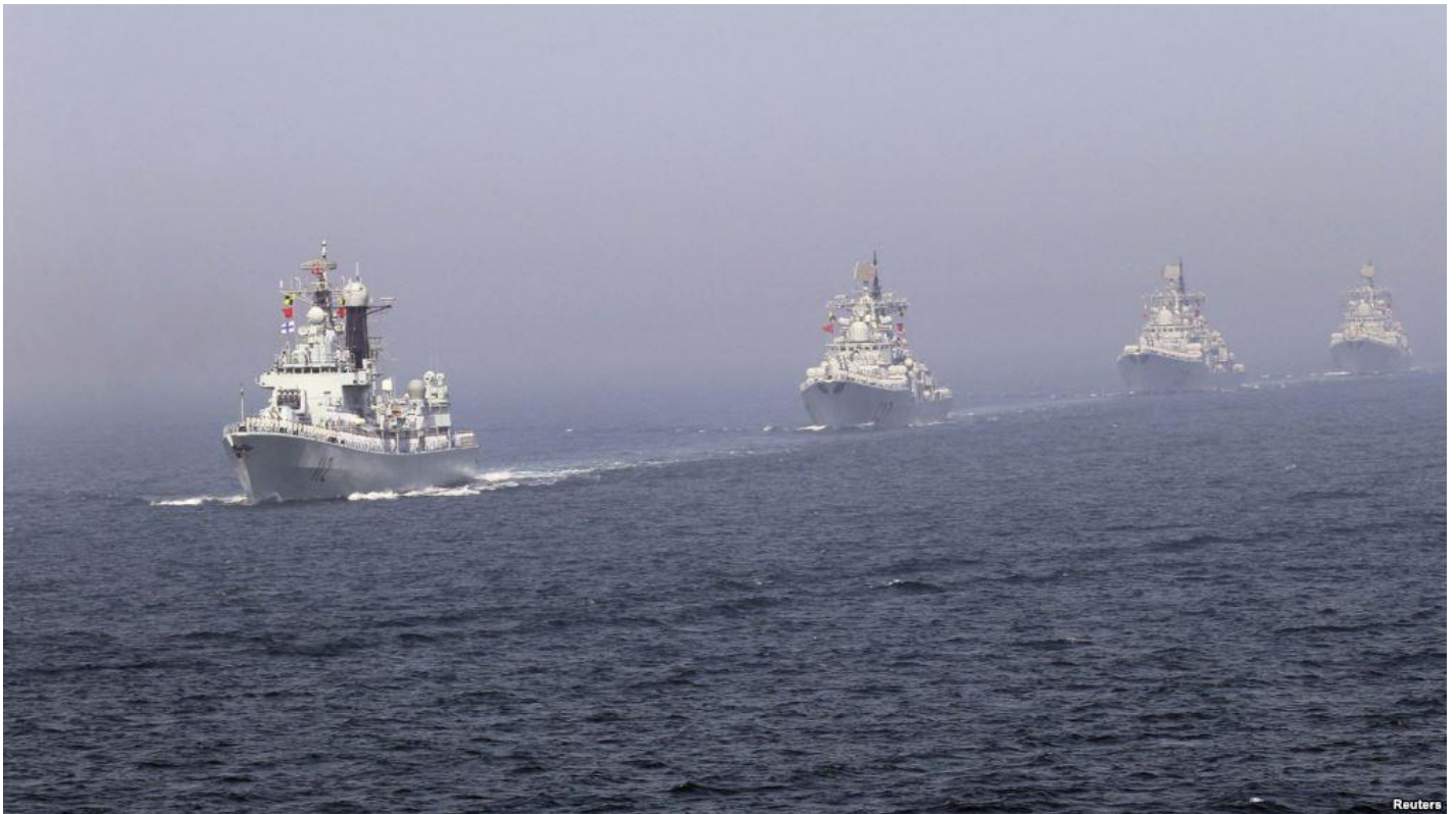
A China-Russia joint naval exercise in the Yellow Sea

other countries. Russia entered into joint production arrangements with India, while selling defense equipment to China. Russia supplied a downgraded version of the Sukhoi SU-30 fighter to China while supplying India with an upgraded one. China later obtained from Ukraine the same Soviet era defense technology that Russia refused to sell to China. From this, one can deduce the lack of trust Russia has in its military cooperation with China.