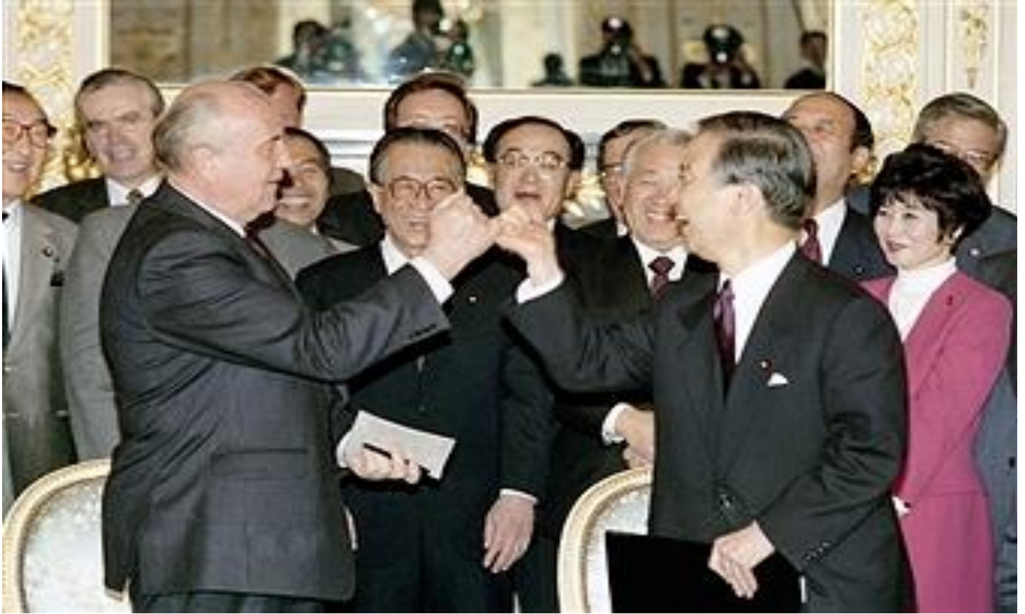
President Mikhail Gorbachev and Japanese Prime Minister Toshiki Kaifu seen together during the former's visit to Japan in April 1991

Gorbachev rejected Ozawa's proposal. Gorbachev told Ozawa that he was