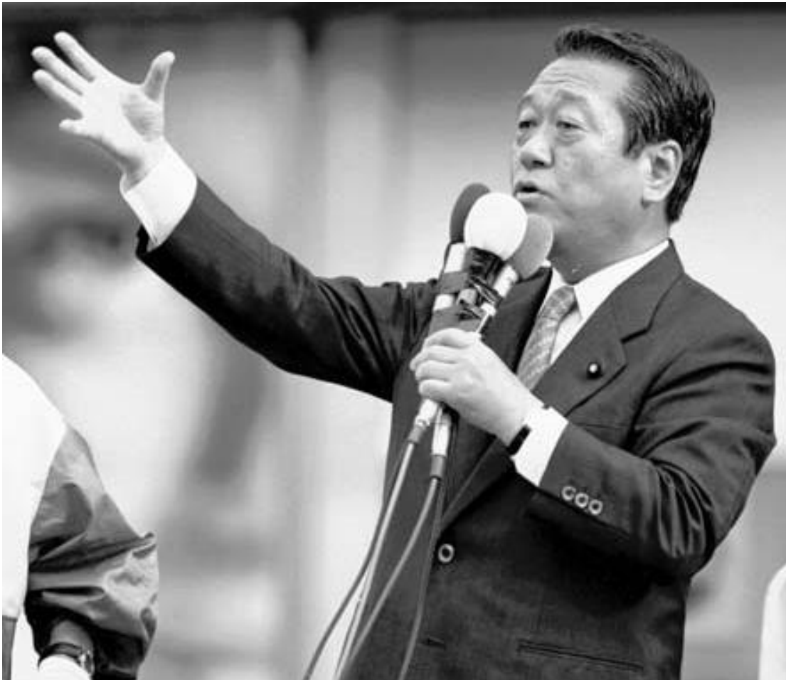
Ichiro Ozawa, the then Secretary General of the Japanese Liberal Democratic Party, photographed in 1991.

In March 1991 6 , the Secretary General of the ruling LDP in Japan, Ichiro Ozawa, established a back-channel and visited Moscow and proposed concessions by the Soviet Union on the islands issue, offering credits in return. The tradeoff was to be explicit from the beginning and Japanese aid was to be granted only if the Soviet Union agreed to give up all four islands