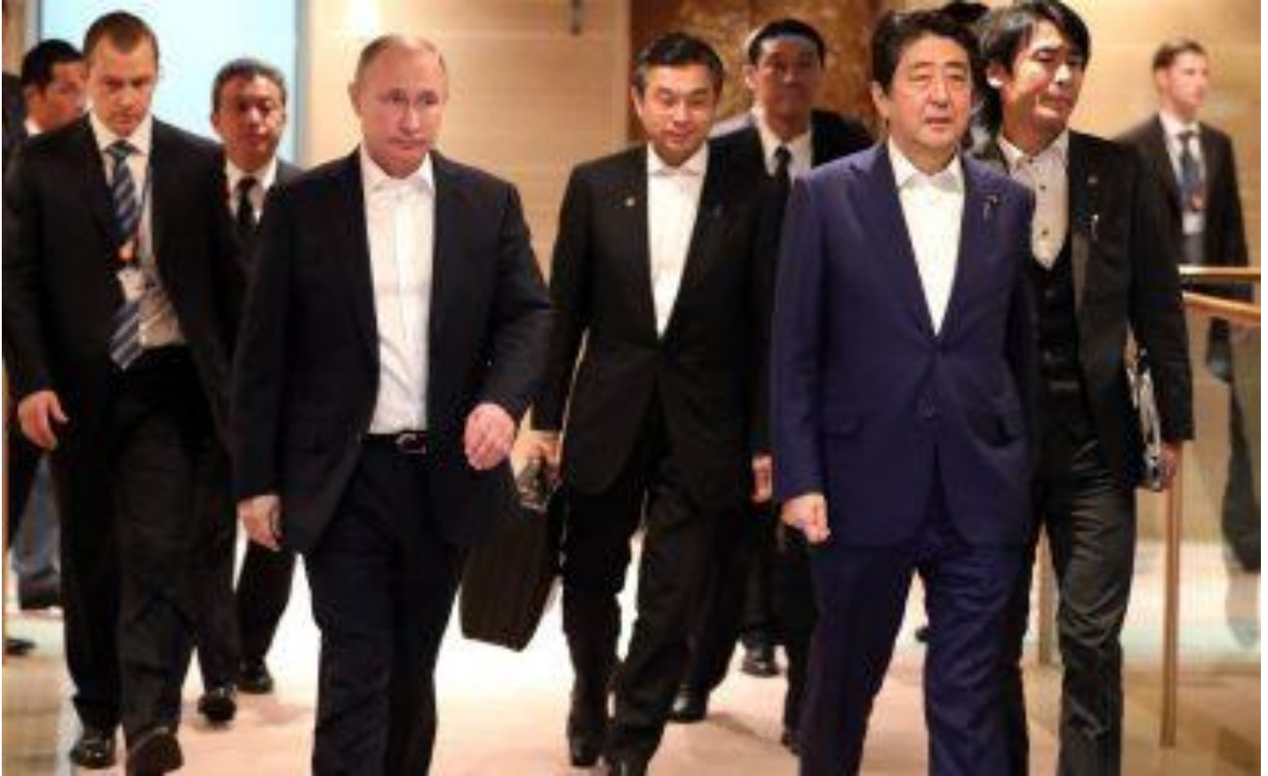
President Vladimir Putin and Prime Minister Shinzo Abe surrounded by aides during the former's December, 2016 visit to Japan.

The optics of the visit were also unfavorable from the Japanese point of view. Prior to the visit, Putin rejected a Japanese legislator's gift of a male Akita dog to join the female dog he had received four years ago. Putin also kept Abe waiting and arrived in Japan two hours late. Later, Putin turned down Abe's invitation to enjoy local food and relax in the onsen after the talks.