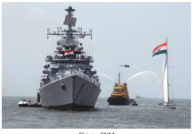
Ships – SNM http://www.southreport.com/indian-navy-facts/

This paper is an attempt to highlight the weaknesses in existing defence management our structures, procedures. threat evaluation and capability development. The need of the hour is to institutionalise a national security and defence planning process to provide coherent strategic guidance that will in turn become the rationale for formulating acquisition plans. Similarly, the entire defence planning and acquisitions processes must conform to the mission needs and matching capabilities required by the armed forces. Synergising the functioning of the Ministry of Defence and the Services is а vital imperative.