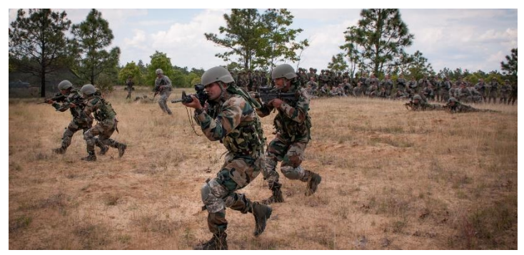
Forest Exercise – News World India <u>http://www.newsworldindia.in/public/media_uploads/media13u4battali</u> <u>on.jpg</u>

years after independence and after incurring huge expenditures on creating defence manufacturing and R&D capability. Resultantly, nearly 70 percent of military equipment, including major platforms and critical systems, continue to be imported.