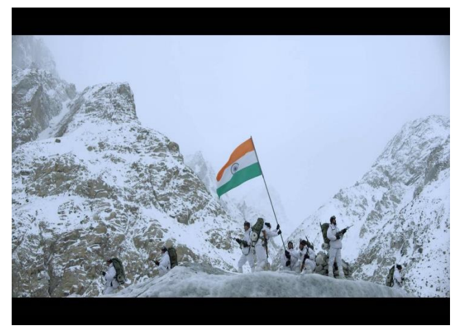
Mountain Exercise https://i.ytimg.com/vi/z29GOIbFBmA/maxresdefault.jpg

five year plans or the LTIPP. This results in incremental capability enhancement and that too mostly in terms of modernisation. Sadly, in the absence of strategic guidance, acquisition priorities are not based on overall national threat assessments. A classic case is the raising of the 17<sup>th</sup> Mountain Corps for the Army. This was to be a Rapid Reaction Force, complete with air assault formations, integral heli-lift capability and light mountain artillery, capable for rapid build-up and quick insertion. What we have got instead is a normal mountain formation with limited operational capability.