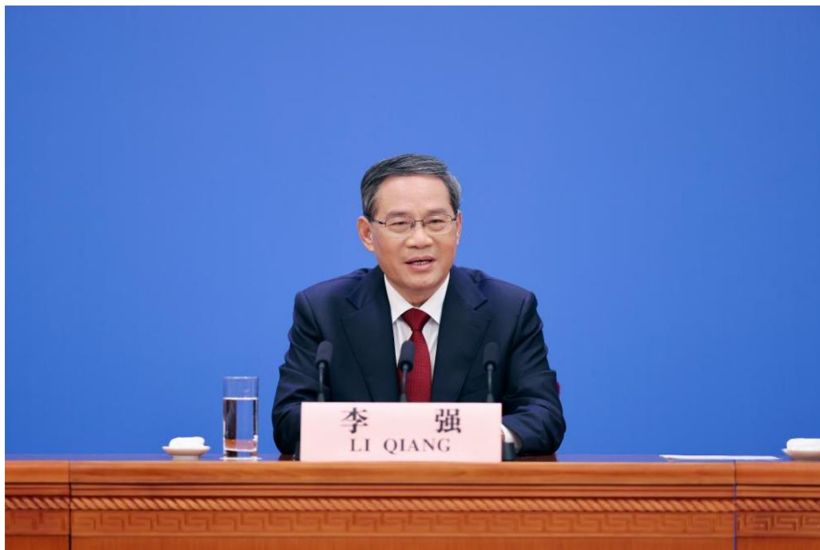
China's new State Council Premier 'Li Qiang' addressed a press conference during the first session of the 14 th National People's Congress in Beijing on March 13, 2023.

pledged greater opening-up with redoubled efforts to achieve the economic growth target of “around 5 percent” in 2023. 57 ‘State Council’ is likely to have a weaker role in national decision-making as Premier Li Qiang called upon the government to “ensure sound and faithful implementation of plans and decisions of the CPC Central Committee”. 58