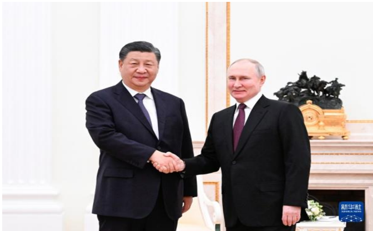
Chinese President Xi Jinping meets Russian President Vladimir Putin in Moscow on March 20, 2023.

now there are changes [in the international order] the likes of which we haven't seen for 100 years and we are the ones driving these changes together ". 42