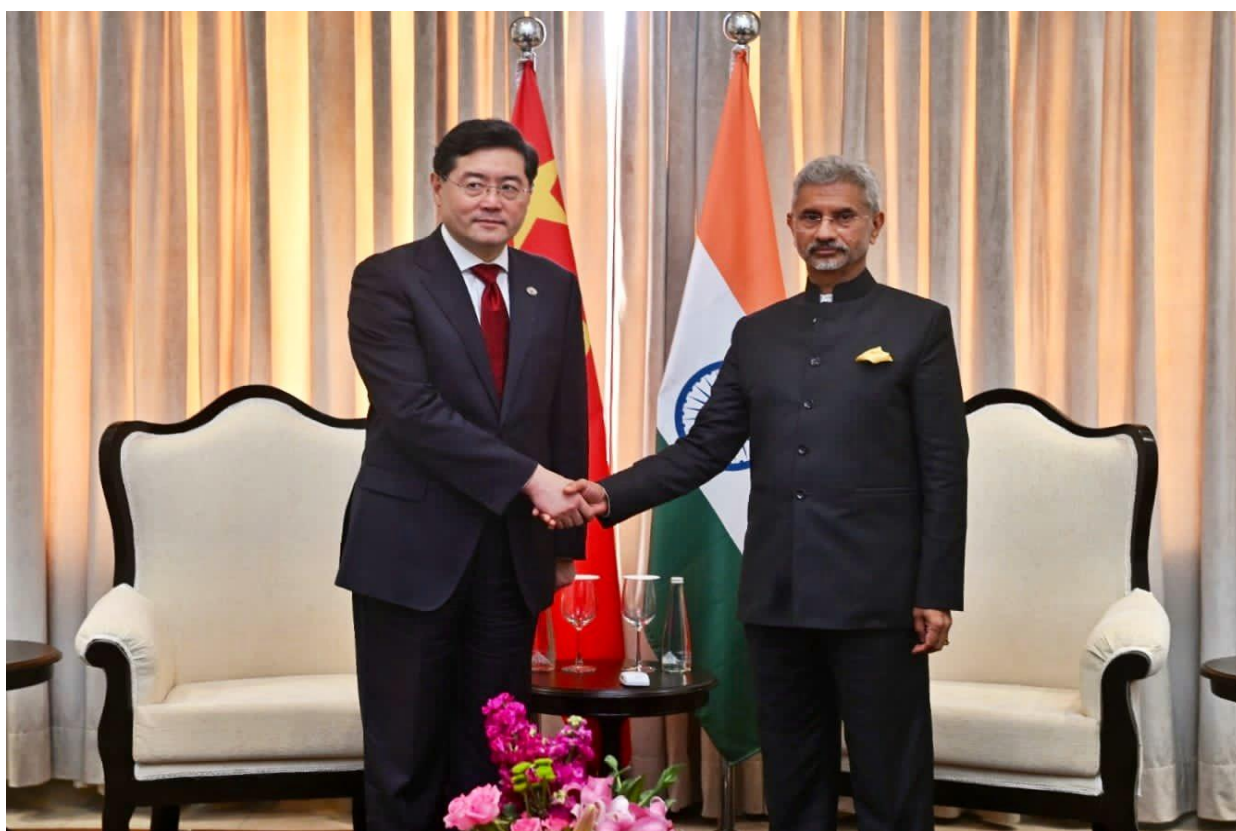
India's External Affairs Minister Dr. S. Jaishankar met Chinese Foreign Minister Qin Gang on the sidelines of the G20 Foreign Minister's Meeting in New Delhi on March 2, 2023.

External Affairs Minister Dr. S. Jaishankar met Chinese Foreign Minister Qin Gang on the sidelines of the G20 Foreign Ministers' meeting in New Delhi on March 2, 2023. During the subsequent press meeting, Dr. Jaishankar emphasised that the “thrust of the meeting” was to review the challenges confronting bilateral relations, in particular, “peace and tranquillity in border areas”. 1 In a subsequent remark at a media conclave on March 18, Dr. Jaishankar described the situation along the Line of Actual Control (LAC) as “very fragile” and “quite dangerous”. 2