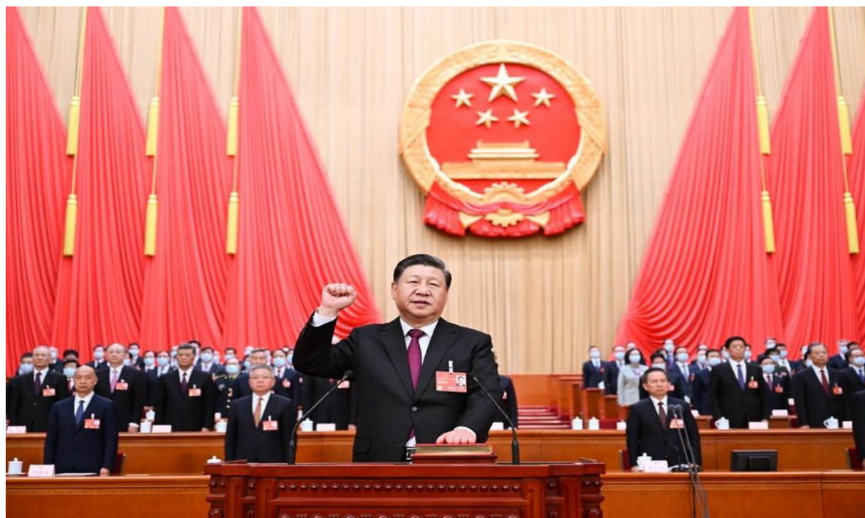
Xi Jinping, elected President of the People's Republic of China (PRC) for the third term pledges allegiance to the country's Constitution on March 10, 2023.

In his address to the NPC , President Xi stressed on “upholding the CPC leadership”, “building China into a great modern socialist country in all respects”, “advancing high-quality, innovation-driven development”, “coordinating development and security”, “advancing the policy of one country, two systems”, and “adhering to the one-China principle by resolutely opposing Taiwan independence separatist forces”. 53