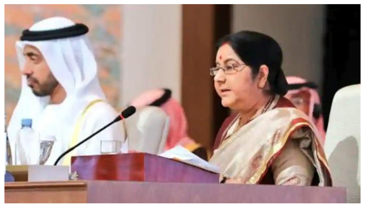
Mrs. Sushma Swaraj, India's Minister of External Affairs, delivers her address as guest of honour at the 46th Session of the Council of Foreign Ministers of the Organisation of Islamic Cooperation (OIC) in Abu Dhabi, March 01, 2019.

India's attack on a Jaish-e-Mohammad (JeM) terrorist camp in Balakot (Khyber Pakhtunkhwa Province), flying across Pakistani air space and beyond Pakistan Occupied Kashmir (POK), has finally put Pakistan's strategy of single rung Thus far, the Pakistani military and ISI have been escalation to rest. perpetrating their proxy war of cross-border terrorism against India, secure in their belief that India's conventional response calculus will remain stymied by the Pak nuclear strategy of "full spectrum deterrence".