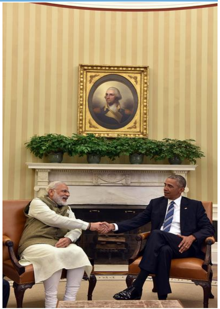
Prime Minister Narendra Modi and US President Barack Obama in the Oval Office on June 07, 2016

The summit marked further advances on counter terrorism, with a commitment to deepen collaboration against the full spectrum of terrorist threats and the finalization of an arrangement to facilitate the sharing of terrorist screening information.