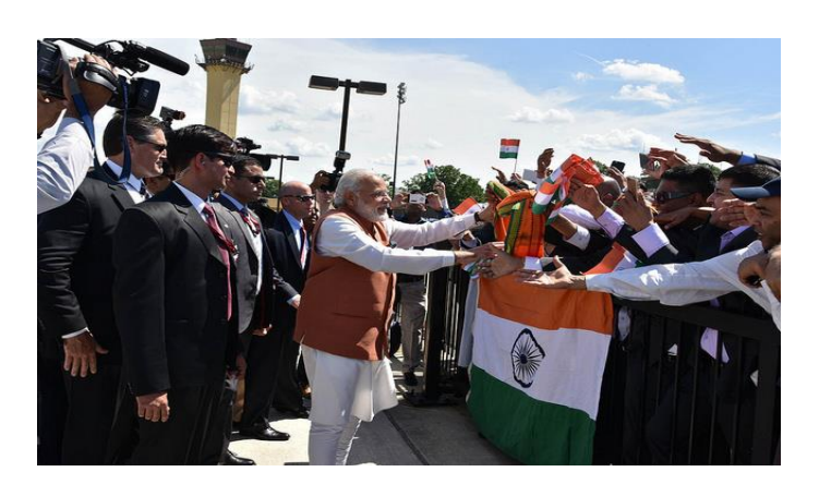
Prime Minister Narendra Modi's US Visit, June 06-08, 2016

capability, has successfully forged a strong strategic partnership with the United States. The India-US Joint Statement on June 7 defined the following eight major areas of collaboration between the two countries: advancing global leadership on climate and clean energy; clean energy finance; strengthening global non-proliferation; securing land, maritime, air, space and cyber domains; standing together against violent extremism; bolstering economic and trade ties; expanding cooperation in science and technology; and continued global leadership in achieving sustainable development goals. While each of these eight areas has significant potential for collaboration, the latest India-US Summit has paved the way for three immediate advancements.