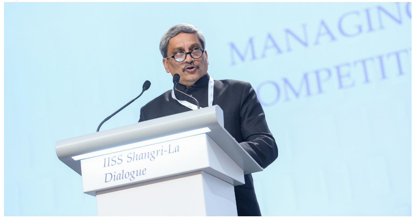
DEFENCE MINISTER MANOHAR PARRIKAR AT THE SHANGRILA DIALOGUE, 04 JUNE, 2016

Kingdom (UK), and is thus often referred to as the 'Davos of International Security'.