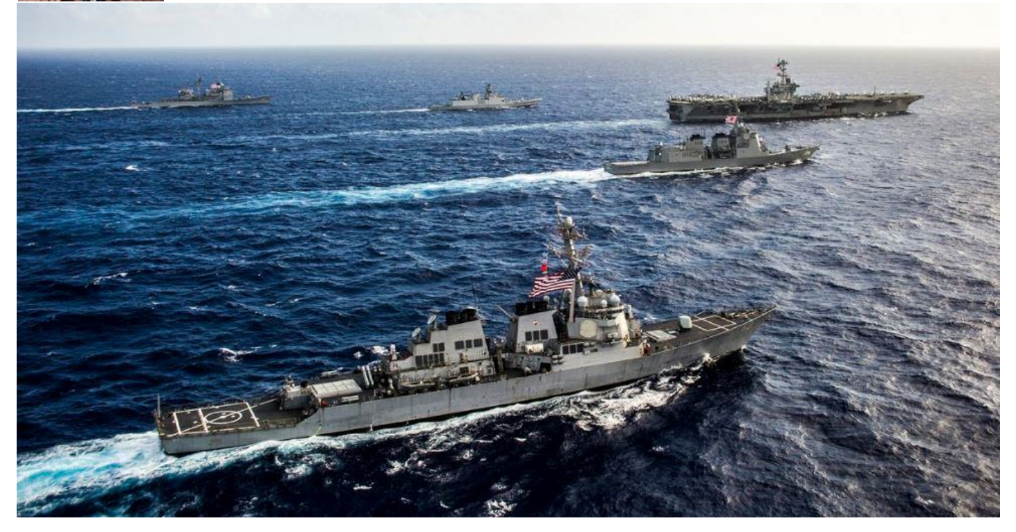
Nimitz class super Carrier USS John C. Stennis with Destroyer Squadron in coy CVN 74 on the way for Malabar 2016, on June 09.

The Malabar Exercise is today a trilateral naval exercise conducted by the navies of India, Japan and the US. The primary aim of this exercise is to increase interoperability amongst the three navies and develop common understanding of procedures for Maritime Security and Humanitarian Assistance and Disaster Relief operations.