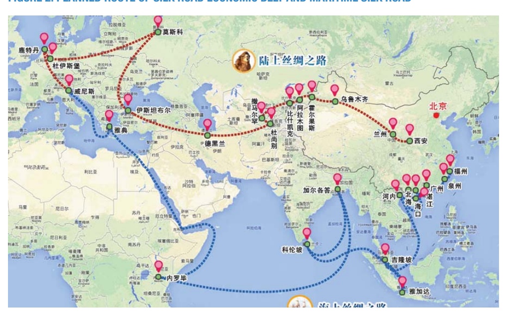
FIGURE 2: PLANNED ROUTE OF SILK ROAD ECONOMIC BELT AND MARITIME SILK ROAD

China has unveiled further particulars of its plans for a Silk Road Economic Belt (SREB) and Maritime Silk Road (MSR), two interlinked regional connectivity mega-initiatives that would see the creation of rail, road, air and sea links as well as energy infrastructure connecting China to the Middle East, Africa and Europe through landlocked Central Asia and the littoral South and South-East Asian states. Initially announced by President Jinping during his visit to Central Asia in the fall of 2013, China has since signed energy agreements of USD 50 billion in Central Asia, and pledged USD 327 million in aid to Afghanistan, part of which is to be used to fund the construction of road, railway lines and power generation facilities.<sup>37</sup> Afghan and Central Asian policymakers are enthused about the potential for the projects to open up their economies to global markets, deepen regional connectivity by removing transport and transit bottlenecks, and finance and develop their infrastructure to spur economic growth.